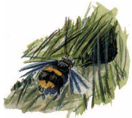
Queen Bumble Bee searching for nest site in tussock