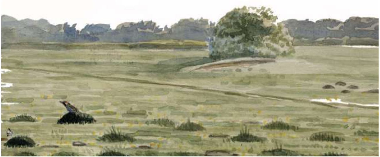
Ideal sward structure in spring