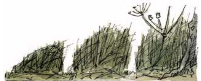
Too many clumps and tussocks from previous season