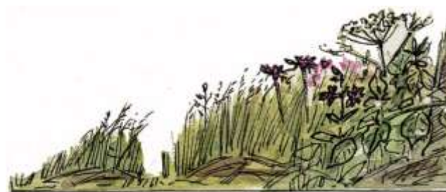
Cross-section of field margin structure