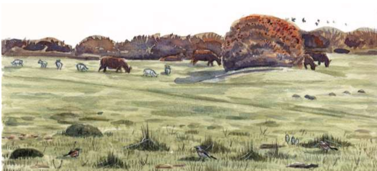
Most of the field should look like this