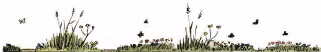
Cross-section of what the field should look like