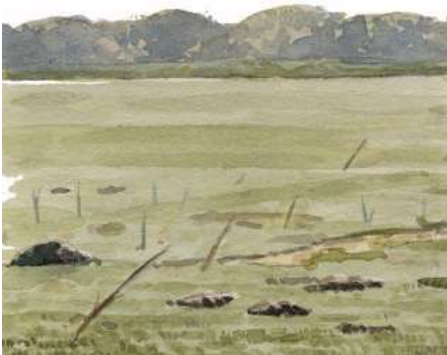
Sward too short

There is little or no cover for invertebrates and mammals and the bare ground will encourage germination of annual plants including notifiable weeds such as thistle, dock and ragwort.