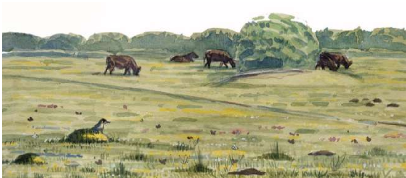
Most of the field should look like this...