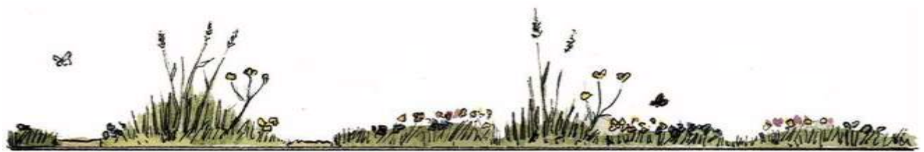
Cross-section of how most of the field should be