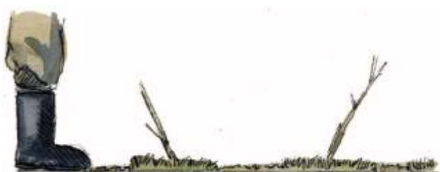
Cross-section of too short sward