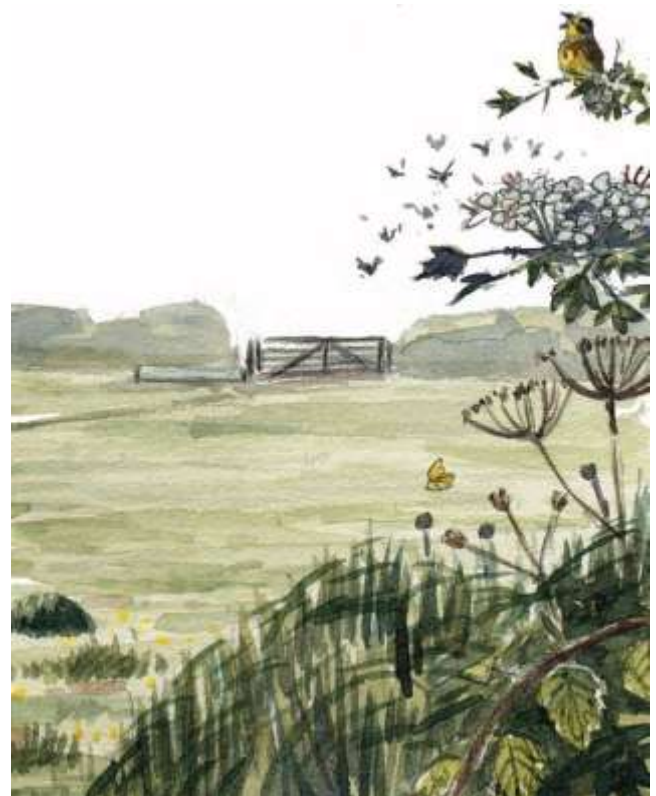
Only small areas of the field should be long

Apart from a 1-3 m fringe around boundaries and around areas of scrub, only very small areas should be this long.