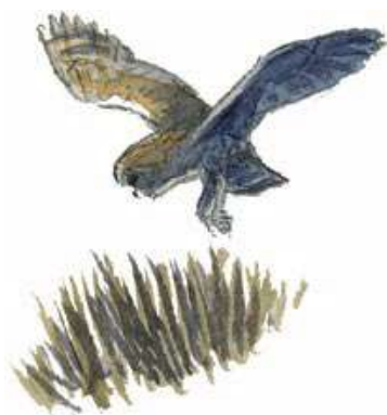
Hunting barn owl