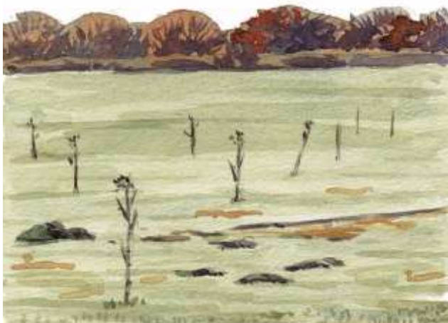
Too short for the main area of the field

Only small areas of the field should be this short. There is no over-winter cover for invertebrates, amphibians, reptiles or small mammals. However, short swards may be used by wintering birds such as lapwing and golden plover for feeding and roosting.