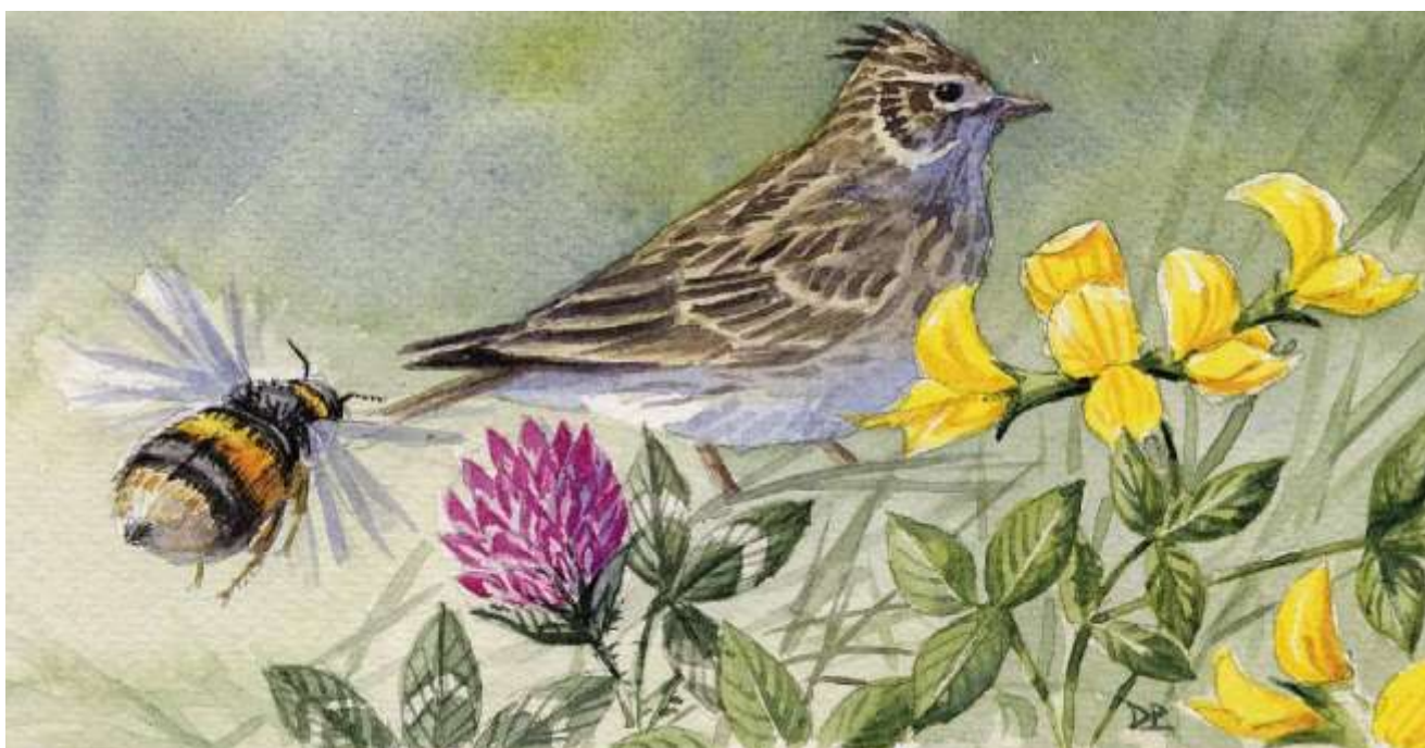
Traditional species of neutral grassland include skylark, bumble bee, birds-foot-trefoil and red clover

Neutral grassland grazed by livestock can be a valuable habitat for many small birds, mammals, insects and other invertebrates. The key to providing opportunities for these animals, and for wild flowers, is to get the sward structure right at key times of the year. This guide illustrates what the sward should look like in the spring, just as the stock are going out to graze; in the early summer when many wild animals will be breeding and the majority of plants will be in full flower; and in autumn as the stock come off the land for the winter.