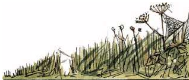
Cross-section of sward too long