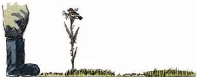
Cross-section of sward too short