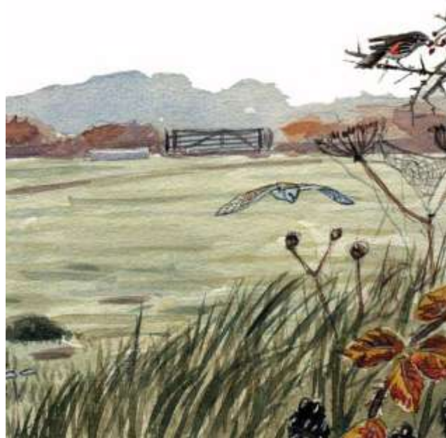
Too long for the main area of the field

Apart from a 1-3 m fringe around boundaries and scrub, only very small areas should be this long. Tall vegetation provides vital places for invertebrates, small mammals and amphibians to hibernate, but a rank sward will swamp smaller wild flowers the following spring.