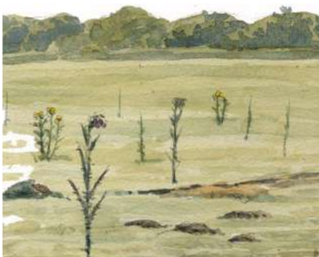
Sward too short

Only small areas of the field should look like this. There are few flowers, little nectar for insects and little or no cover for invertebrates and other animals, particularly if the field margins have been grazed out.