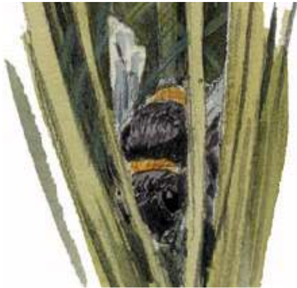
Queen bee hibernating in tussock