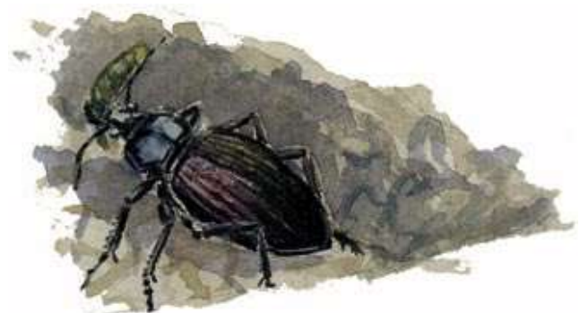
Violet Ground Beetle hunting on bare ground