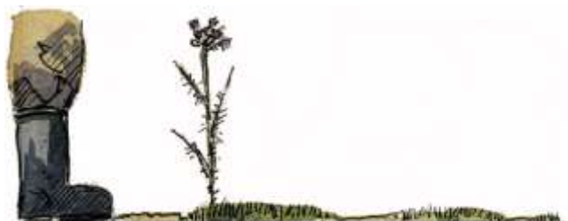
Cross-section of sward too short