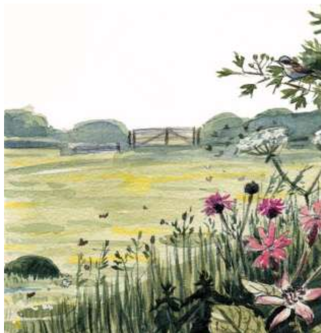
Taller areas should be restricted to the margins

Taller field margins provide important food and shelter for invertebrates, amphibians and small mammals, but apart from a 1-3 m fringe around boundaries and scrub, only very small areas should be this long or the smaller wildflowers smothered by grass growth. There will be no open bare ground for invertebrates to feed or breed.