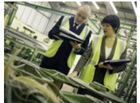
ENWORKS employees conduct an environmental audit of a small business.