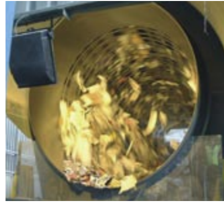
Paper recycling – waste minimisation is one of the ways SMEs can improve their efficiency.

The CBI supports the view that economic growth can be consistent with a better environment and that the drive for a better environment is a commercial issue.