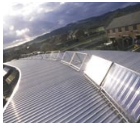
Integrating environmental features in new social housing.