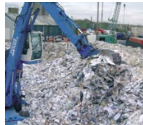
Waste paper recycling saves resources and generates jobs.