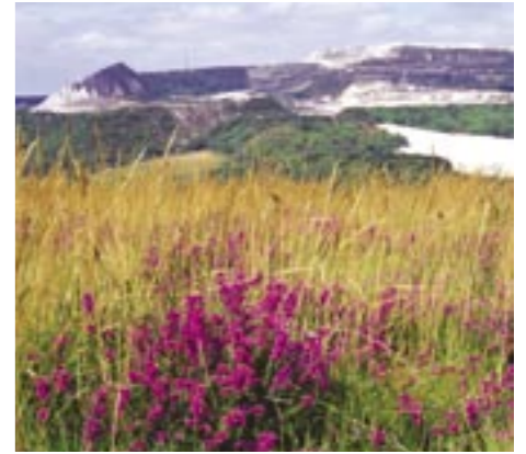
Land remediation restores valuable natural resources, adding economic value to the affected area.

“We need a major shift to deliver new products and services with lower environmental impacts across their lifecycle, while at the same time boosting competitiveness” 23 .