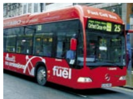
Zero-emission fuel-cell bus on trial in London.

The UK industry is well placed to exploit this huge and expanding global market. In Wales, for example, it is estimated that 12,600 additional jobs could be created by 2010 in waste management, renewable energy and public sector green procurement, equivalent to almost 10% of the employment growth targets set out in the Welsh national economic development strategy 26 .