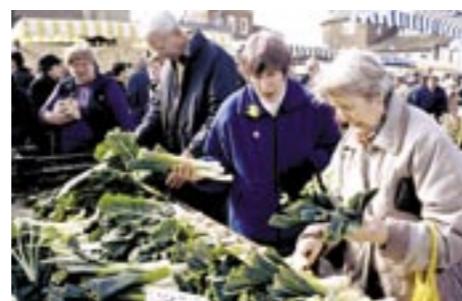
Sustainable agriculture and local produce benefit the rural economy.