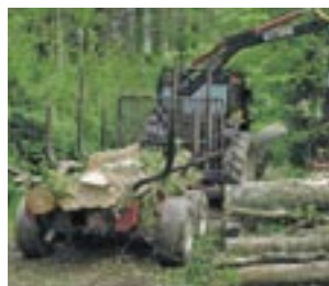
Sustainable woodland management and timber production.

Generating jobs and income from sustainable woodland management