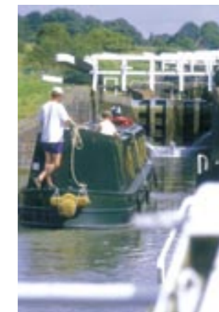
Kennet and Avon Canal restoration.