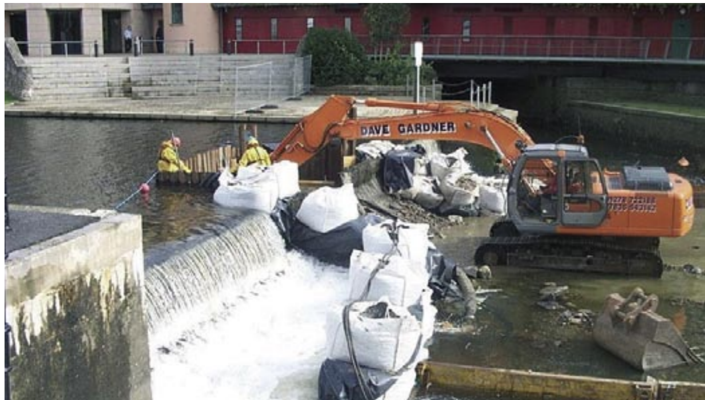
Fish pass installation.

The annual number of visitors to just five Royal Society for the Protection of Birds reserves has been estimated at over 1,080,703 people, spending £11,802,000 15 .