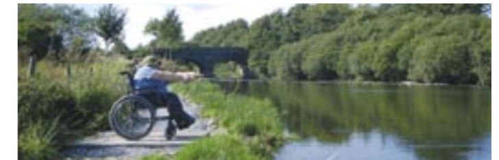
Fishing Wales has resulted in social, economic and environmental benefits.