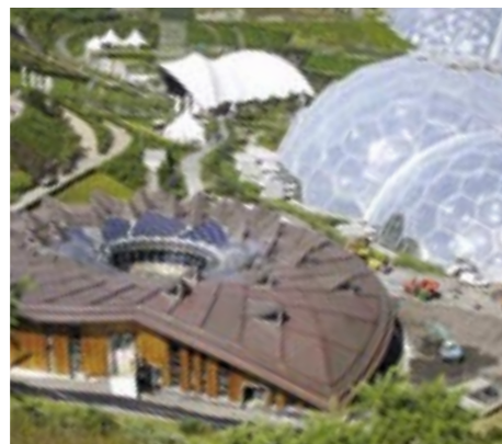
Eden Project, Cornwall.