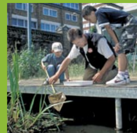
Raising environmental awareness in inner city areas.

“Taking care of the environment should remain an important dimension of the [Lisbon] strategy as it can both constitute a source of competitive advantage in global markets and increase competitiveness” 27 .