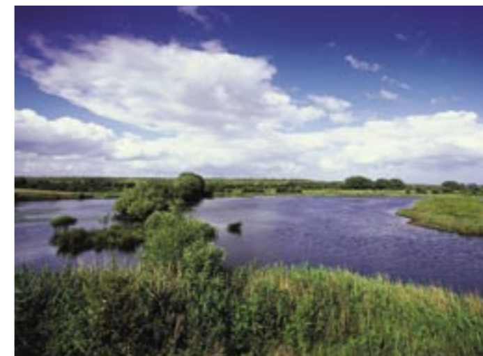
Dearne Valley post-restoration.