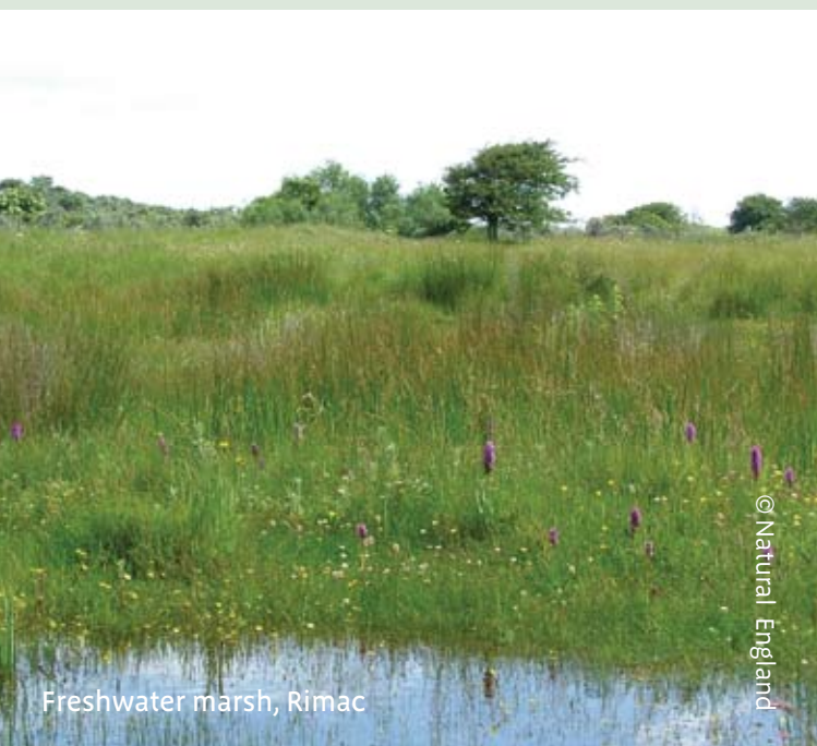
Freshwater marsh, Rimac

Together, the sand, mud and saltmarsh at Saltfleetby provide food and refuge for the many birds that visit our shores from the arctic, over winter. Ringed plover and sanderling eat the small sandhoppers and shellfish found at the sea's edge, while curlew probe the mud for lugworms, brent geese graze the saltmarsh grass and flocks of twite and snow bunting feast on the seeds of the saltmarsh plants.