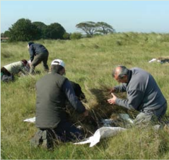
Volunteers at a moth event

The reserve is managed by Natural England in partnership with the Lincolnshire Wildlife Trust and the Ministry of Defence.