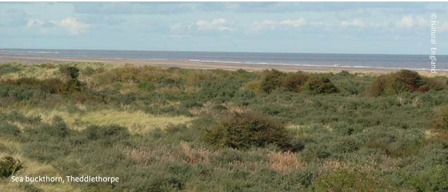
Sea buckthorn, Theddlethorpe

The dense sea buckthorn, hawthorn and elder scrub which cover the dunes here are ideal nesting sites for whitethroat, willow warbler and blackcap, as well as producing winter berries for visiting thrushes through the winter.