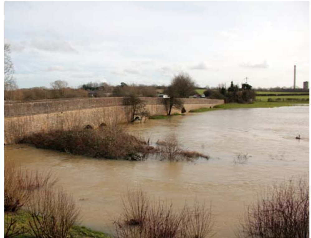
River Cherwell in flood.