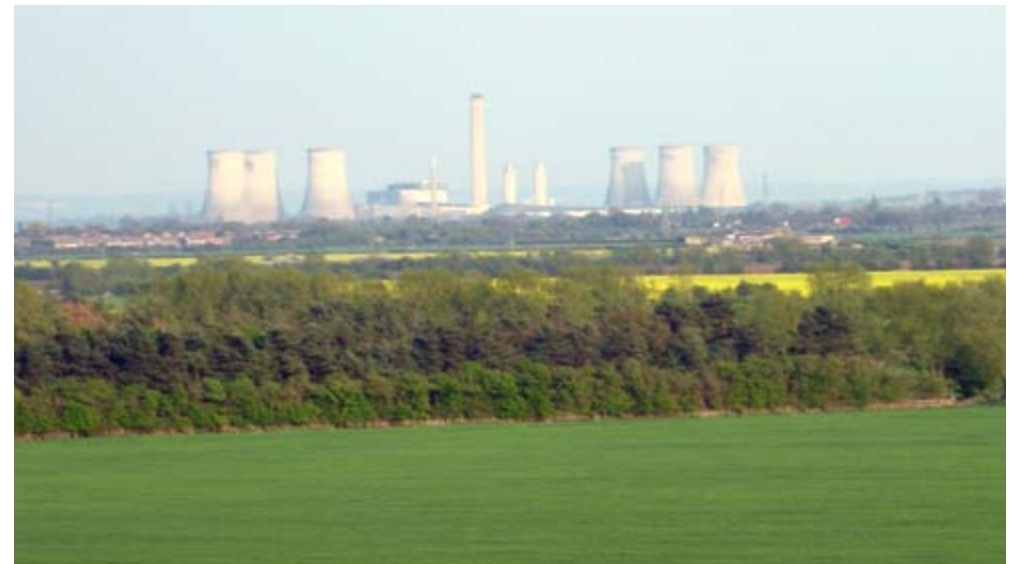
Didcot power station.