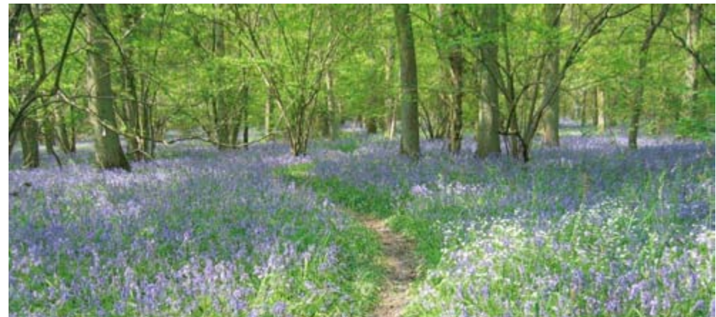
Bluebells at Pinsley Wood.