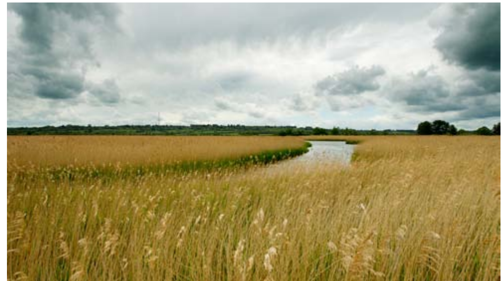
Otmoor is a large area of reedbed supporting a diversity of birds and other wildlife. Open water and semi-natural wetland habitats are characteristic of this area.

The Vale of White Horse is a belt of heavy blue-grey Lower Cretaceous Gault Clay with exposures of underlying Jurassic Kimmeridge Clay, drained by the rivers Ock and Thames. South of Swindon, the Vale slopes down from the Berkshire and Marlborough Downs forming a clay plain, occasionally broken by minor hills of Greensand or Portland Limestone. Notable outliers of Chalk rise as hills near Dorchester and Cholsey. The area supports mainly arable farming with some pasture, producing a field pattern of large, regular fields with few hedgerows or trees. Villages such as Baulking and Goosey built around distinctive greens are located along the Ock Valley. Fruit orchards around Harwell thrive on light, fertile, sandy soils developed over the Greensand bench at the foot of the Chalk escarpment.