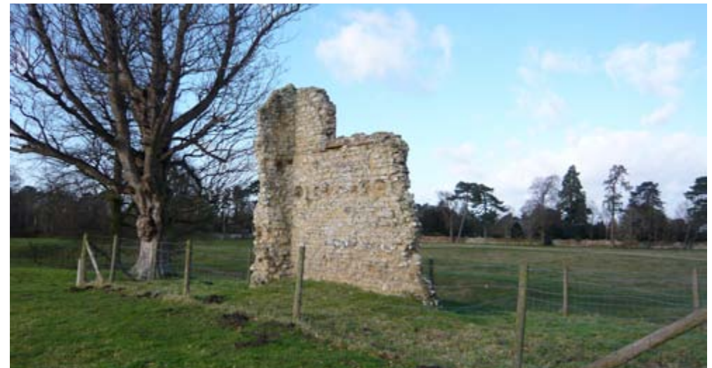
In the floodplains, settlement has long been focused at river crossing points, as illustrated by the castle remains at Wallingford beside the Thames.