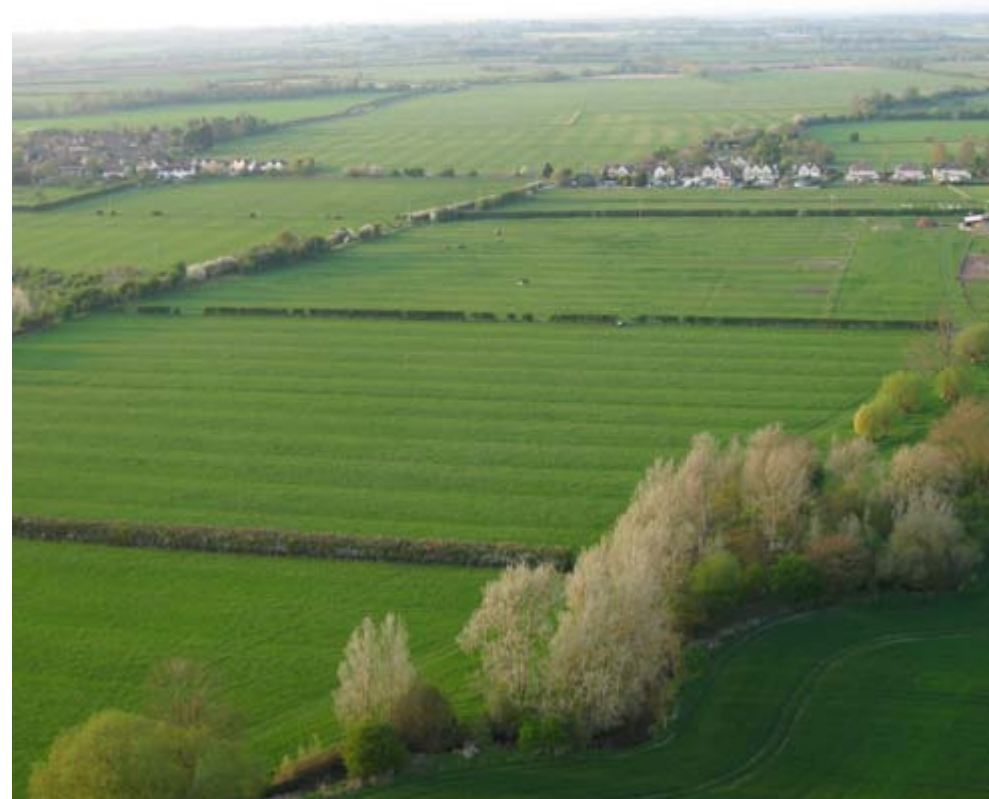
Field pattern in the Didcot area.

Please note: (i) Some of the Census data is estimated by Defra so will not be accurate for every holding (ii) Data refers to Commercial Holdings only (iii) Data includes land outside of the NCA belonging to holdings whose centre point is within the NCA listed.