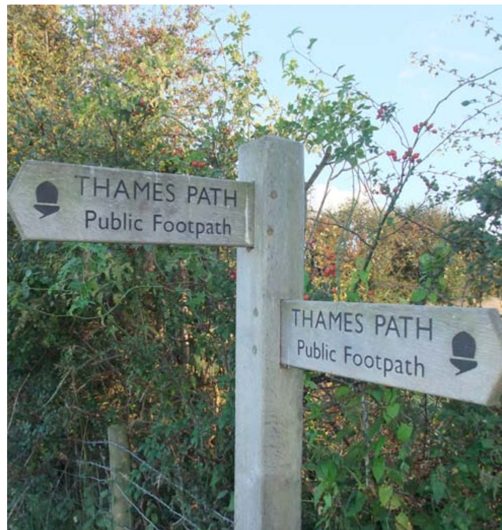
Thames Path National Trail.

Please note: Common Land refers to land included in the 1965 commons register; CROW = Countryside and Rights of Way Act 2000; OC and RCL = Open Country and Registered Common Land.