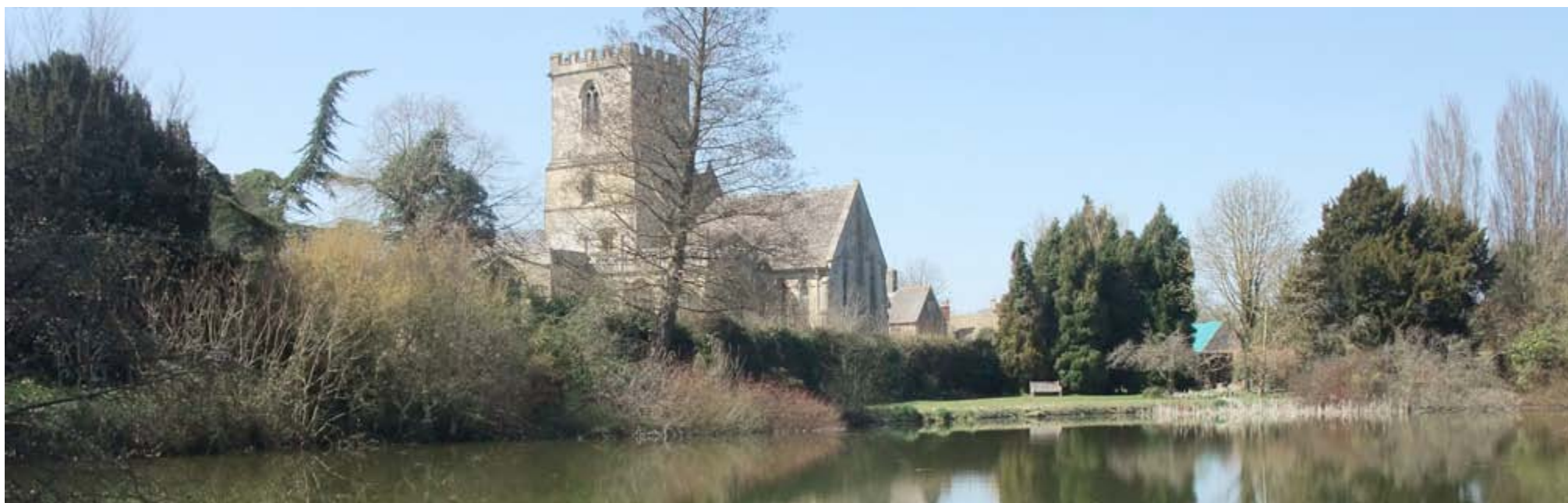
Stanton Harcourt church.

Biodiversity and geodiversity are crucial in supporting the full range of ecosystem services provided by this landscape. Wildlife and geologically-rich landscapes are also of cultural value and are included in this section of the analysis. This analysis shows the projected impact of Statements of Environmental Opportunity on the value of nominated ecosystem services within this landscape.