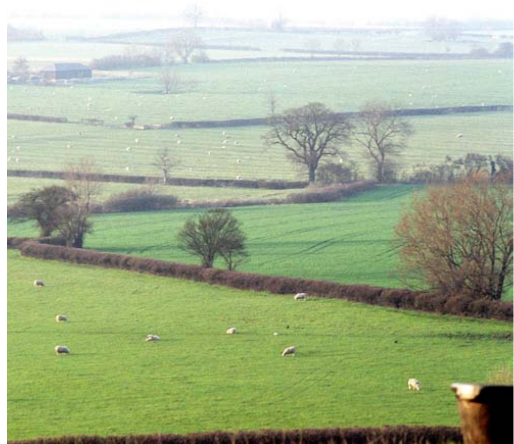
The regular field pattern dates back to Parliamentary enclosure. There are nationally important areas of ridge and furrow and frequent hedgerow trees in Buckinghamshire, as shown here.