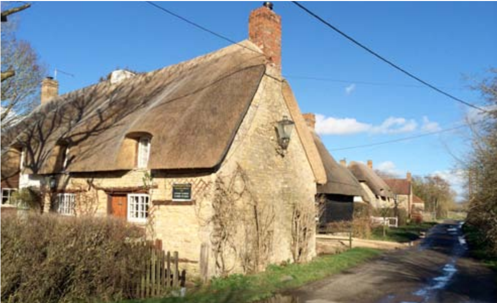
Traditional building materials include brick, tile, timber and thatch. In addition, limestone is found near the Cotswolds and occasional clunch and wichert near the Chilterns.