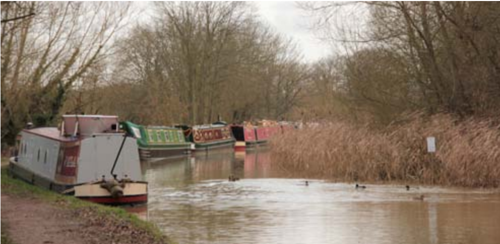
Oxford Canal at Thrupp.

agreements. This suggests that the quality of this feature, as part of the landscape character, is being maintained.