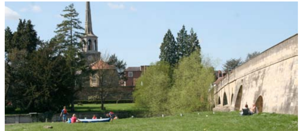
Historic settlements are located at river crossings, such as at Wallingford on the Thames. People today enjoy riverside green spaces and the Thames Path National Trail.

Source: Upper Thames Countryside Character Area description; Countryside Quality Counts (2003), Draft Historic Profile