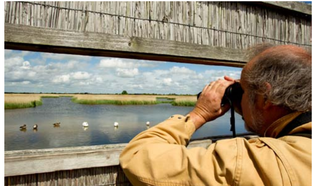
Rivers, water-filled gravel pits and wetlands provide a range of ecosystem services. Water attracts wildlife and people and in this NCA where there is high flood risk, wetlands usefully hold water and intercept flow.