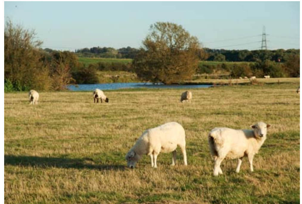
Sheep grazing by the Thames near Farmoor Reservoir.