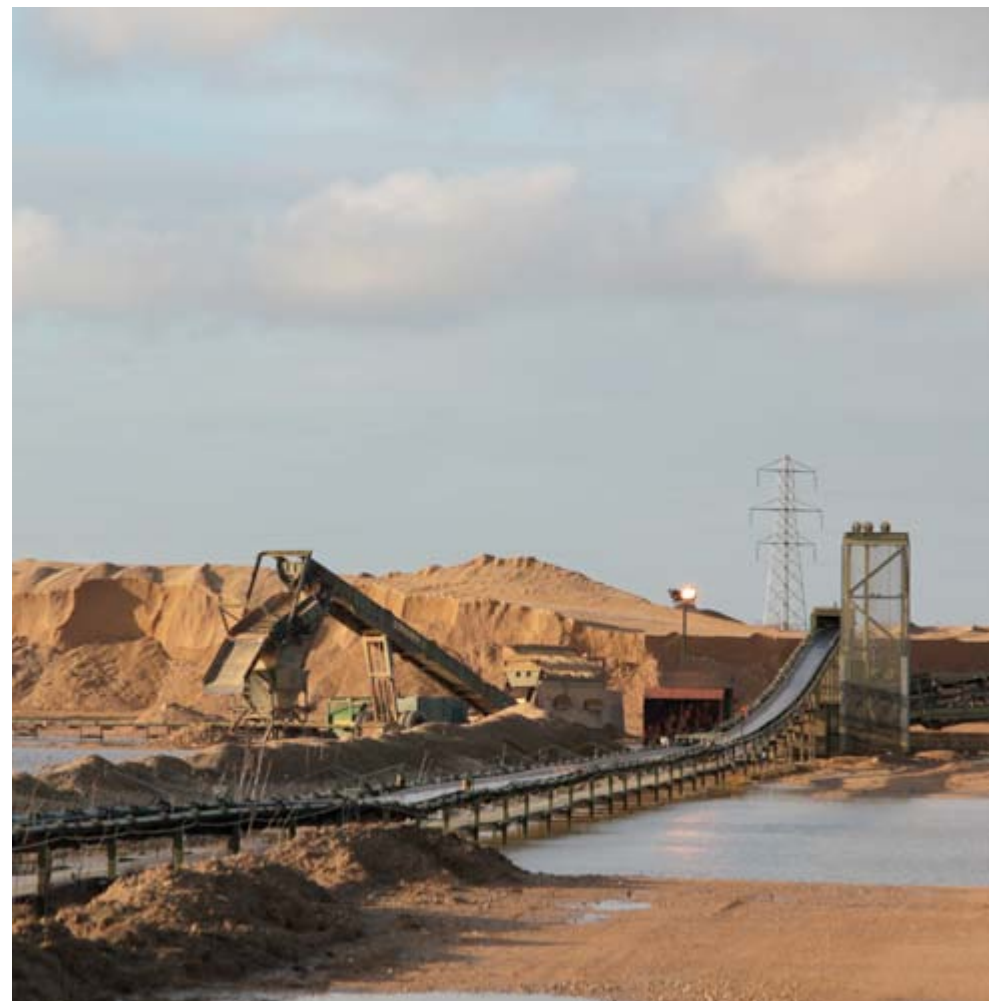
Mineral extraction and water-filled pits are concentrated in the Cotswold Water Park and Lower Windrush Valley. Restoration schemes will shape the landscape in the longer term.