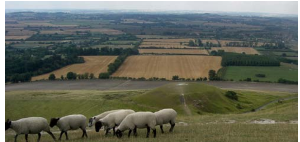
People enjoy the views of the Vales from the high ground of adjacent NCAs, including the escarpment of the North Wessex Downs Area of Outstanding Natural Beauty.