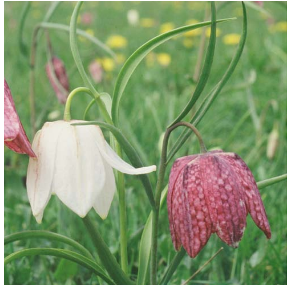
Snake's head fritillary grows in the historic meadows of North Meadow and Clattinger Farm SAC. Other characteristic species include brown hare, native black poplar and brown hairstreak butterfly.

Although the NCA retains many tranquil spaces, the overwhelming impression is of an area criss-crossed by transport routes including motorways, major roads, canals and railway lines, dominated by Didcot Power Station and industrial activities around Abingdon in the south and Oxford Airport in the north, with the large towns of Swindon and Aylesbury to the west and east. Activity from military airbases such as Fairford and Brize Norton outside the NCA also impacts on the tranquillity of the area.