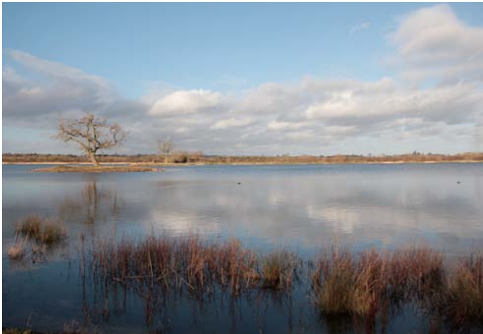
Nature after minerals - Rushy Common Nature Reserve on former sand and gravel workings in the lower Windrush Valley.

Based on the CPRE map of tranquillity (2006) the NCA is undisturbed away from the main towns (Abingdon, Aylesbury, Didcot, Swindon) and transport links (Oxford airport, the M4 and M40). The greatest areas of tranquillity are to the far west (around and to the south of the Cotswold Water Park) and east (Aylesbury Vale) of the NCA.