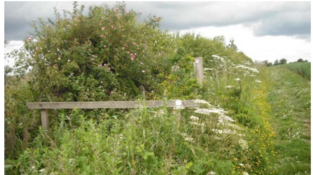
Hedgerows and margins across farmland provide habitat for wildlife and intercept surface water run-off. Hedges and hedgerow trees also contribute to sense of place.