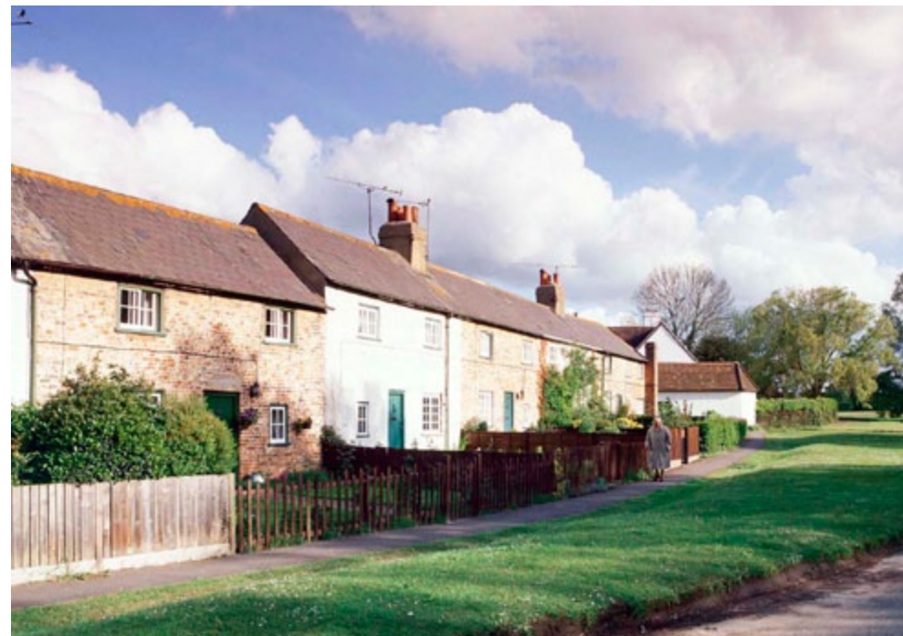
A 19th century terrace of brick and slate cottages facing the common at Downside Common, near Cobham.

To the north-east towards London, the farmland character becomes heavily fragmented by increasing suburbia and the major transport links that cross the NCA such as the M25, A3 and A24. This densely populated part of the NCA includes the Greater London suburbs of Croydon, Mitcham, New Malden and