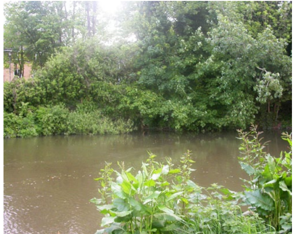
River Wey Navigation Canal.