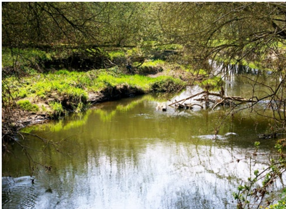
River Mole at Leatherhead.

have been replaced by wire fencing or are neglected, gappy and in poor condition. Horse paddocks are a common feature. Field trees in straight lines frequently indicate the position of a lost hedgerow.