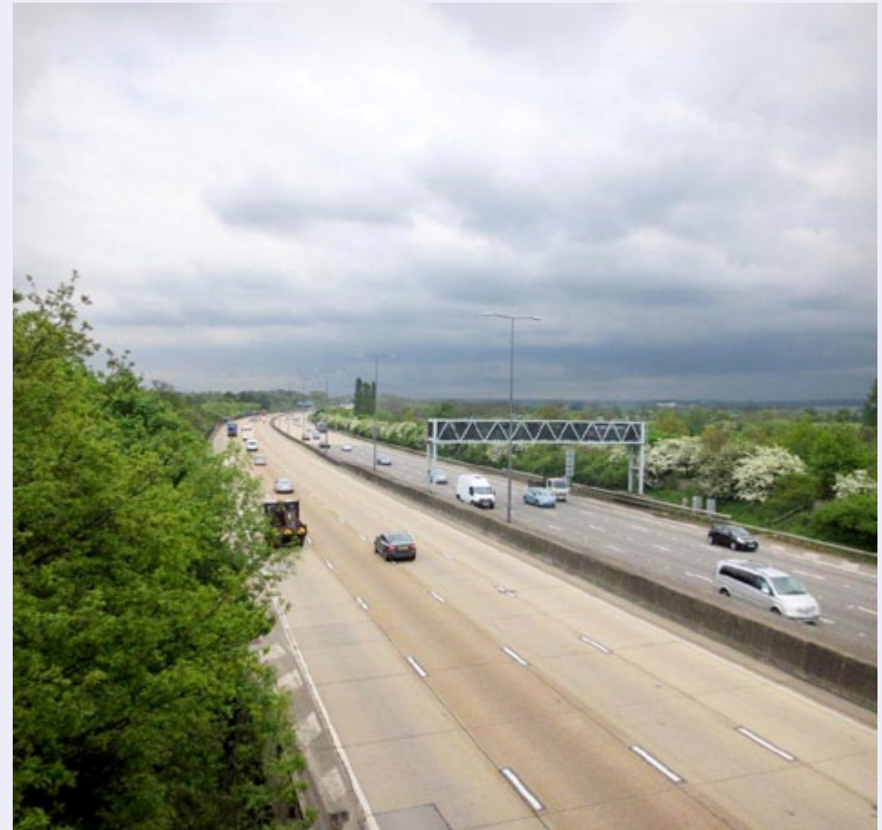
Major transport links, such as the M25, fragment some habitats within the NCA.