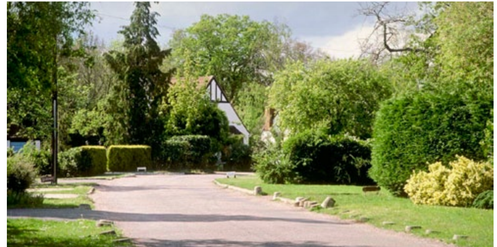
A suburban road at Effingham Junction on the Guildford to London railway line; a landscape much influenced by commuter development south-west of London.

grazing to arable, recreation or horticulture has reduced the distinctiveness and landscape setting of parkland features.