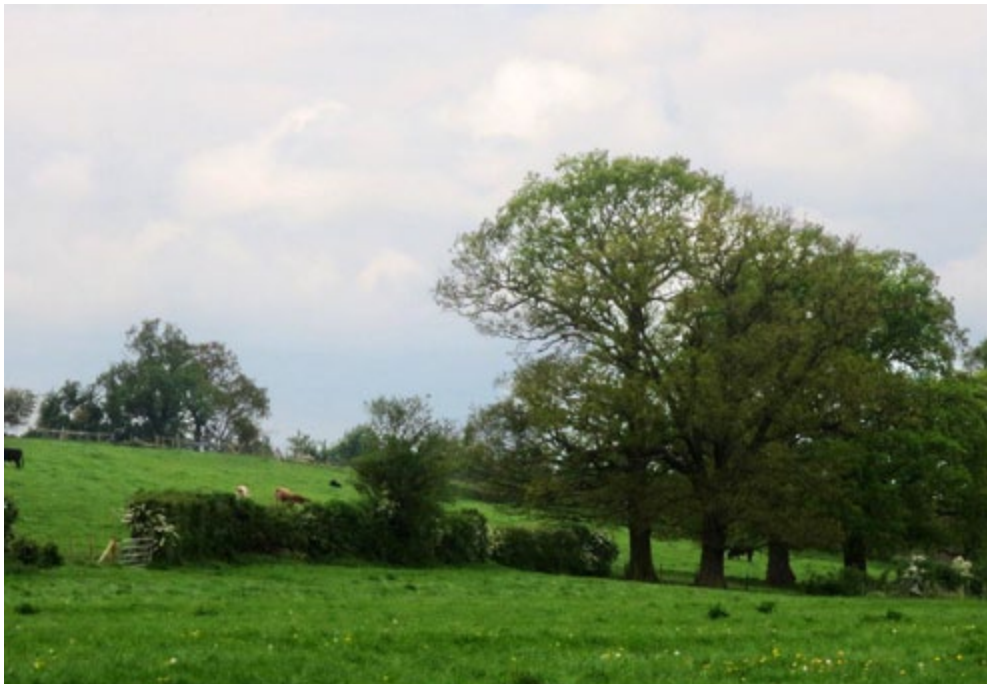
A line of field trees follows the line of a former hedgerow.

The Thames Basin Lowlands NCA provides a wide range of benefits to society. Each is derived from the attributes and processes (both natural and cultural features) within the area. These benefits are known collectively as 'ecosystem services'. The predominant services are summarised below (under the constituent headings) Further information on ecosystem services provided in the Thames Basin Lowlands NCA is contained in the 'Analysis' section of this document.