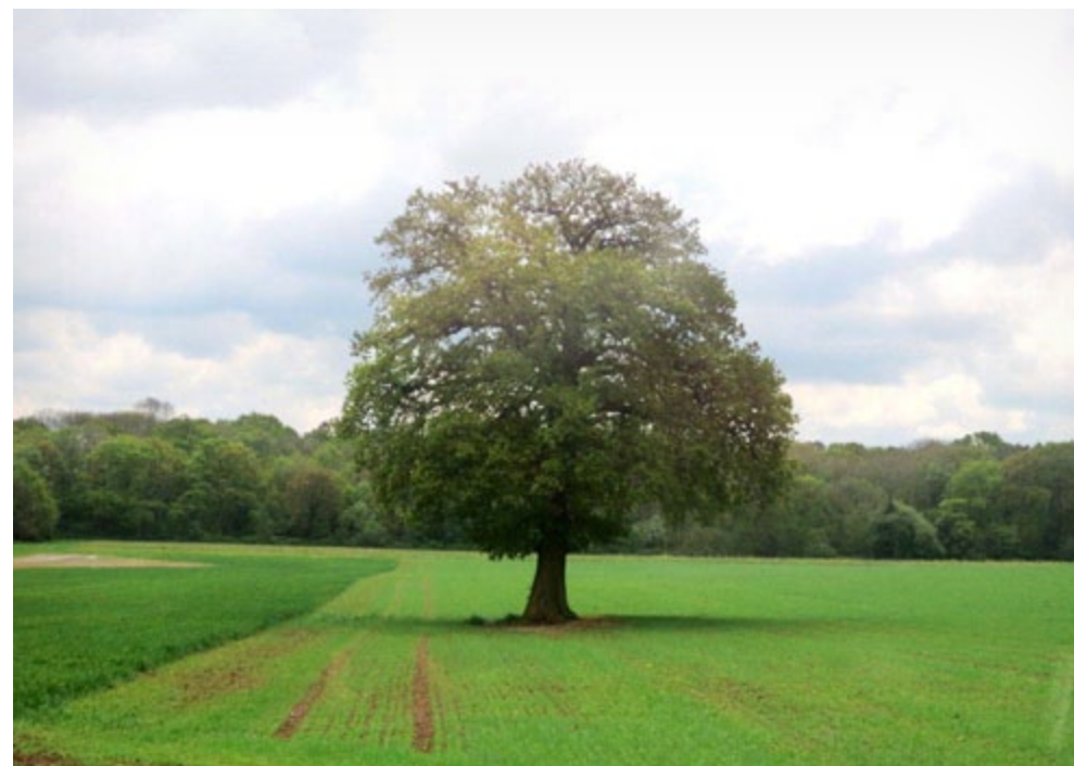
Field tree within an arable and wooded landscape.

Biodiversity and geodiversity are crucial in supporting the full range of ecosystem services provided by this landscape. Wildlife and geologically-rich landscapes are also of cultural value and are included in this section of the analysis. This analysis shows the projected impact of Statements of Environmental Opportunity on the value of nominated ecosystem services within this landscape.