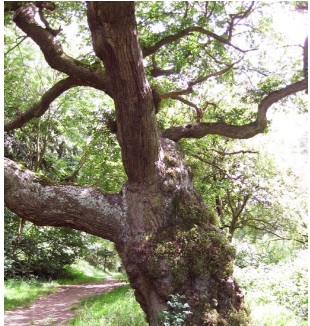
Ashtead Common National Nature Reserve is designated in part for its pollarded oaks, which are host to a rich assemblage of invertebrates.

Guildford probably had its origins in the early Saxon period, located at a crossing point on the River Wey. Its central position for passing traffic across