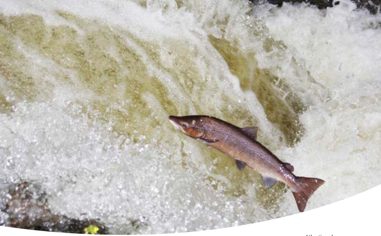
Atlantic salmon