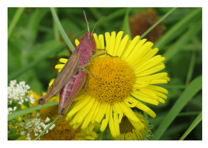
Meadow grasshopper.

The grassland, scrub and wetland areas of the reserve are part of Ailsworth Heath. This land was ploughed around 800 years ago, leaving distinct ridges and furrows which can still be seen today. In about 1350, cultivation was abandoned, and the Heath became common land, grazed by sheep, cattle and ponies belonging to commoners in the village of Ailsworth. The Heath was later celebrated in the writings of Helpston's 'peasant poet', John Clare, who was the first person to record many of the plants, birds and other wildlife found there. In 1953 the remaining areas of woodland and heath were declared as one of Britain's first National Nature Reserves to preserve this unique part of our natural heritage.