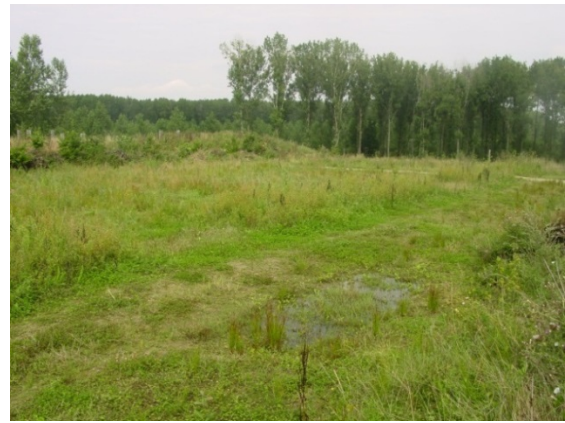
Photographs showing the Groene Woud