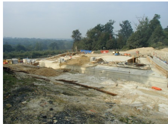
Photographs taking during the construction phase of the A21 landbridge