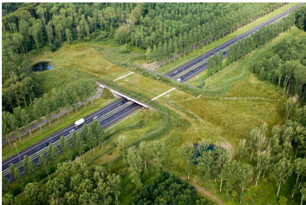
Photograph of Groene Woud