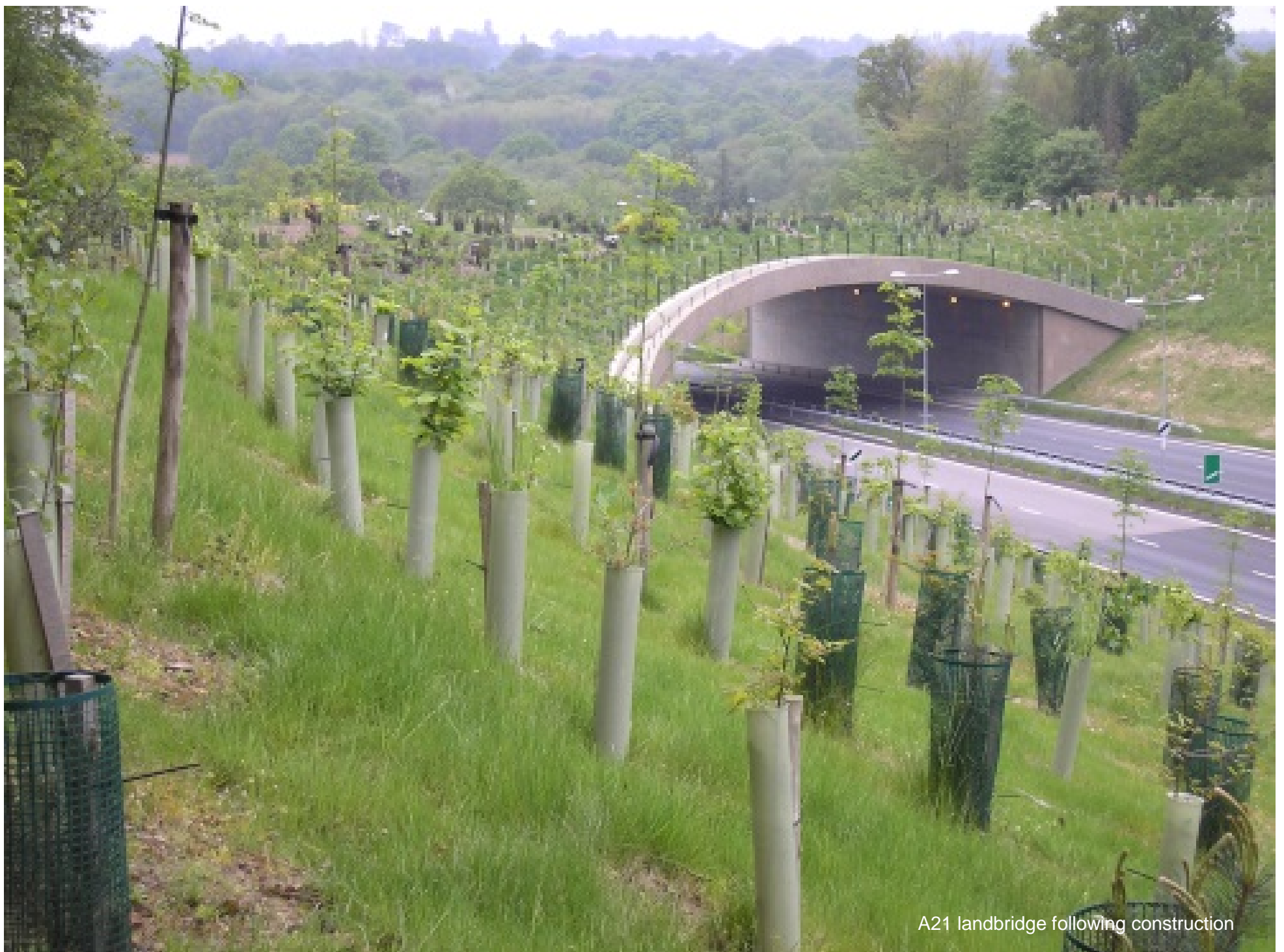
A21 landbridge following construction