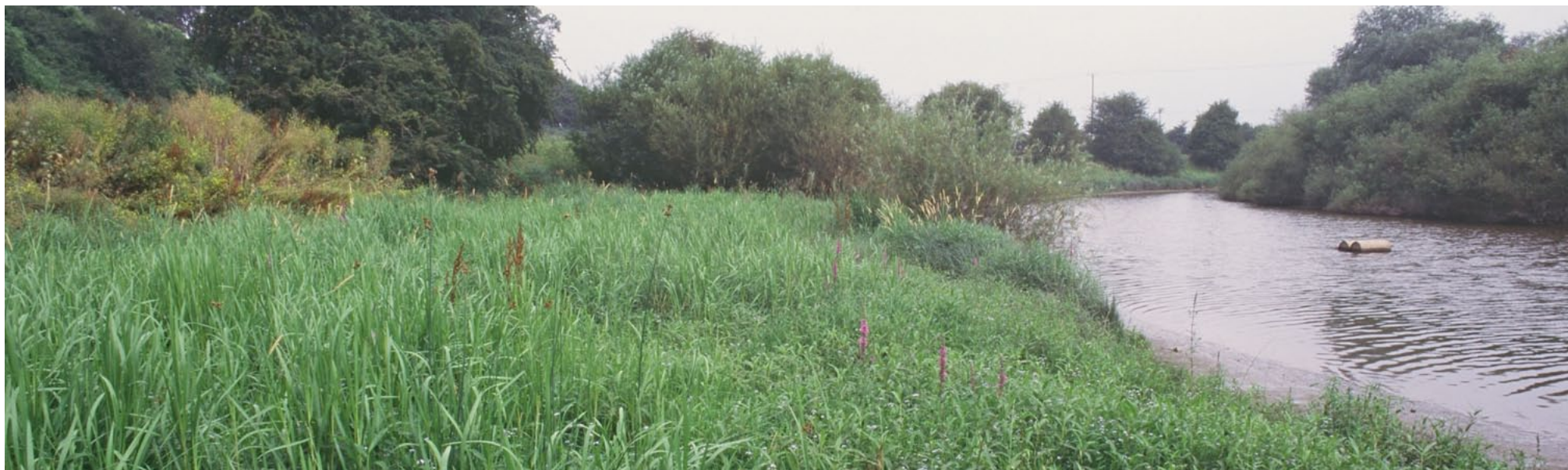
The Old River Severn, Upper Lode, SSSI is composed of an old cut-off meander of the River Severn.

Biodiversity and geodiversity are crucial in supporting the full range of ecosystem services provided by this landscape. Wildlife and geologically-rich landscapes are also of cultural value and are included in this section of the analysis. This analysis shows the projected impact of Statements of Environmental Opportunity on the value of nominated ecosystem services within this landscape.