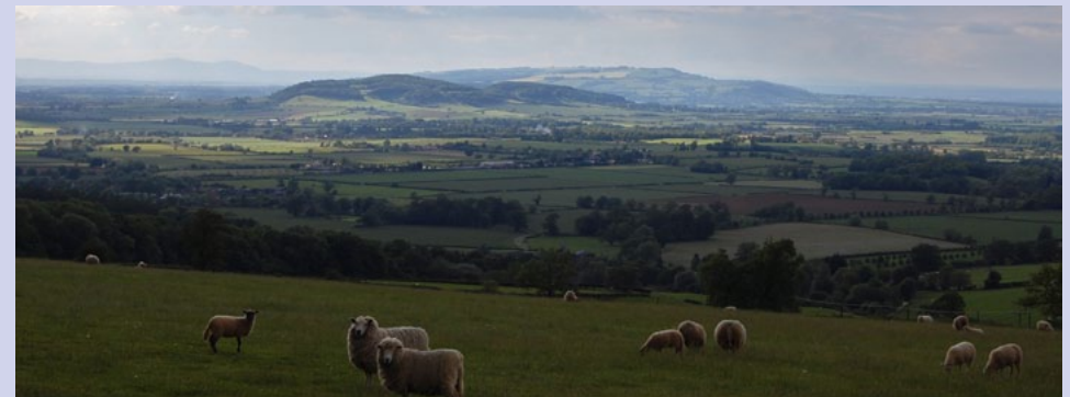
The view from Stanway Hill across the Severn Vale showing Cotswold outlier hills standing out from the surrounding flat vale; Dumbleton Hill near the centre, Bredon Hill far centre, Malverns left horizon.