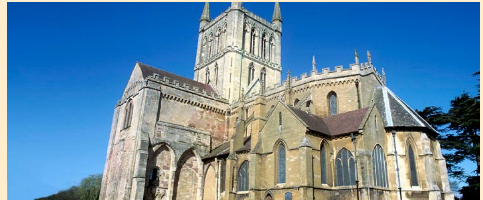
Pershore Abbey, a prominent ecclesiastical feature standing out in the flat vale landscape.