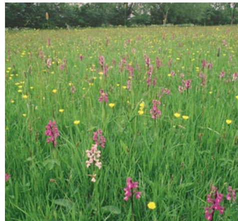
Green winged orchids at Foster's Green Meadows SSSI, an example of species-rich lowland meadow.

rise to inland salt marsh. Narrow riverside levels in the south widen out to the north of Gloucester. The northern section of the area divides into two distinct landscapes characterised by their historic patterns of settlement and field boundaries. In the west, on poor, wet soils of the Mercia Mudstones, there is an ancient landscape of dispersed settlements with numerous open commons (survivors of the historic droving trade which crossed the area) and small pasture fields. To the east, fertile soils on Lias clays give rise to rich agricultural land, particularly around the Vale of Evesham where market gardening predominates. Here settlements are more nucleated, often around a church that stand prominently in this low lying landscape, and fields are medium to large sized, with many following the narrow rectangular fields derived from parliamentary enclosure of medieval strip farming. Many villages are characterised by red brick, stone and black and white timber framed buildings.