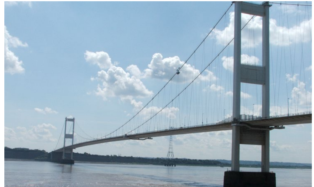
The old Severn crossing looking across to Aust, a prominent feature of the Severn Vale, now a grade 1 listed building.