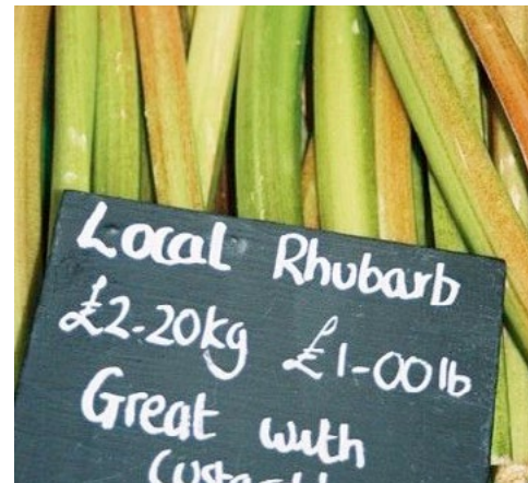
Local rhubarb displayed at Tewkesbury Food and Drink Festival.

The Severn and Avon Vales are underlain by soft rocks, mostly consisting of the Mercia mudstone group and Liassic clays, which form heavy loam or clay soils. River terrace deposits of sands and gravels are found in the Severn Vale, some of which are worked commercially. An unusual feature is the localised salt deposit around Droitwich, which has been worked since Roman times and gives