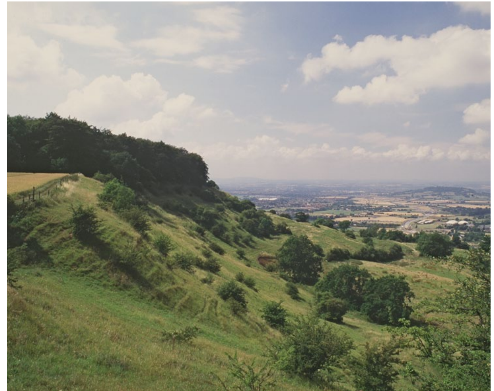
The Severn Vale from Crickley Hill and Barrow Wake Site of Special Scientific Interest.