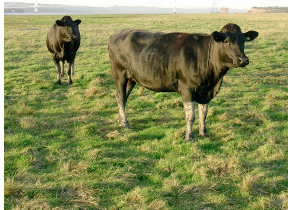
Cattle grazed saltmarsh Northwick Warth, Severn Estuary, Avon.