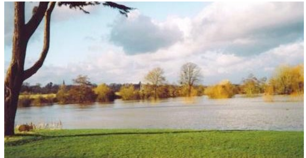
Flooding from the Severn in Cheluvelt Park, Worcester.

The River Severn divides two sharply contrasting areas of historic significance that strongly influence the present character of the NCA. To the west, there is a predominant pattern of highly dispersed settlements, which was well established by the 11th century. The present pattern of small-medium scale fields and an intermingling of assorted fields and open commons, derives from medieval piecemeal enclosures of the once much more extensive heaths that developed through the grazing in common, of the poorer soils.