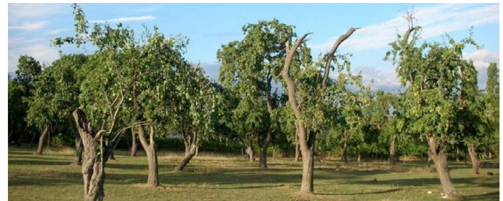
A traditional Worcestershire plum orchard showing standing dead wood, an important resource for orchard biodiversity.

Broadcloth production (a major feature of Stroud valleys in the Cotswolds NCA) developed in the south of the area from the late 14th century. Stocking knitting developed at Tewkesbury, which also became a major corn milling centre from the medieval period. The building of the canal network during the 18th and 19th centuries, to transfer and export the goods produced in the area, simulated the growth of the Worcester porcelain pottery. The one time important dairy industry around Gloucester gave us double and single Gloucester cheeses. The Severn has long been a major salmon fishery and historically, sturgeon and lamprey were supplied to the Crown.