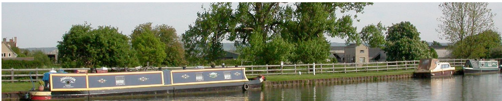
Native black poplar by the sharpness Canal at Frampton, Gloucestershire; characteristic bowed down branches make them a striking landscape feature.