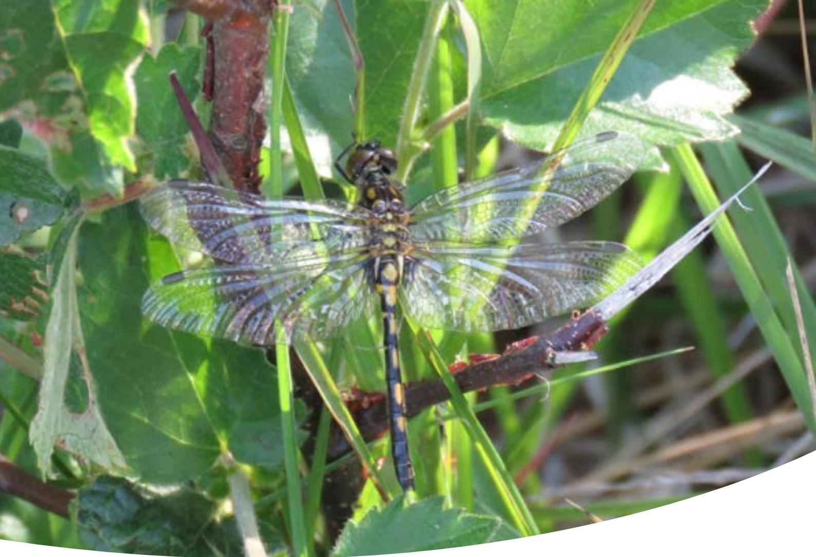
White faced darter © Barry Henwood