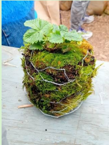
A planter made by a charity worker who makes social prescribing referrals at Forest Farm Peace Garden. She planned to show it to her clients as an example of what they could do.

At the special Happier Outdoors day at St John's Waterloo (which consisted of a gardening session in the morning, a film screening in the afternoon and a bat walk at night), one attendee told the co-ordinator she wanted to express her gratitude. She was a recent arrival to the UK, and the event took place on her birthday. Thanks to Happier Outdoors, she had spent her day with new friends, signed up for regular gardening and got to see bats.