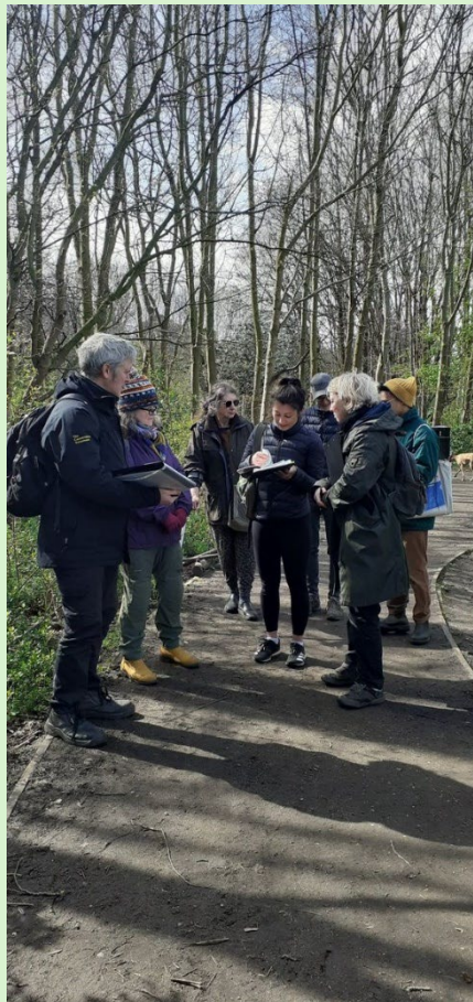
A woodland assessment survey run by Friends of Burgess Park as part of the Happier Outdoors Festival.

events (16), where word spread quickly through their networks. Appendix H1 includes a full breakdown of in-person events by borough.