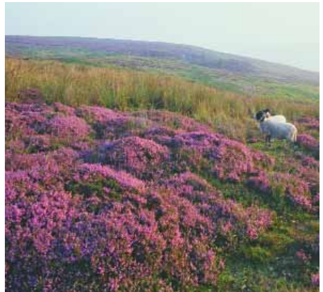
North York Moors National Park, heather on Blakey Ridge.

Historically the size of herds or flocks grazing upland areas was limited by the available forage vegetation and the manpower to shepherd animals around the hills. Over the winter all cattle and most sheep were brought