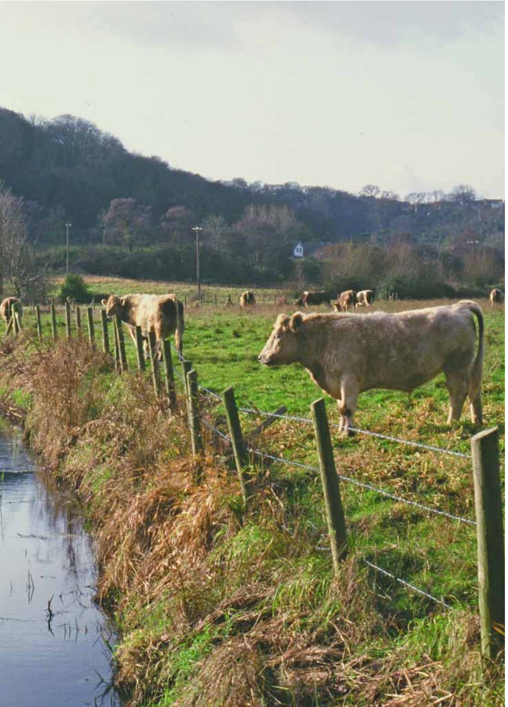
Cattle grazing species-rich grassland.