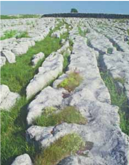
Catons Wildlife Enhancement Scheme enclosure 3rd year.

contains a mixture of grasses and herbs such as sheep's-fescue, common bent and wild thyme. Many lime-loving plants such as common rock-rose, bird's-eye primrose and bloody crane's-bill can also be found in these species-rich pastures. Upland calcareous grasslands are of particular importance for a number of nationally-rare butterfly species, including the northern brown argus and the small blue.