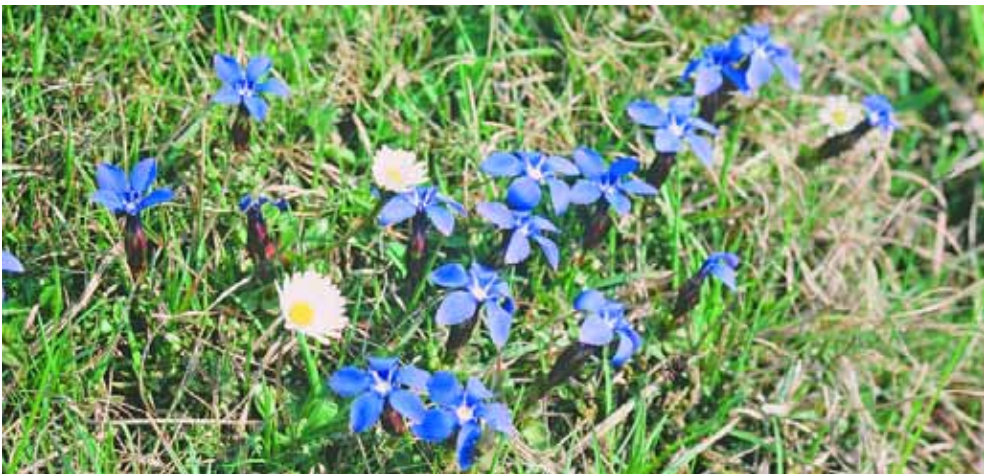
Spring gentian, Langden Beck.