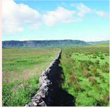
Impact of grazing management.

Over-grazing remains an issue of key concern in the uplands, affecting 190 Sites of Special Scientific Interest covering 130,000 hectares of land. Changes to the Common Agricultural Policy will remove the artificial incentive for farmers to overstock. This is a positive step forward but in itself is unlikely to result in the sort of management that upland habitats require.