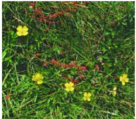
Typical acid grassland plants.

Over-grazing is by far the greatest cause of damage to this habitat but it is also affected by inappropriate moor-burning and stock-feeding.