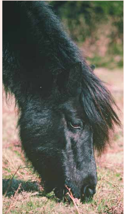
Dartmoor pony grazing near Rippon Tor, Dartmoor.

Horses and ponies have teeth which point slightly forward and can graze as close to the ground as rabbits. Horses and ponies are selective grazers and will leave some areas of pasture untouched resulting in taller patches of vegetation. These 'latrine' areas can benefit insects and small mammals but can also result in undesirable areas of rank grass if they are not managed correctly. Hardy breeds can forage on species such as rush, bracken and reeds and can also help to control scrub encroachment by browsing saplings and other woody material.