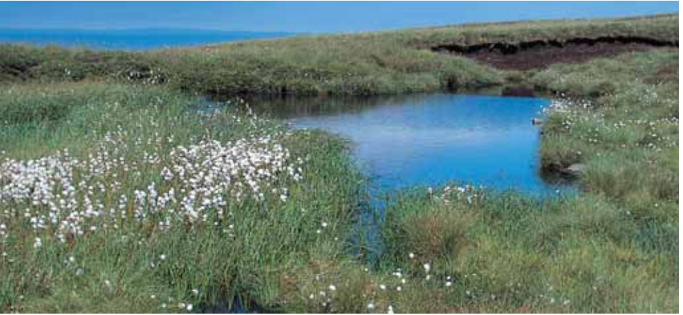
Blanket bog.

Upland blanket bog is a globally rare habitat and includes species of heather, cross-leaved heath, deergrass, cottongrasses and bog-moss species. Its associated pools can support a number of rare and scarce invertebrates, such as northern dart moth and great yellow bumblebee. Many of these bogs are of European importance for birds such as merlin and a number of waders, including golden plover, curlew and dunlin.