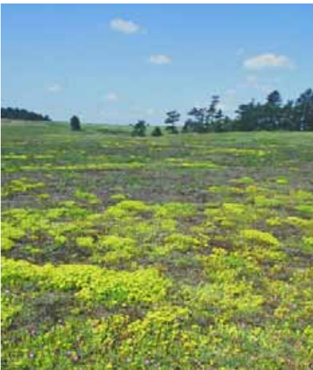
Wildlife Enhancement Scheme on lowland acid grassland.

Lowland acid grassland is characterised by plant species such as heath bedstraw, sheep's-fescue and wavy hair-grass. Dwarf shrubs such as heather and bilberry can also occur in small quantities. Lowland acid grasslands can be rich in lichens, mosses and a variety of fungi. They are also important for breeding bird species such as woodlark, stone-curlew and nightjar and support a number of invertebrates that only occur in acid grasslands, such as solitary bees and wasps and the rare field cricket.