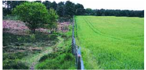
Loss of heathland to arable production.

However, there is a number of factors that influence the sort of grazing systems that are, or are not, put in place by land managers. These include market forces, the profitability of different sorts of farming activities and EU and UK agricultural policies. These have resulted in significant changes to farmland habitats over recent decades and will continue to play a crucial role in their future management.