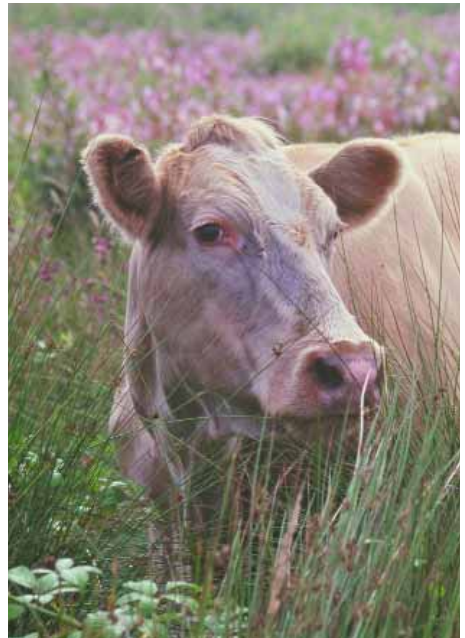
Cattle grazing.

has been suffering from very low profitability for many years and these types of enterprise were often only economically viable because of the high level of subsidies they attracted.