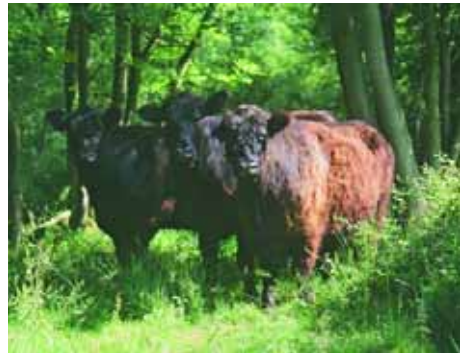
Galloway cattle grazing.

Many of our lowland habitats were once integral to mixed arable and extensive livestock farming systems. Grasslands, wetlands and heathlands were traditionally grazed, at relatively low intensities, by hardy breeds of sheep, cattle and ponies. However, the specialisation and intensification of agriculture over the last 50 years has resulted in a decline in these mixed, low intensity systems.