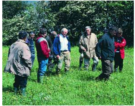
Farming for wildlife. Farmers sharing their expertise.

Free from the GAP office address in the contact details.