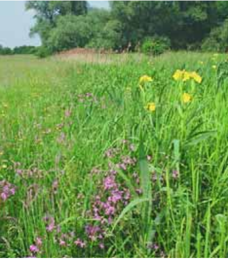
Ellerton Ings, ragged-Robin and yellow iris.

Fen, marsh and swamp covers a diverse group of wetlands, including basin fens, which are restricted to hollows; seepage fens and springs, restricted to the area around the groundwater that feeds them; and reedbeds. Fens are very rich in wildlife, and contain up to 550 different higher plants, a third of our native species. Fen habitats support more than half the UK's species of dragonfly and are home to the swallowtail butterfly. A range of aquatic beetles, and several thousand other insects and spiders are found in these habitats, which are also an important breeding ground for birds such as bitterns.