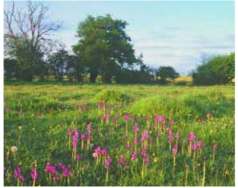
Green-winged orchid.

Under-grazing is already a real issue in many lowland areas and it is likely that this problem will increase over coming years. This will have dire consequences for those habitats which require livestock grazing to sustain the delicate balance of plant, insect, bird and other animal species which make them unique.