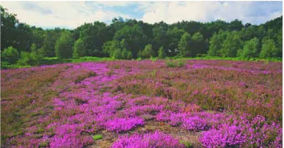
Heather cut sward on lowland heath.

Birds, reptiles and heathland plant species require a mosaic of both open and dense vegetation. Well-managed heathland contains areas of grassland and gorse, scattered trees and scrub and also bare ground. This habitat can only be maintained through active management, of which livestock grazing is an essential component.