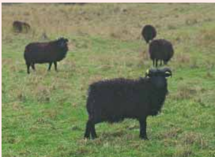
Sheep grazing on Spurn Head.

Sheep have thin mobile lips and move slowly over the sward nibbling the grass. They can graze very close to the ground which can result in tight 'lawn-like' vegetation. Sheep are very selective grazers and will target flowering plants which can have a negative impact on species diversity. Sheep can push their way through scrub and can browse saplings preventing new growth. However, they find it harder to graze longer vegetation which is often trampled instead.