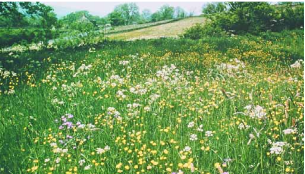
Hay meadow in Upper Teesdale SSSI. English Nature

Over-grazing can cause changes in the growth of plants, the species present and in the structure of the vegetation. Maintaining upland meadows in favourable condition depends on a continuation of hay-cutting and low-intensity grazing, coupled with occasional dressings of farmyard manure and lime.