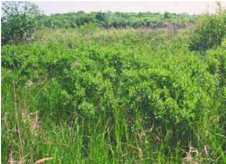
Sutton Marshes with heavy scrub.

difficult to find livestock to graze remaining wildlife sites. In many cases this has led to a rapid deterioration in their environmental condition. Without appropriate management, scrub and invasive weedy plants often take over, with consequent losses of wildflowers, butterflies, reptiles and other species characteristic of these areas. Once grazing has been lost altogether it can be very difficult and expensive to reinstate as the necessary skills, infrastructure and livestock may no longer be present.