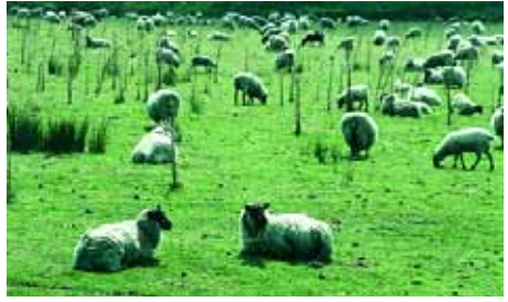
Sheep on over-grazed upland on Dartmoor.

Unfortunately, many of these advances have been at the expense of farmland wildlife. Habitats have been lost or reduced to small fragments and their capacity to support wild plants and animals has been degraded. Old grasslands that have remained 'unimproved' by artificial fertilisers, herbicides, drainage and re-seeding have become very rare with 97% being lost by the mid-1980s.