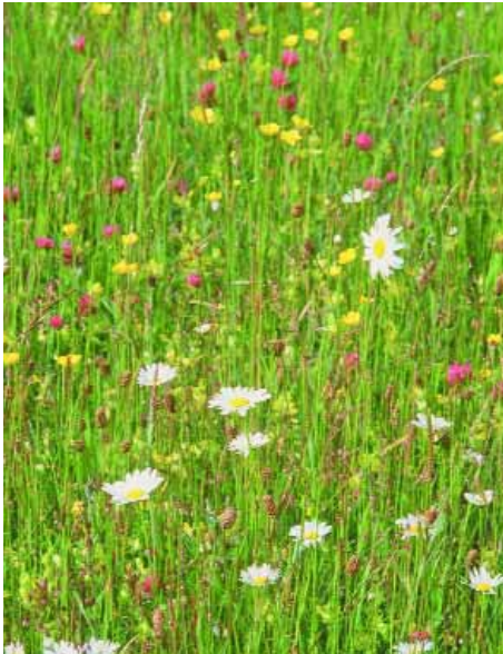
Species-rich grassland.

This led to a number of important wildlife habitats suffering from the pressure of over-grazing, particularly in the uplands.