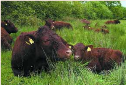
Ruby red cattle in north Devon.

Cattle use their tongues to pull tufts of vegetation into the mouth. This means that they do not graze vegetation too close to the ground and often leave tussocks of grass which are used by insects and small mammals. Because of their wide mouths cattle do not graze selectively and as a result do not target flower heads and herbage which is important for botanically-diverse habitats. Cattle are able to create their own access into rough areas and the trampling of these areas can be an important way of controlling scrub.