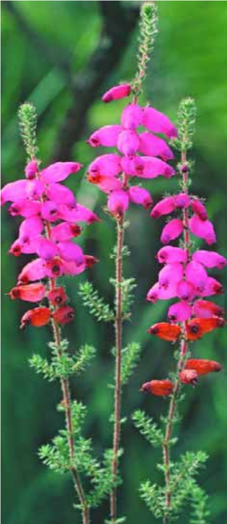
Dorset heath.

Livestock grazing plays a key rôle in maintaining species-rich habitats by controlling more aggressive species which would otherwise dominate these areas and by preventing scrub encroachment. The selection of certain plant species in preference to others by livestock is an important factor determining the structure and floristic composition of the vegetation of various habitats. Livestock grazing removes plant material more gradually than cutting or burning and gives mobile species a better chance to move to other areas within the habitat. Grazing also supports other farming activities such as hay-making which provides active management for valuable meadow habitats, allowing slower-growing grasses to flower and seed. By grazing hay meadows after they have been cut competitive coarse grasses are controlled and the trampling that occurs creates gaps in