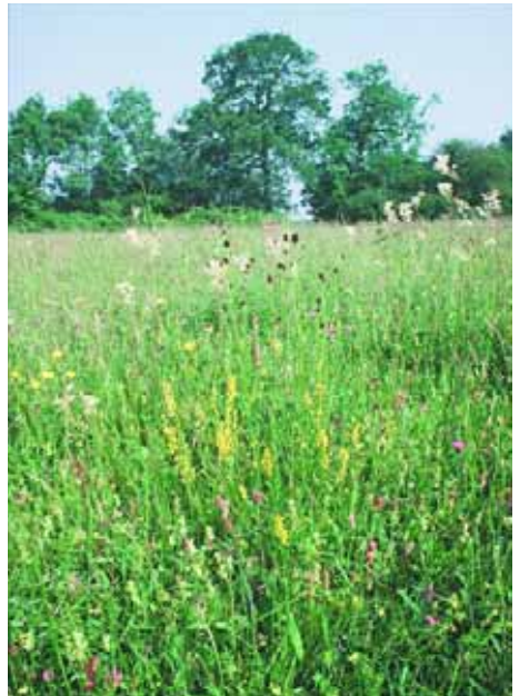
Hay meadow.

Lowland neutral grassland includes three particularly important grassland types.