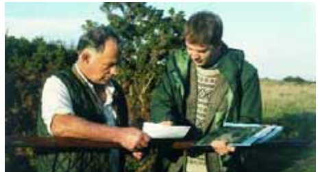
Wildlife scheme discussion.

viability of the livestock sector, in particular extensive beef production, is therefore intrinsically linked to our ability to deliver our environmental objectives. We will be working hard, with a range of other organisations and partners, to find ways to help livestock farmers make the most of the environmental credentials of their product in the market place. We will also be looking at the best way to support those livestock farmers and graziers who are managing important habitats with little economic return, to ensure that the public benefits that their activities produce are recognised and rewarded.