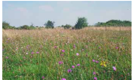
Parsonage Down Site of Special Scientific Interest.

Lowland calcareous grassland has a very rich flora, including many nationally rare and scarce species. It supports many different invertebrates including scarce butterflies like the adonis blue, the silver-spotted skipper and the wart-biter cricket. It also provides a feeding and breeding area for a number of scarce or declining birds including stone-curlews.