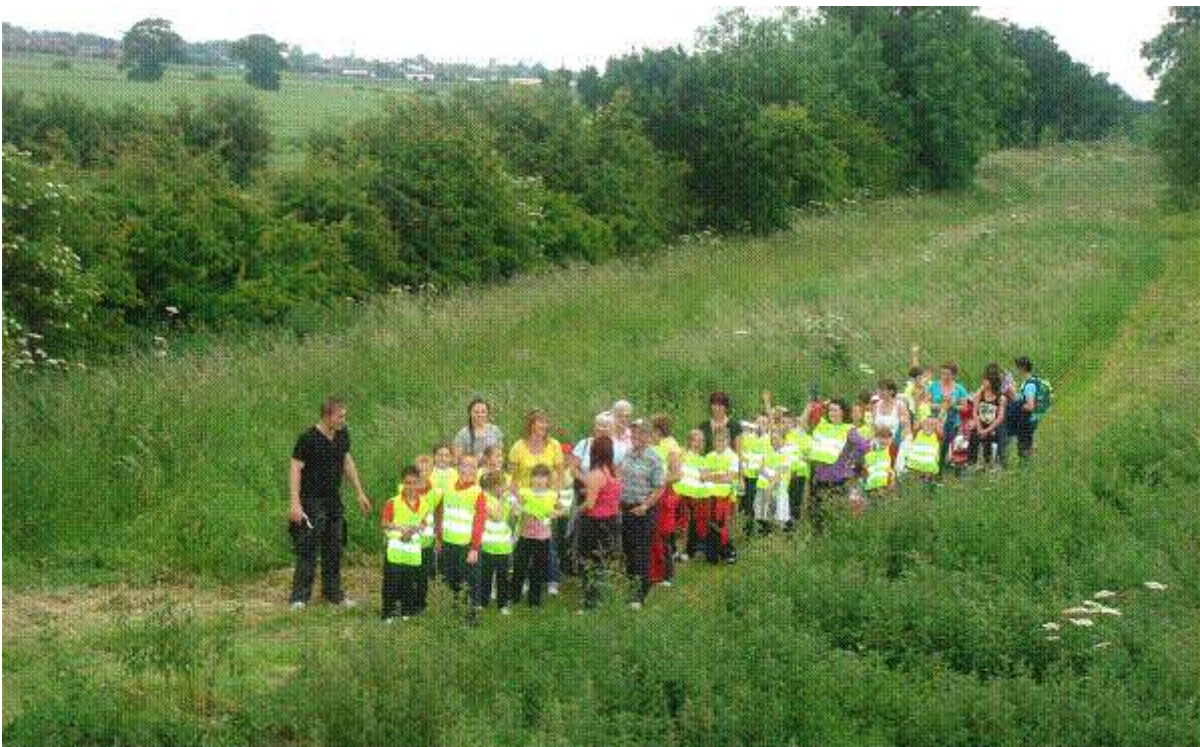
Plate 1 Walk 4 Fun School Walks – Russell Cave

1.6 This report is concerned with the findings from the programme evaluation. The findings of the project evaluations and the process evaluation are available in separate reports which can be found at: URL: www.wfh.naturalengland.org.uk/green/evaluation .