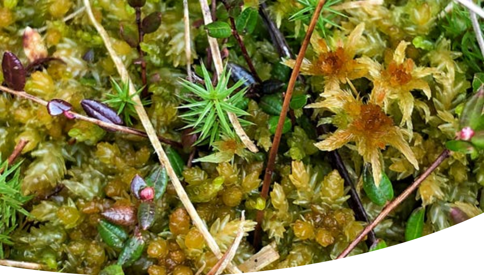
Sphagnum balticum (right) growing with Sphagnum papillosum .