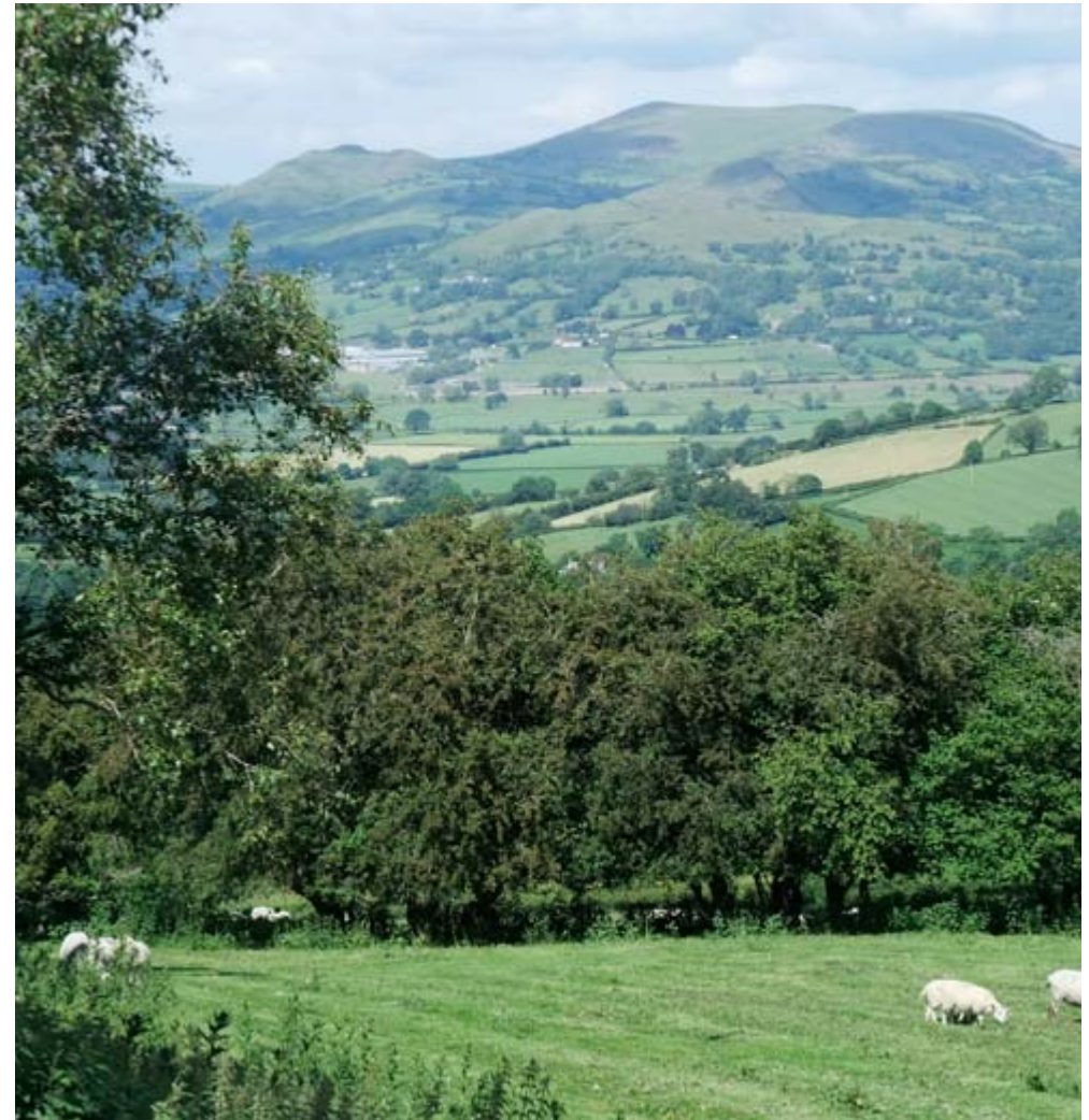
Looking north from Edenhope Hill.