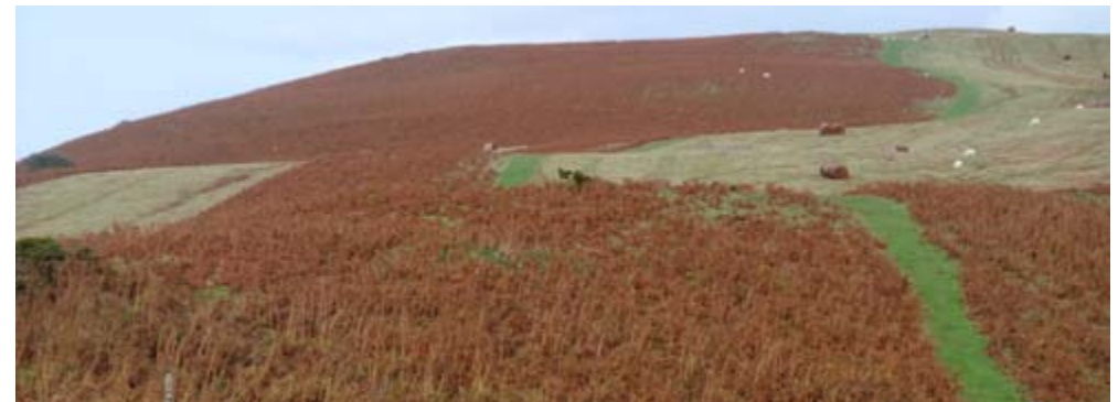
Bracken management on Hergest Ridge, here traversed by the Offa's Dyke National Trail.