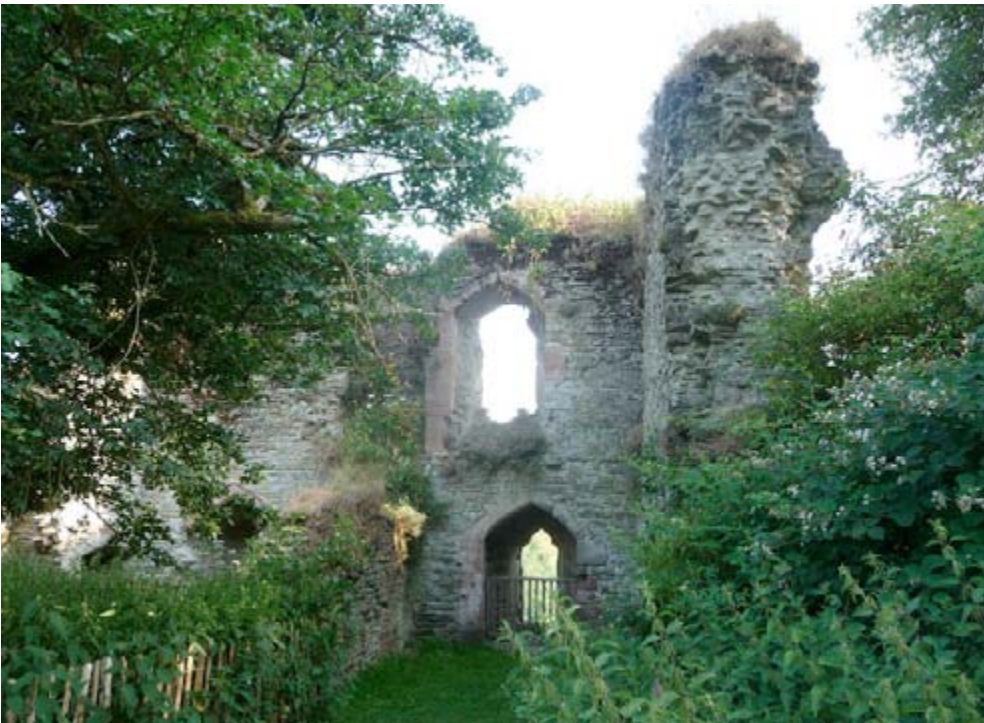
The history of the landscape is evident in its association with defence structures such as Wigmore Castle, once one of the most important castles in the Welsh Marches.

There is evidence of extensive clearance of woodland and use of eastern uplands for summer grazing by the Bronze Age, with concentration of hillforts (for example, Clun) by the Iron Age providing foci for settled communities in the valleys.