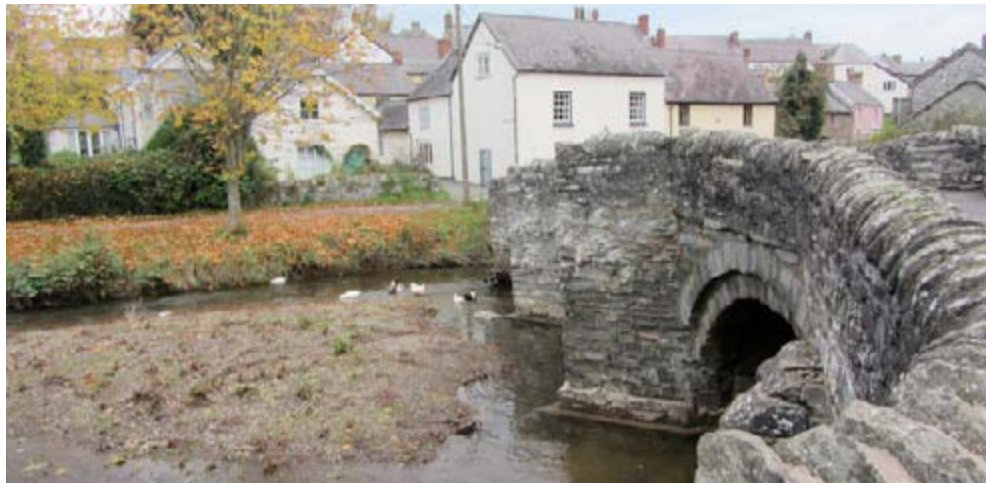
The stone packhorse bridge at Clun, built in 1450, remains an important crossing site of the River Clun.