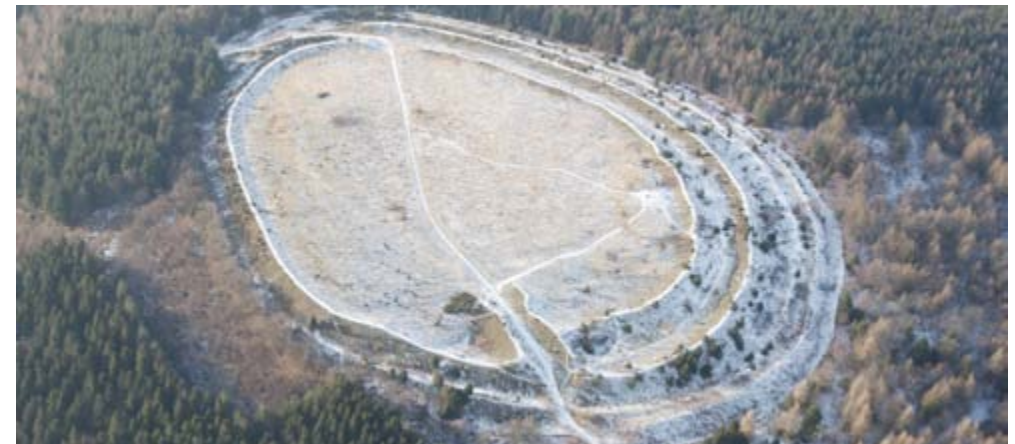
The area holds a vast number of historic environment interests including the iron-age hillfort at Bury Ditches, considered one of the finest in Britain.

The 20th century saw considerable agricultural improvement of the hills along with conifer planting. The extension of arable land and improved pasture onto higher ground changed the historic pattern of cultivation in the area, resulting in more prominent farm buildings within farmsteads. Cattle formed the mainstay of agriculture into the 20th century, stimulating the need for crops for feed. However, more recently sheep grazing has increased. Larger farms within the Wigmore basin moved into arable production by the 19th century. This trend continued, resulting in changes to the landscape and a decline in biodiversity. However, agricultural stewardship is now being successfully used as a means of addressing these issues. As a remote area, development pressures have been low, and it remains a tranquil rural locality.