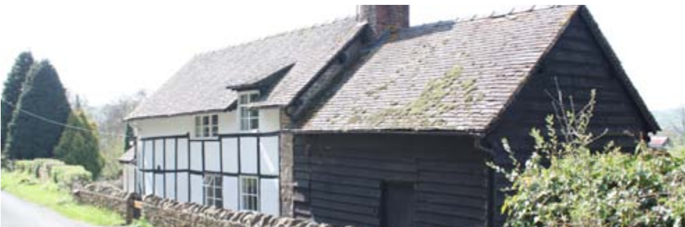
The NCA has high survival of traditional timber-frame buildings dating from the 18th century and earlier.

The area holds a large number of historic environment interests, including stone castles, the conical mounds of mottes (conspicuous on the lower edges of the river valleys), Roman forts and camps, Offa's Dyke (an outstanding monument to this period) and iron-age hill forts (of which Bury Ditches is considered one of the finest in Britain). Senses of inspiration and escapism are associated with the panoramic views across the plateau and long vistas along valleys, attracting visitors who are well served by Offa's Dyke National Trail and other walking routes. The historic intermixture of Welsh and English settlement provides cultural interest along with the area's literary associations with Sir Walter Scott and A.E. Housman's cycle of poems 'A Shropshire Lad'.