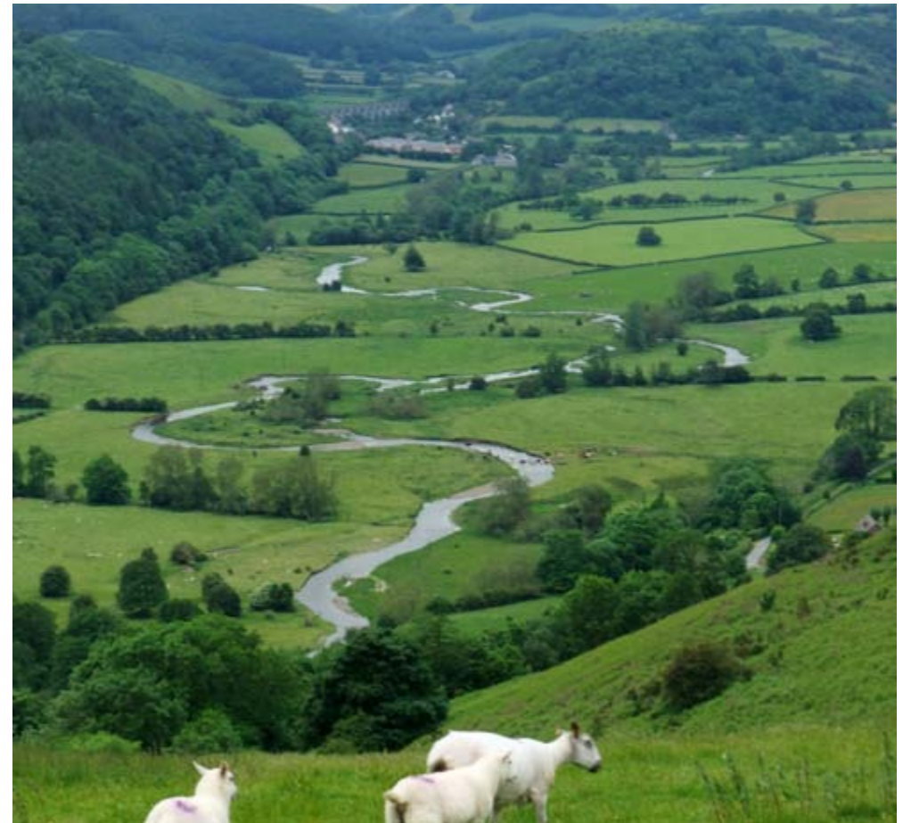
An undulating, rural area where many water courses are unimproved and noted for their high water quality and associated riparian habitat.

There has long been an important transport corridor via the A488 from Wales to the more settled landscape of the Shropshire and Staffordshire Plain NCA.