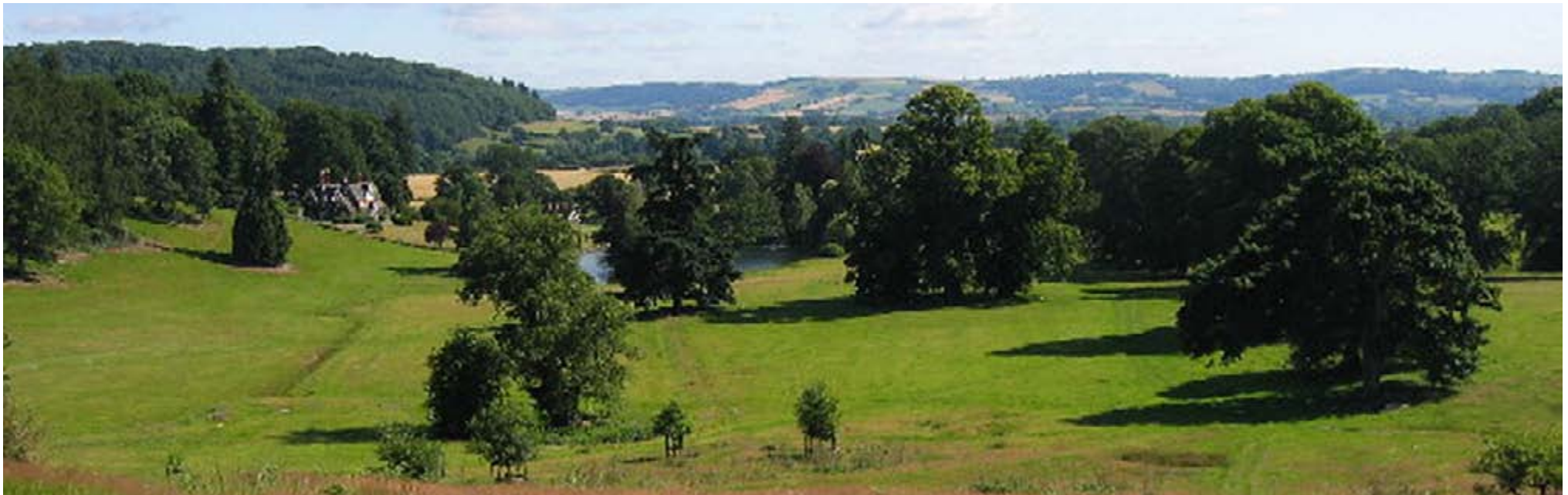
Landscape parks are found throughout the NCA, such as at Brampton Bryan and Croft Castle; here, Brampton Bryan park is captured with its scattered ancient trees in unimproved pasture, supporting nationally rare lichens and insects.

Biodiversity and geodiversity are crucial in supporting the full range of ecosystem services provided by this landscape. Wildlife and geologically-rich landscapes are also of cultural value and are included in this section of the analysis. This analysis shows the projected impact of Statements of Environmental Opportunity on the value of nominated ecosystem services within this landscape.