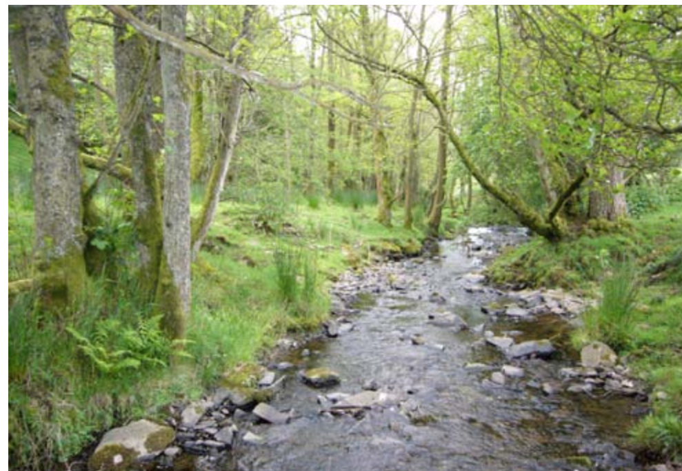
The river systems, such as the River Clun SAC, are of major conservation importance.

Maps are available from the Environment Agency showing current and projected future status of water bodies at: http://maps.environment-agency.gov.uk/wiyby/wiybyController?ep=maptopics&lang=_e