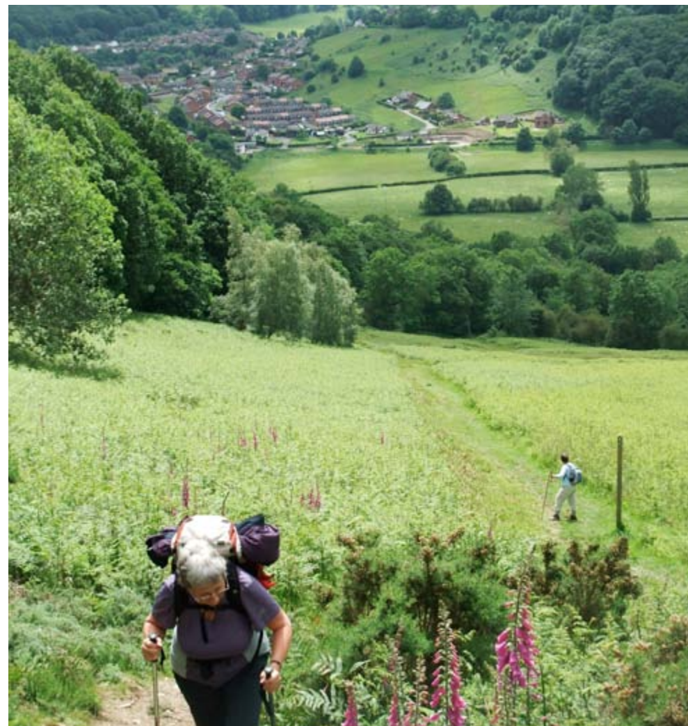
The Offa's Dyke National Trail traverses 32 km through the character area and is a popular attraction for visitors.

Please note: Common Land refers to land included in the 1965 commons register; CROW = Countryside and Rights of Way Act 2000; OC and RCL = Open Country and Registered Common Land.