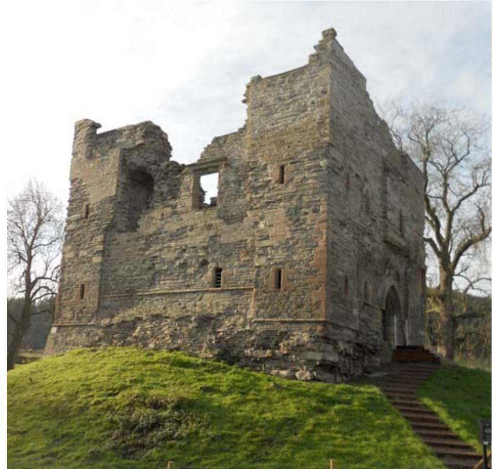
A long history as a frontier landscape - earthen motte-and-bailey castles were built in the central hills and vales to establish control over the area. Hopton Castle is a fine example.