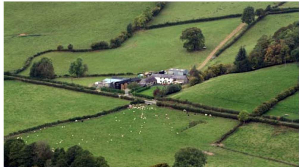
The mix of straight and irregular hedgerow boundaries suggest the land around this farmstead has been enclosed on a piecemeal basis since the Medieval period.