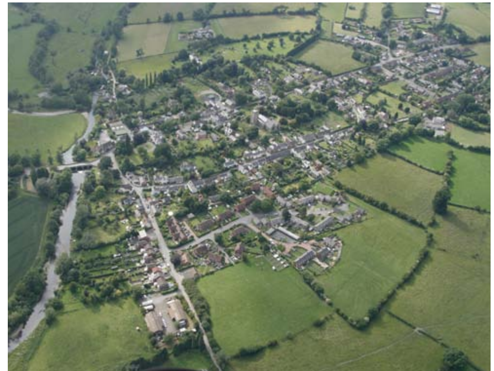
The village of Leintwardine - developed on the footprint of a Roman Fort, on the Roman road now known as Watling Street West. The Bravonium Fort underlies the present village.