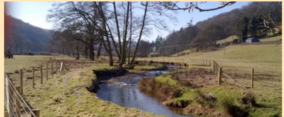
Buffer strips alongside the River Clun to reduce soil erosion and improve water quality.