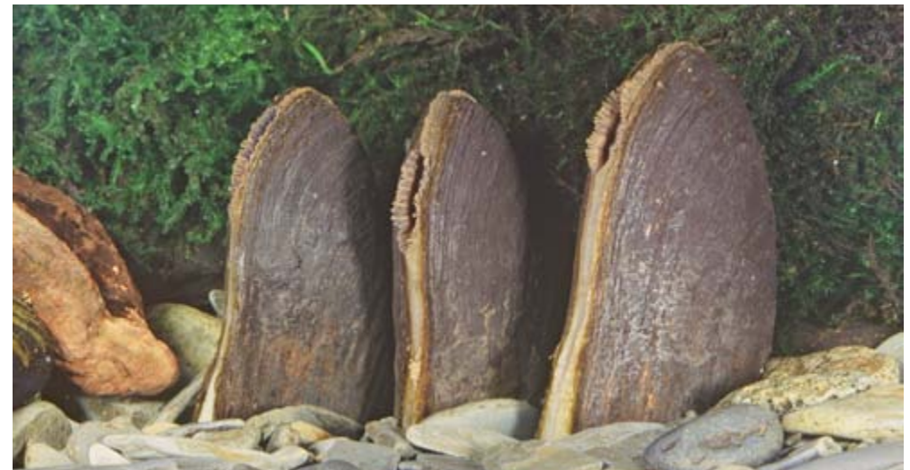
The River Clun Special Area of Conservation (SAC) forms part of the River Teme SSSI and is designated for fresh water pearl mussel.