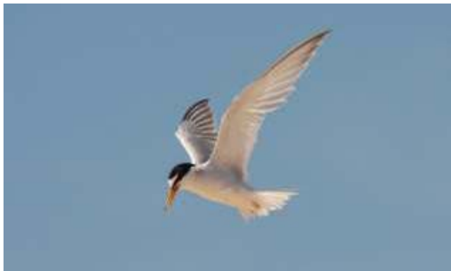
Little tern, Sternula albifrons.

A nationally important colony of little terns regularly uses areas of sand and shingle habitat in Hamford Water SPA for nesting in the late spring and summer. Waters adjacent to the nesting colony are used for foraging and these also need to be protected.