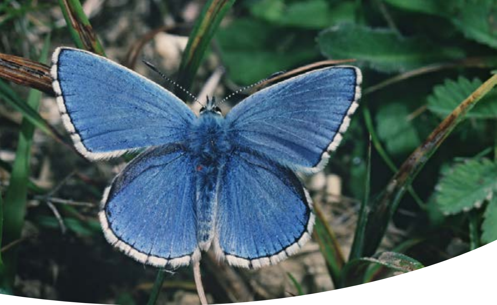
Adonis blue Polyommatus bellargus