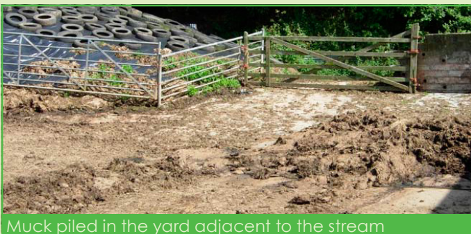
Muck piled in the yard adjacent to the stream

“It’s a shame that there is a financial limit on the grant funding available because on this farm we have only touched the tip of the