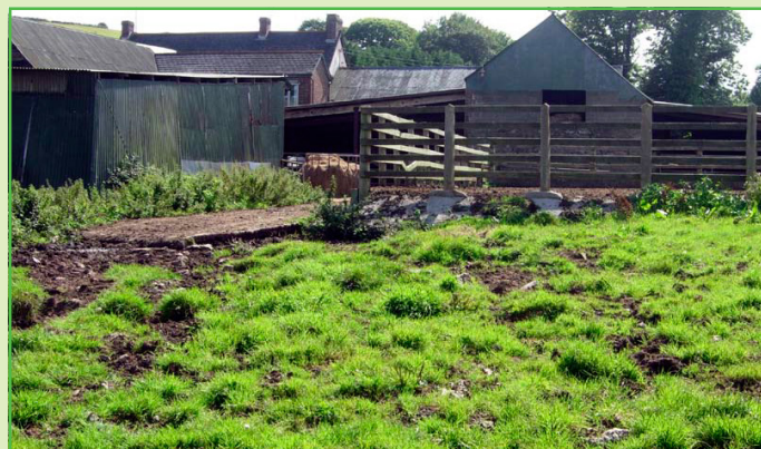
Slipway showing supplementary feeder in the yard. The nettles along the edge are the on the stream bank. Also shows the outdoor stocking area (fenced). Note the poaching all around the area.

The farmer risked regulation because of high levels of farmyard waste and soil erosion leaching into the estuary. The pollution mix collectively infringed cross compliance within the Single Farm Payment, Entry Level Scheme conditions and Good Farming Practice.