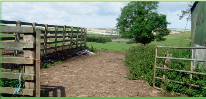
Muck and mud flowing unhindered straight into the stream which issues just behind the gate

3. Lizbe also suggested building a small breezeblock wall around the slipway and outdoor stock areas to prevent waste from this area seeping into the stream. She suggested the farm use in-field supplementary feeders, if necessary – moved regularly - rather than feeding stock in the concreted feeding area. This will prevent poaching and soil erosion and reduce the need for such frequent access to the barns.