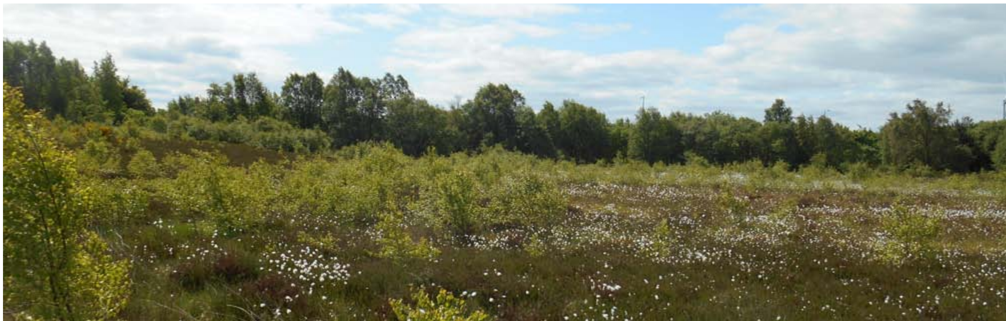
Lowland heath occurs in scattered patches, such as Greencroft and Langley Moor, where heathland is interspersed with mires and small ponds, as a result of local subsidence.

Biodiversity and geodiversity are crucial in supporting the full range of ecosystem services provided by this landscape. Wildlife and geologically-rich landscapes are also of cultural value and are included in this section of the analysis. This analysis shows the projected impact of Statements of Environmental Opportunity on the value of nominated ecosystem services within this landscape.