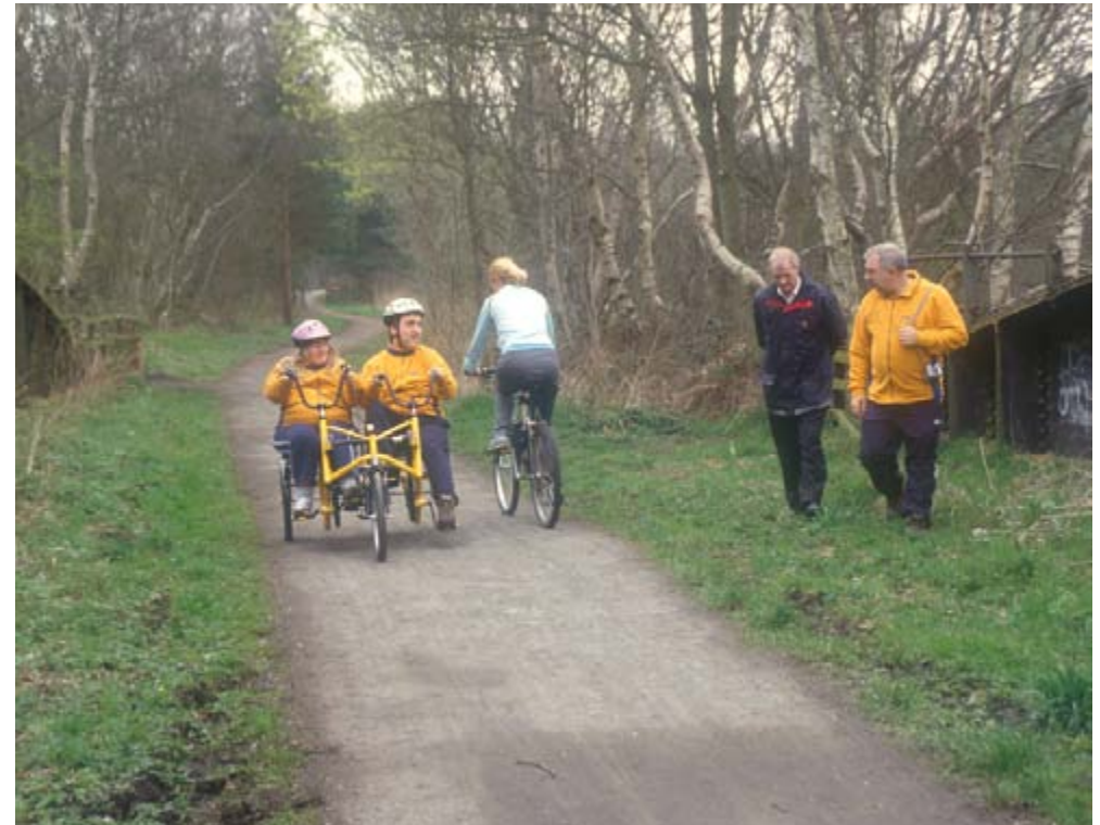
Many old wagon and railways have been converted into access routes, which provide good links between settlements and recreational opportunities for a wide range of users, such as these cyclists supported by the Gateway Wheelers charity.

as open access land (4 per cent of the NCA) and a number of key sites such as Chopwell Wood and Hamsterley Forest. The access network is particularly important in enabling links to the wider countryside from urban areas, allowing for recreation opportunities such as angling, horse riding, golfing, bird/wildlife watching and walking.