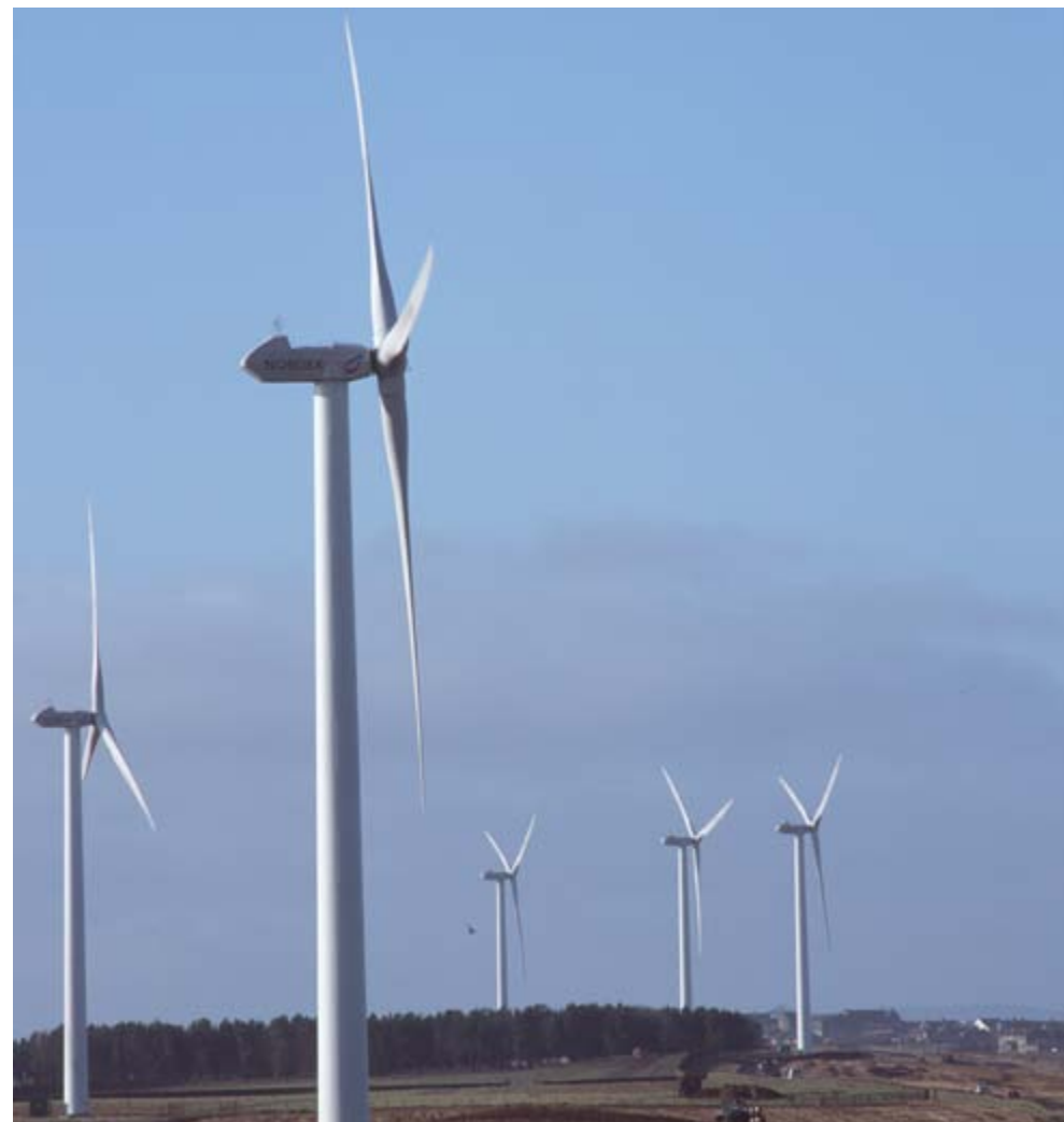
The number of wind turbines in the NCA have increased in recent years, such as these at Tow Law.

Please note that the following analysis is based upon available data and current understanding of ecosystem services. It does not represent a comprehensive local assessment. Quality and quantity of data for each service is variable locally and many of the services listed are not yet fully researched or understood. Therefore the analysis and opportunities may change upon publication of further evidence and better understanding of the inter-relationship between services at a local level.