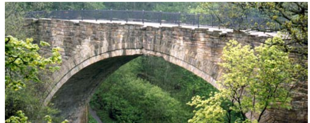
Historic structures, such as Causey Arch, serve as a reminder of the area's industrial past.