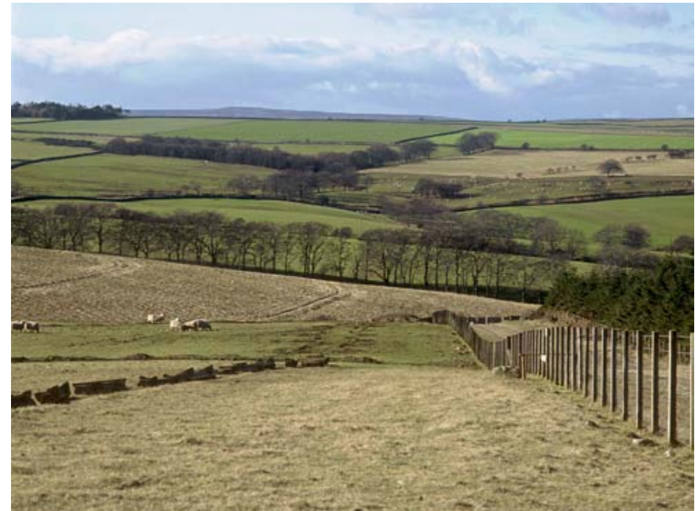
Regular rectangular fields and land reclaimed from industrial sites are typical features of the Durham Coalfield Pennine Fringe

Please note: (i) Some of the Census data is estimated by Defra so will not be accurate for every holding (ii) Data refers to Commercial Holdings only (iii) Data includes land outside of the NCA belonging to holdings whose centre point is within the NCA listed.