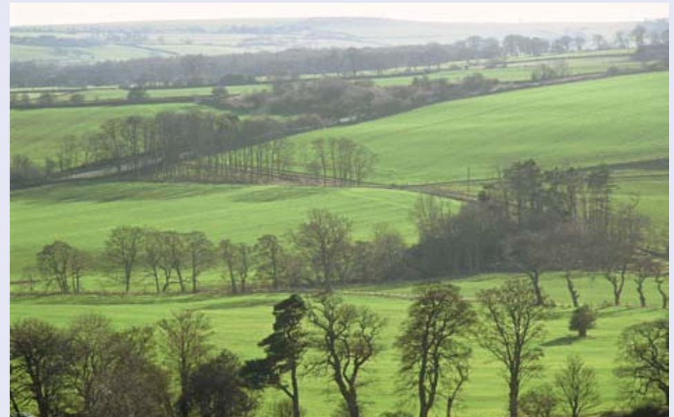
Planting trees along watercourses could help to connect isolated woodlands, provide wildlife corridors and protect water quality.