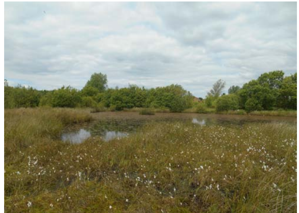
Lowland heath occurs in scattered patches, such as Greencroft and Langley Moor, where heathland is interspersed with mires and small ponds, as a result of local subsidence.

in the area produces a steady supply of meat and replacement breeding stock, much of which is transported to other areas. Short rotation coppice from the area is transported to the Wilton 10 power station in the Tees Lowlands; and wind turbines, such as those around Tow Law, supply power to the National Grid. Wildlife designations shared with other NCAs include the North Pennine Moors Special Protection Area and Special Area of Conservation, which straddles the boundary with the North Pennines NCA.