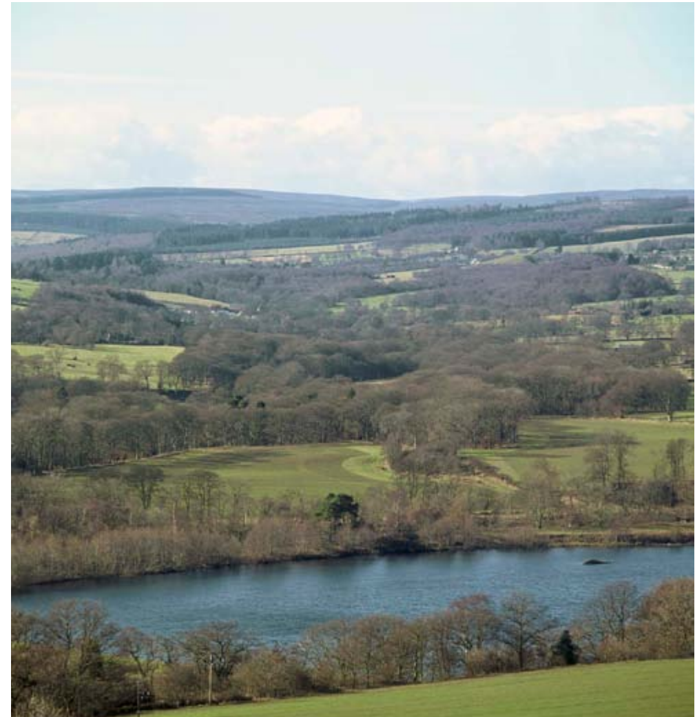
River valleys shelter ancient woodland, and some higher ground affords far-reaching views to the North Pennines to the west.