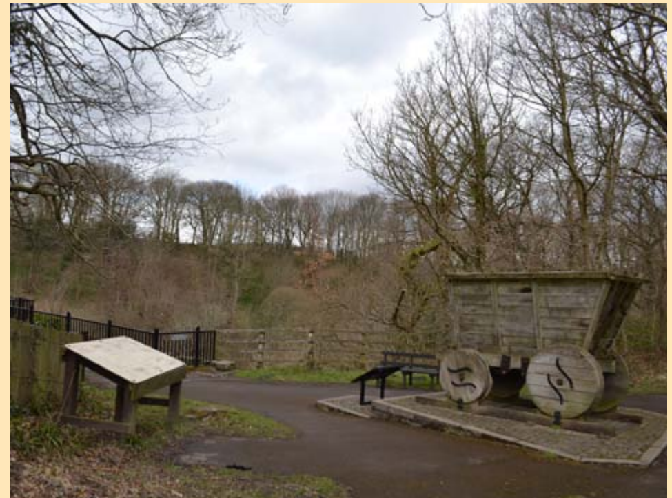
Wooden wagons, such as this one at Causey Arch, were pulled by horses and used for transporting coal, particularly during the 18th Century.