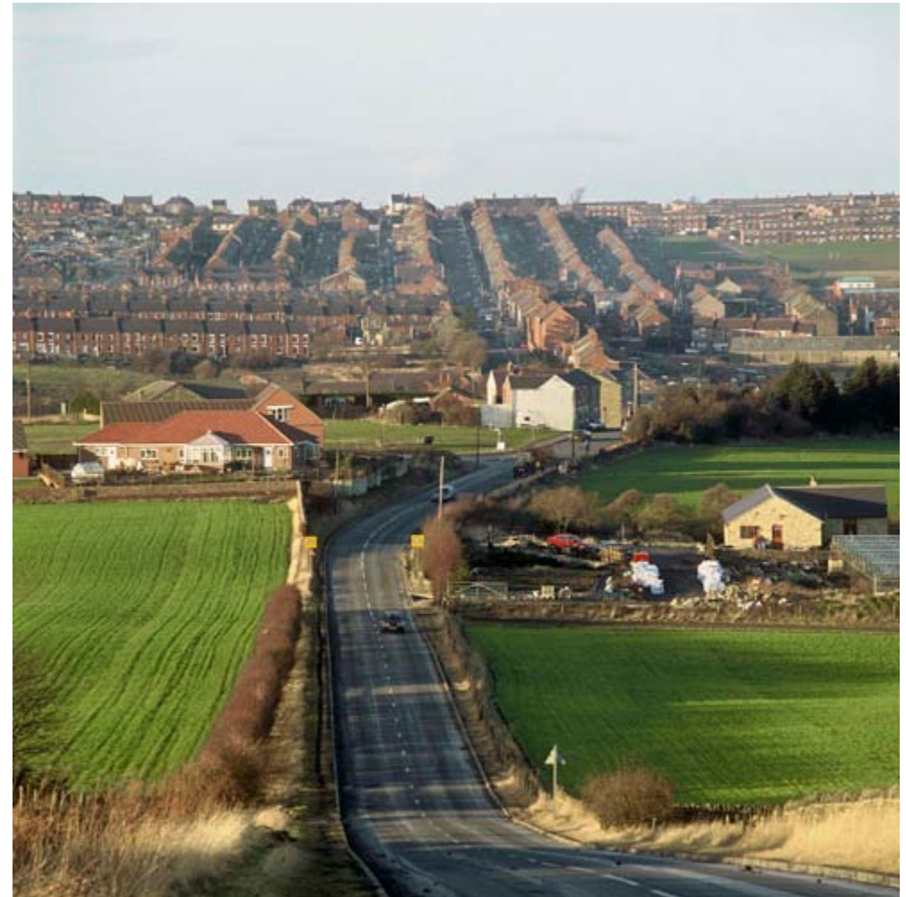
Towns, such as Stanley, developed around coal mines and steel works as the industry developed from the 16th century. These settlements of terraced houses form distinctive features in the landscape.

Rights of way and open green spaces in this area are primarily used by local residents, with the exception of the Sea to Sea cycle route and notable sites such as Hamsterley Forest and Gibside. Upland open access areas to the west give valuable access to larger and more tranquil open spaces, and some of the woodland and forestry plantations, including Chopwell Wood and Hamsterley Forest, also provide large open access areas with good routes for cyclists. Footpaths and cycleways along disused railways, such as the Waskerley Way, are an important asset, often giving good connections between settlements and presenting opportunities for car-free travel to work. The river corridors also provide opportunities for walking, wildlife watching, fishing, swimming and kayaking.