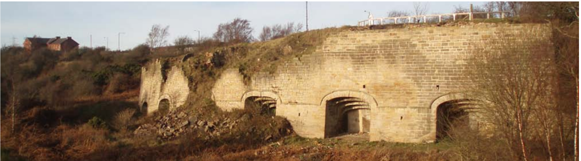
Industrial archaeological sites form prominent features in the landscape, such as Bantling Lime Kilns.

and wildlife, has improved, with the River Wear being named by the Environment Agency in 2011 as one of the most improved rivers in England and Wales; salmon catches increased from 2 in 1965 to 1,531 in 2010. Renewable energy production has also increased in prominence, with an increase in the number of wind turbines, some on former mining sites, and increased production of short rotation coppice for biomass fuel. Environmental agreements taken up in the area for farming and forestry have a particular emphasis on grassland management, hedge/wall restoration and restocking of conifer plantations with broadleaf tree species. Conversely, development has increased, particularly in the urban fringe, and the sense of tranquillity has diminished.