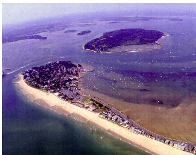
Poole Harbour.