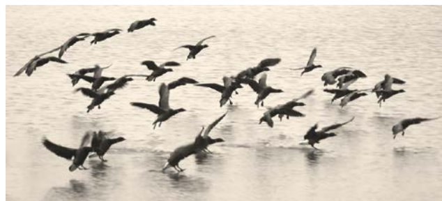
Brent geese.

and occur in internationally important breeding and overwintering numbers respectively.