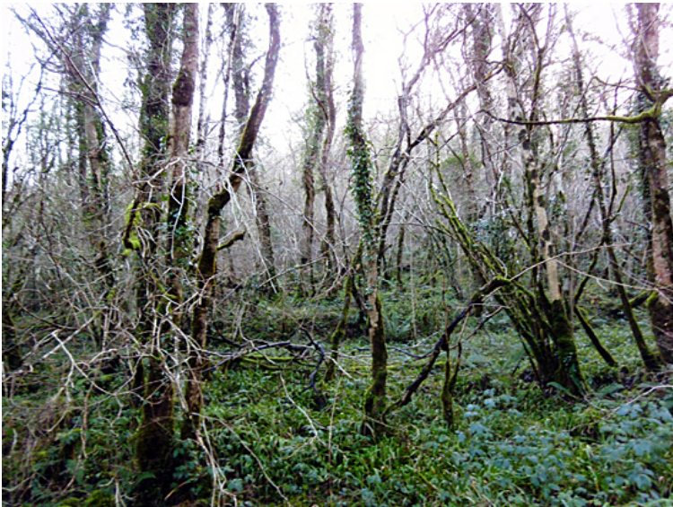
A typical part of the stand at Marble Arch with many young pole stage ash.