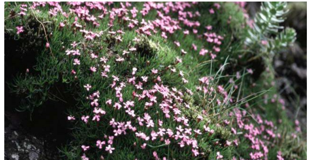
With climate change, species tolerant of cold temperatures, such as the Arctic-Alpine plant moss campion, may be out competed.