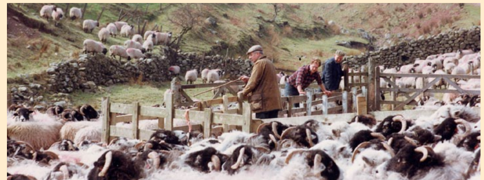
Sorting sheep gathered from the fell: this NCA supports the largest area of common land in England.