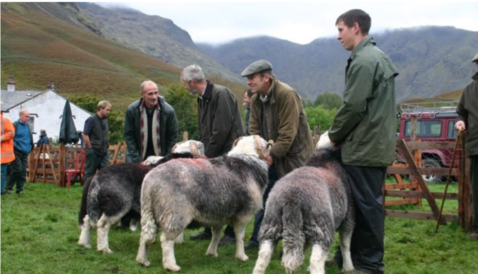
Hardy traditional breeds, such as the iconic Herdwick sheep, can survive harsh fell conditions.