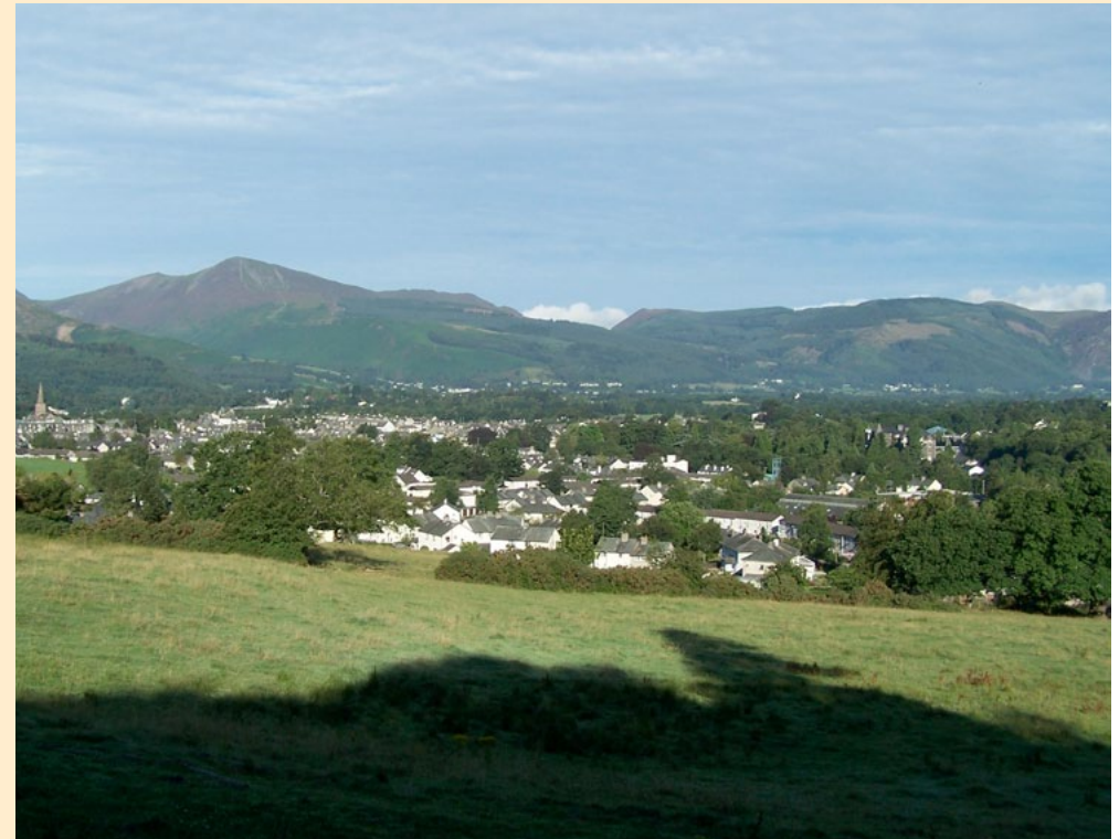
Small market towns of Keswick (shown) and Ambleside are the largest settlements.