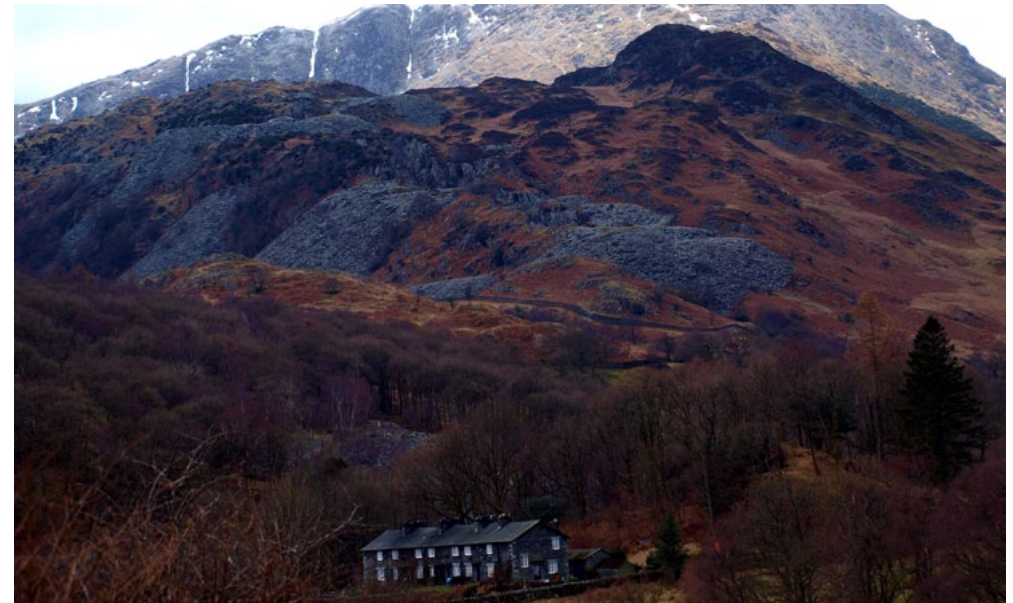
Slate quarry at Tilberthwaite. Local stone is used for traditional buildings.

The dry stone wall network, of small valley bottom in-bye fields, larger intakes on the slopes and unenclosed rough grazing on the fells, reflects the development