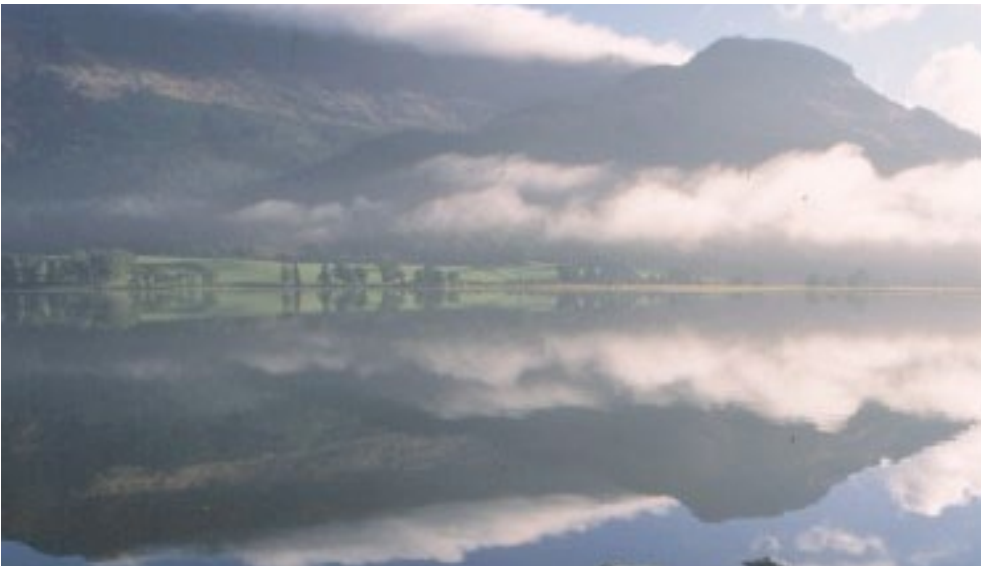
Bassenthwaite Lake: the lakes are a key attraction for visitors and are of international importance for wildlife.