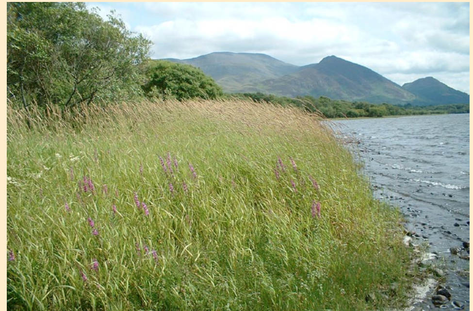
Vegetated lake shore, part of a transition from lake to woodland, Bassenthwaite.