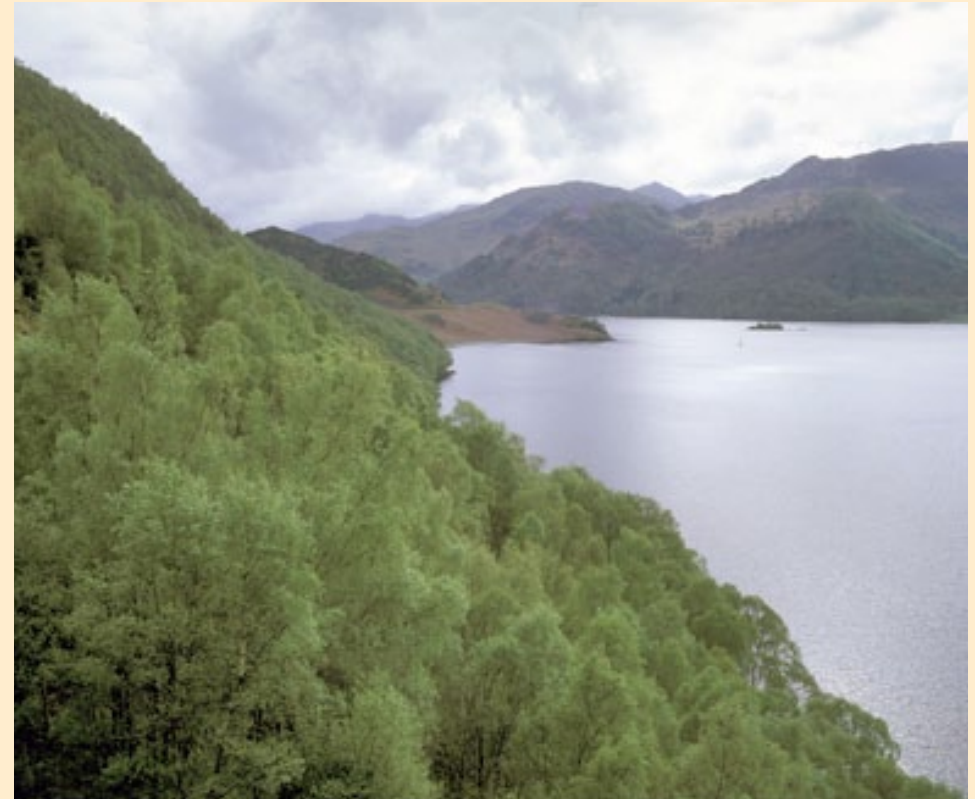
Atlantic oak woodland on valley side above Ullswater. Woodlands store carbon, reduce soil erosion and can contribute to improvements in downstream water quality and flood risk.