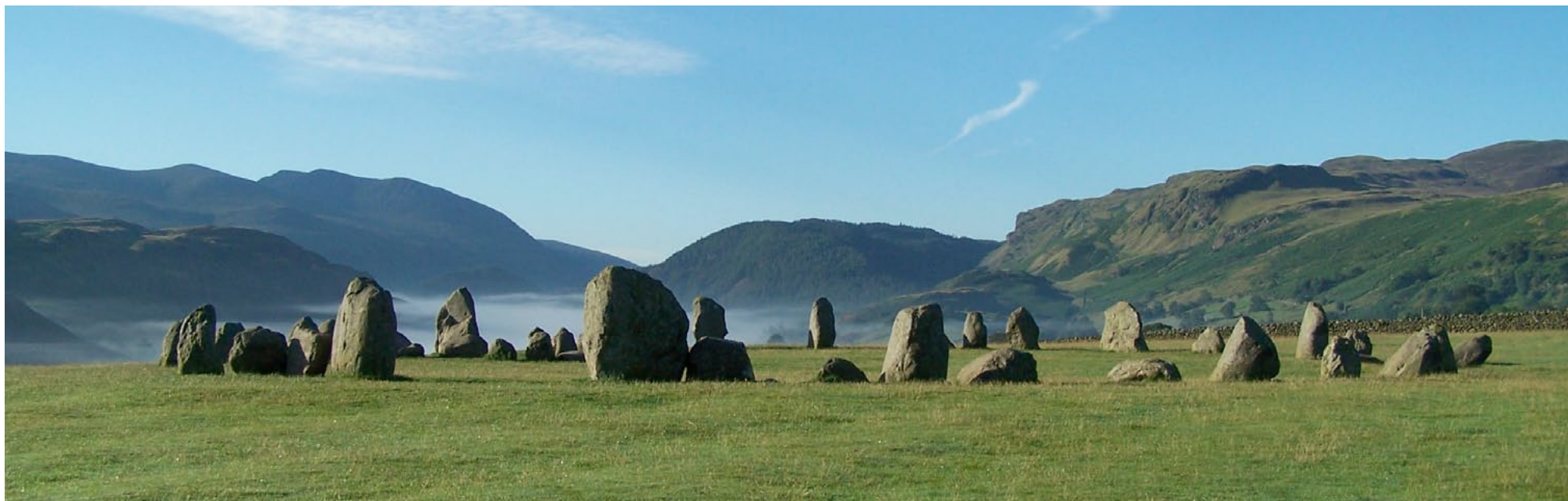
Castle Rigg Neolithic stone circle: the area has been settled and farmed from the prehistoric period.

Biodiversity and geodiversity are crucial in supporting the full range of ecosystem services provided by this landscape. Wildlife and geologically-rich landscapes are also of cultural value and are included in this section of the analysis. This analysis shows the projected impact of Statements of Environmental Opportunity on the value of nominated ecosystem services within this landscape.