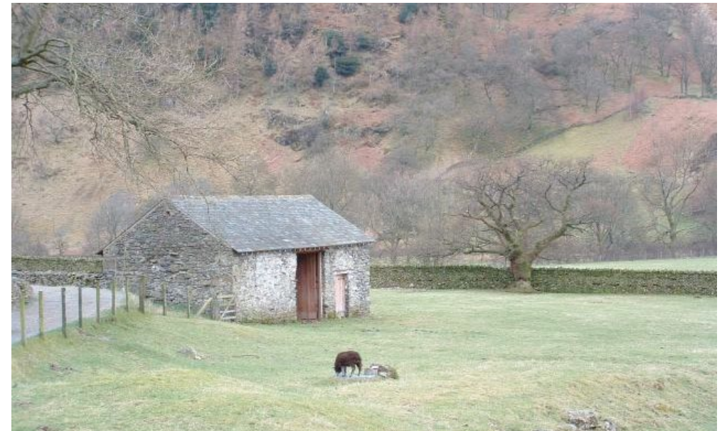
St John's in the Vale. Traditional barn and in by grassland, enclosed by dry stone walls, with wooded valley side behind.