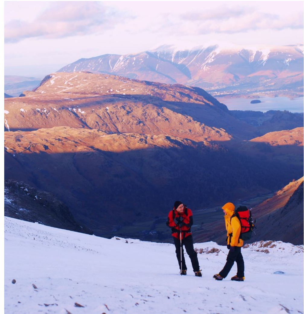
Walkers above Borrowdale: this area is nationally renowned for its outdoor recreation.