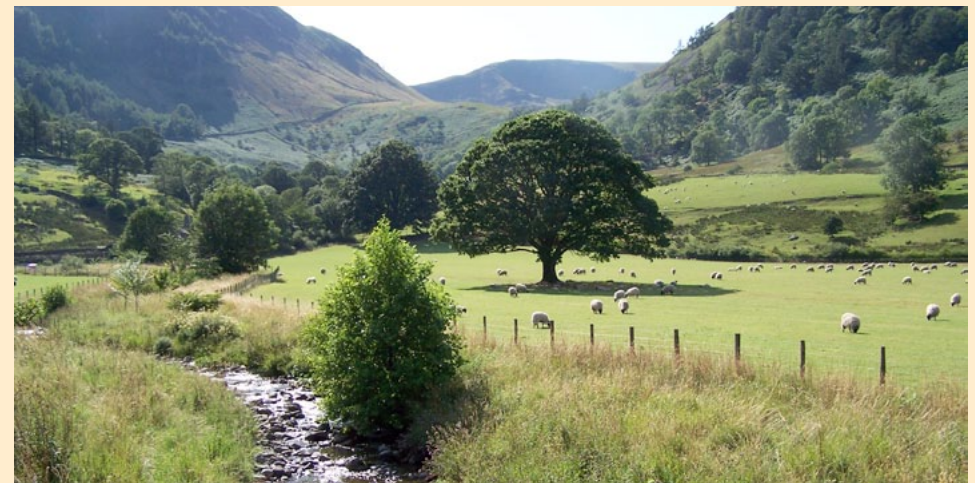
Network of inbye fields. Traditional species-rich pastures and meadows are now rare.