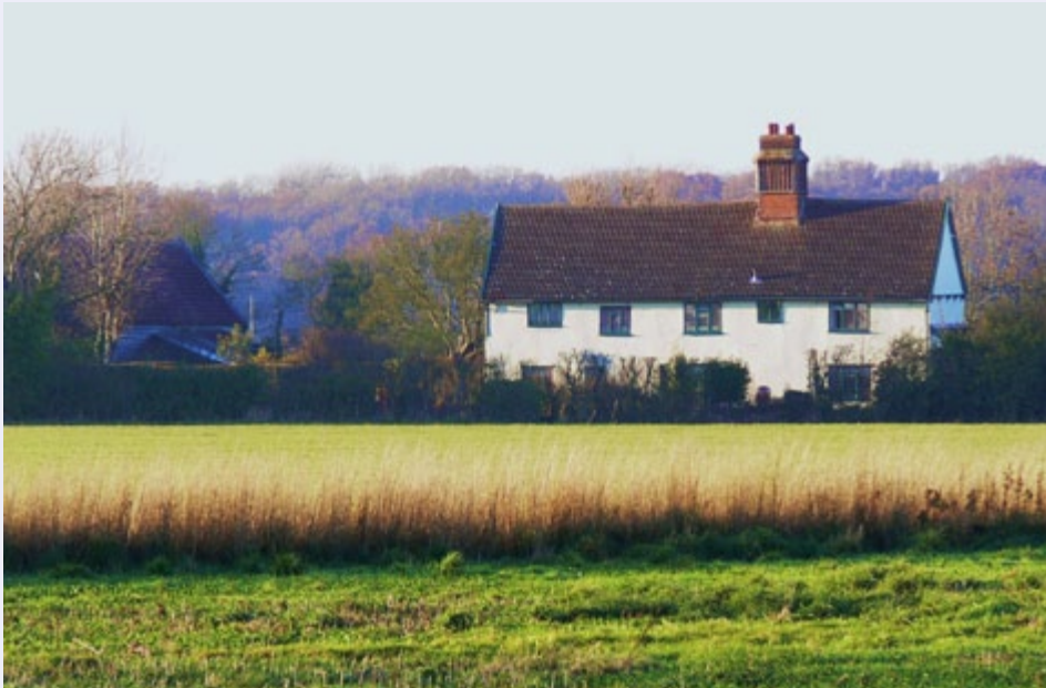
Isolated, timber-framed farmhouses with steeply pitched clay tiled or thatched roofs, are a key characteristic of the plateau claylands.