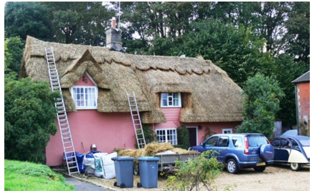
A new thatch, being applied to a timber framed, rendered and colour-washed cottage.