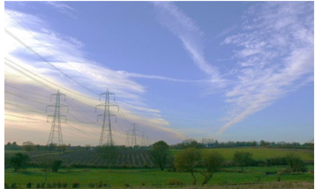
The modern shapes of pylons and high-tension overhead powerlines crossing the ancient countryside in the south-east of the NCA near the village of Clopton.

The area does not support high levels of recreation, although canoeing is popular on the River Waveney. The Boudicca Way and Angles Way long-distance footpaths and the intricate network of quiet minor roads that link settlements provide good access to the countryside for walkers, horse riders and cyclists.