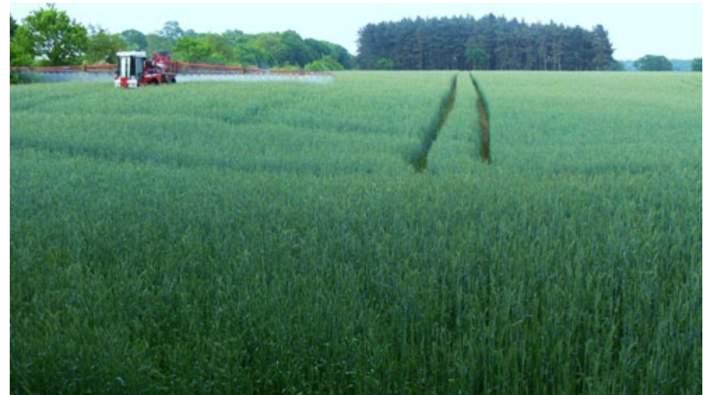
Early summer agricultural spray application to barley that is being grown on the widespread moderately fertile chalky clay soils.