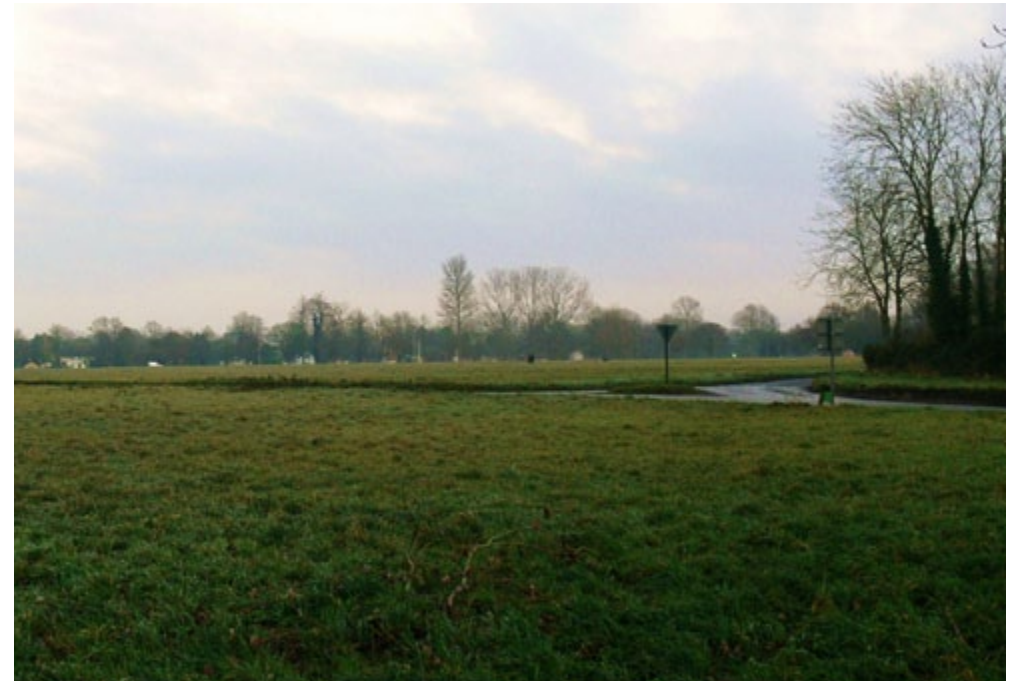
The wide village green at Old Buckenham in Norfolk, with the village spread thinly around its edges. The green covers 16 hectares and is one of the largest in East Anglia.

Since the 1940s changes in farming methods have had an impact on farmland habitats and species once common on arable land such as tree sparrow, grey partridge, cornflower and brown hare have significantly declined in numbers. Over recent years the uptake of agri-environment options for land management has targeted this decline. Sustainable approaches to commercial farming practices are key opportunities for this NCA.