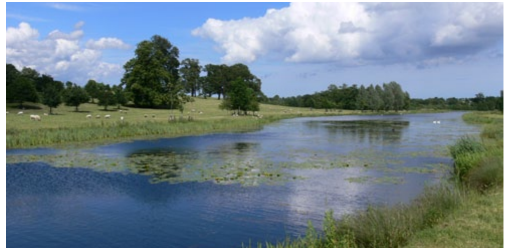
The 'Capability' Brown landscape at Heveningham Hall. Here the River Blyth has been restored to its medieval meanders and up to 20 hectares of broadleaf woodland is being planted each year.