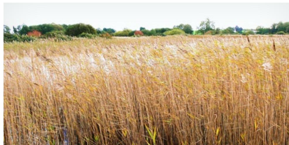
Redgrave and Lopham Fen form part of the internationally important Waveney-Little Ouse Valley Fens. The wetland habitat supports species including the rare Desmoulin's snail and fen raft spider.