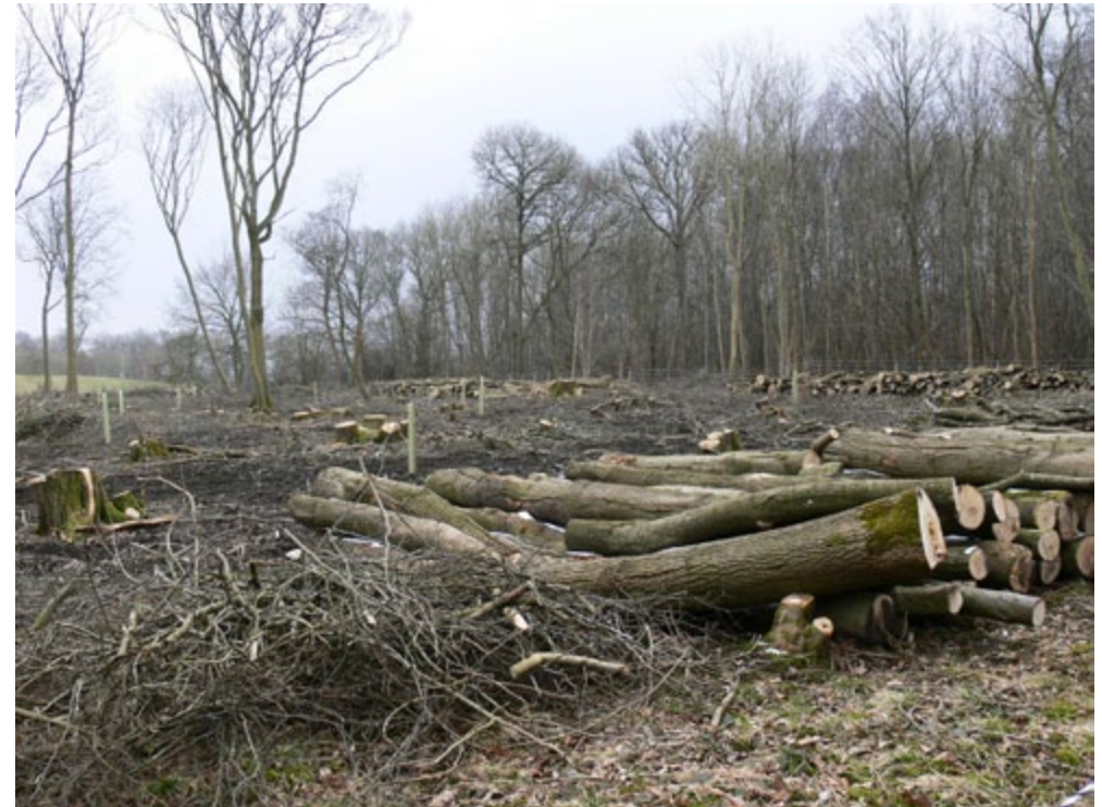
Coppice management and replanting at Wyken Wood near Stanton. As well as improving ancient woodland habitats, the timber is also used to fuel a woodchip boiler that is providing sustainable energy for the Wyken Farm enterprise.

Key transport links include the A11, A12, A14, A140 and A143 main roads, together with the Norwich to London main rail line and branch lines between Ipswich and Cambridge, Ipswich and Lowestoft (East Suffolk Line), Cambridge and Norwich (Breckland Line) and Wymondham and East Dereham (Mid Norfolk Railway).