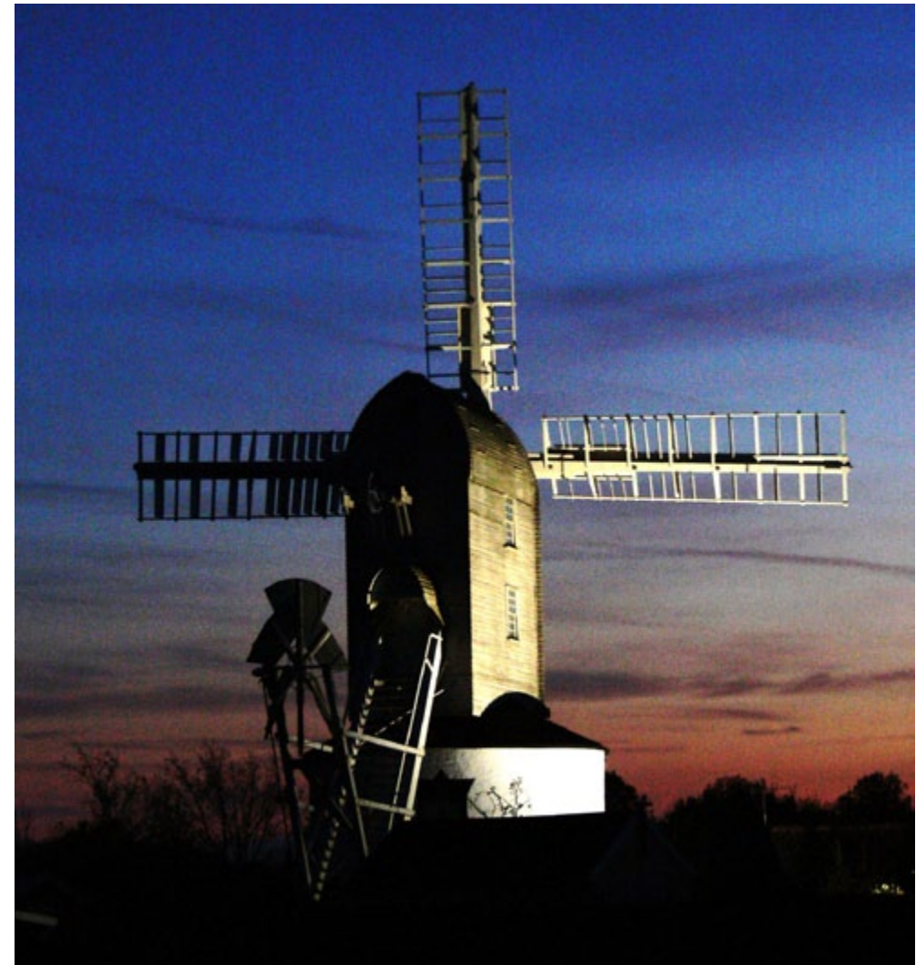
Saxtead Post Mill provides a strong sense of place and history, as seen here lit by the High Suffolk evening light.