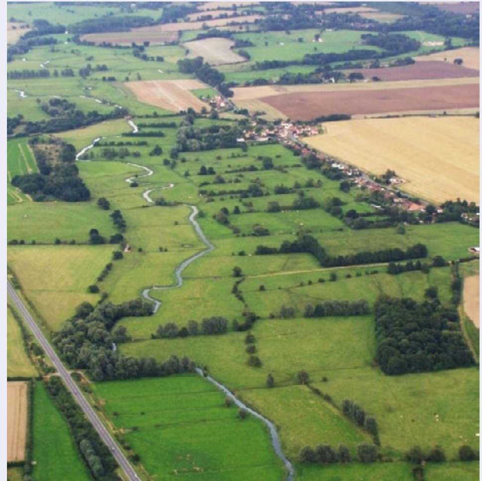
Looking east along the A143 and the meandering River Waveney, with the Suffolk village of Oakley on the boundary with Norfolk.