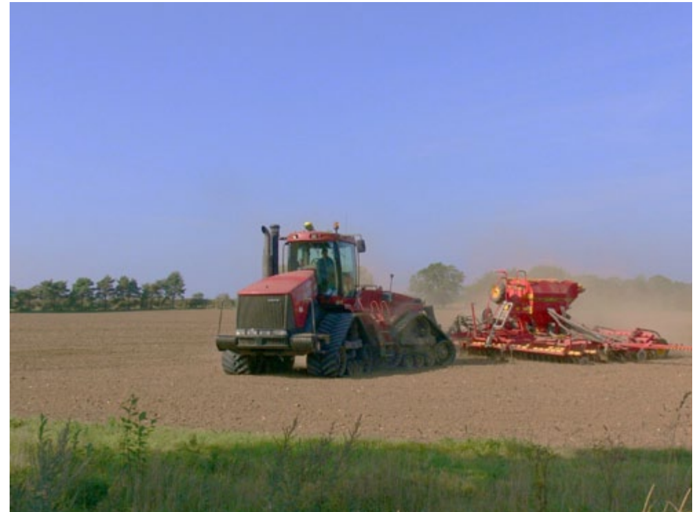
Sowing the dry clay soils. Adapting agricultural practices in response to water availability will become increasingly important if climate change increases the frequency of periods of drought.