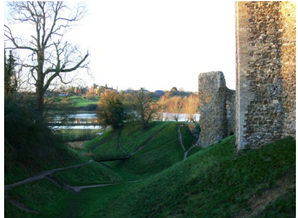
Framlingham Castle has gone through numerous changes since the 12th century. It is now a Scheduled Monument owned by English Heritage who enhance public awareness of the breadth of historic wealth by working to conserve this site.