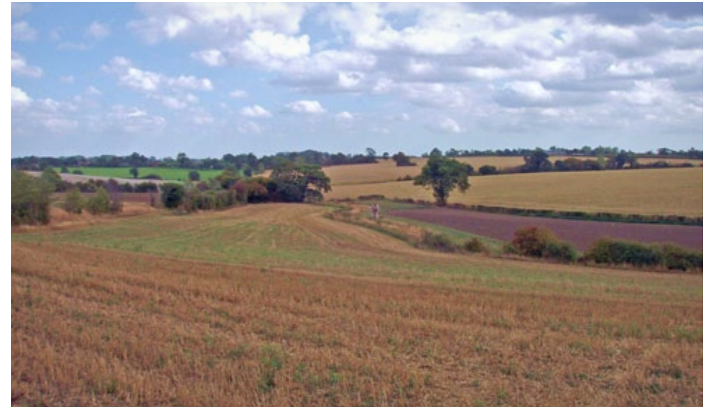
The ancient countryside of irregular medieval fields, old species rich hedgerows and hedgerow trees. Arable farming dominates, particularly cereals, as seen here in the Sconch Beck Valley, Homersfield.

The area is predominantly agricultural with arable farming dominating, particularly cereals, sugar beet and oilseed rape, whose bright yellow flowers make a dramatic visual statement across the plateau in early summer. Intensive pig and poultry rearing takes place in large units, especially in the areas of lighter soils around the edges of the plateau and sometimes on redundant airfields. There is a strong contrast between the treed small-scale pastures and wetland vegetation in the shallow river valleys, such as along the Deben, and the large arable, ditch-