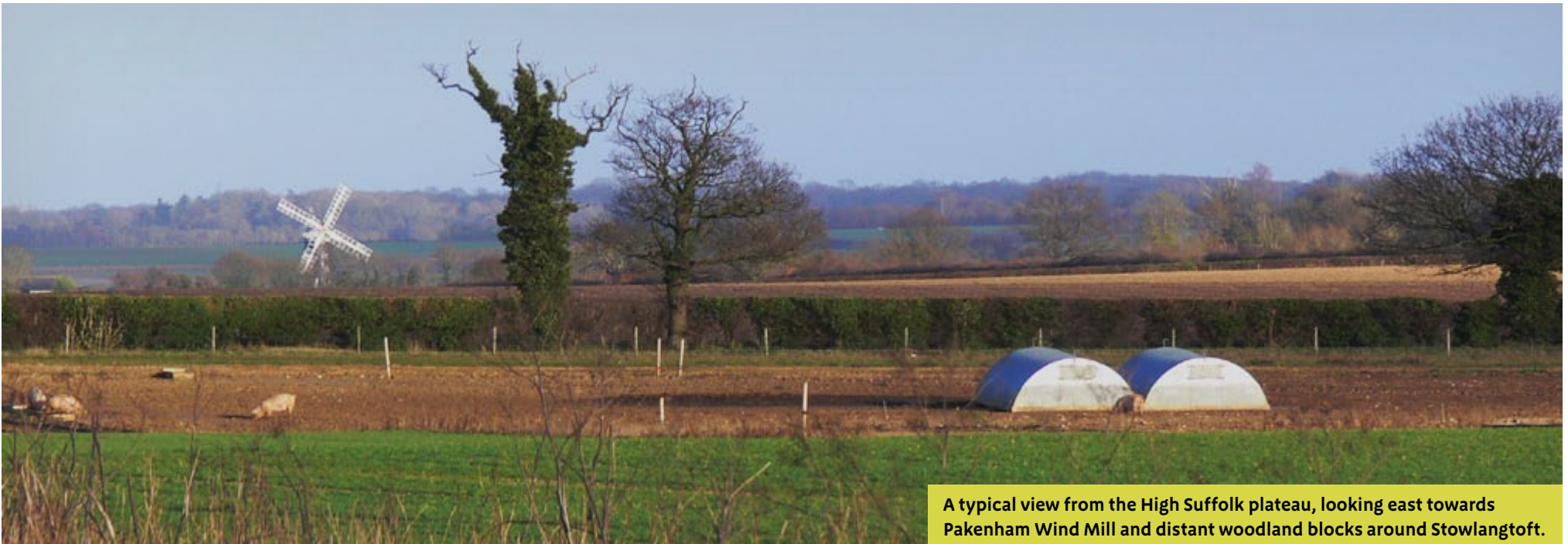
A typical view from the High Suffolk plateau, looking east towards Pakenham Wind Mill and distant woodland blocks around Stowlangtoft.

Biodiversity and geodiversity are crucial in supporting the full range of ecosystem services provided by this landscape. Wildlife and geologically-rich landscapes are also of cultural value and are included in this section of the analysis. This analysis shows the projected impact of Statements of Environmental Opportunity on the value of nominated ecosystem services within this landscape.