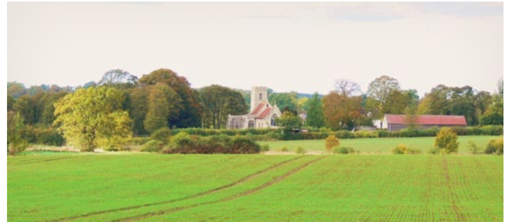
The medieval church of St Andrew at Norton, one of a large number of medieval churches that appear as focal points in the landscape.

There was certainly human occupation in this area before the Anglian Glaciation but most traces of it have been obliterated by the Anglian ice sheet. Hoxne is the most important post-Anglian Palaeolithic site and type-site for the Hoxnian Stage of the Pleistocene. Later prehistoric settlement focused on the fringes of the plateau and the river valleys, whose slopes were easier to drain and cultivate than