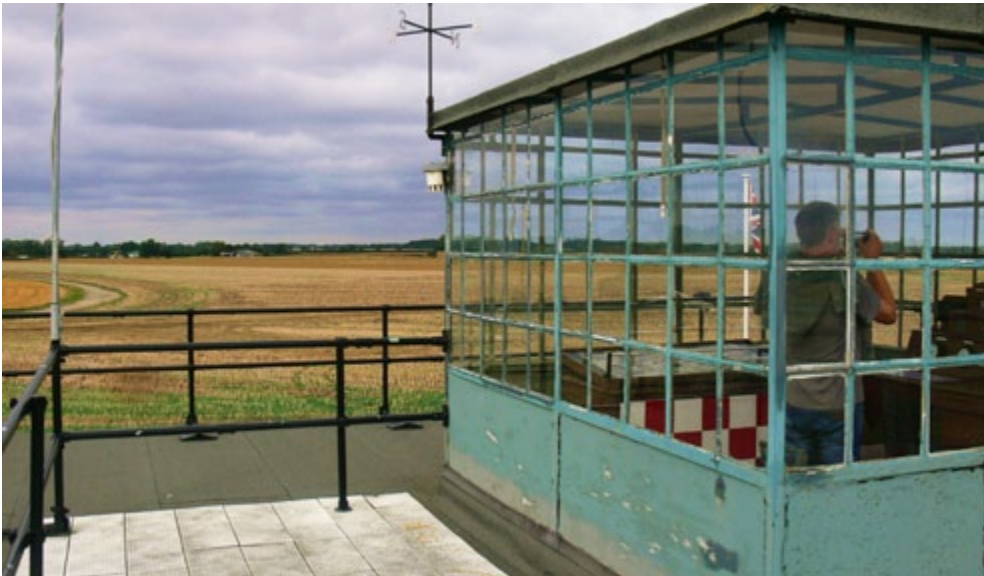
The view from the control tower at the old Parham Airfield (also known as RAF Framlingham). Parham was one of many military airfields built across the open expanse of the flat plateau during the 1940s.

Today, comparatively little remains of the historic wood pasture which characterised this area up until the 18th century, but woodland has always been carefully husbanded as the numerous hedgerow trees, both standards and pollards, bear witness. Copses have been planted as game cover and there is still a scatter of ancient semi-natural woods such as Burgate Wood and Wyken Wood. While only a fraction of the species-rich grassland that existed in the 1940s remains, a significant proportion is managed sympathetically by owners and new species-rich hay meadows have been created in private nature reserves and through community-based projects. Some 90 per cent of the remaining wetlands – five valley fens – are looked after by the Suffolk Wildlife Trust as nature reserves, and agri-environment initiatives are working well to preserve the traditional function and appearance of the fragile valley ecosystems, especially in the Waveney Valley.