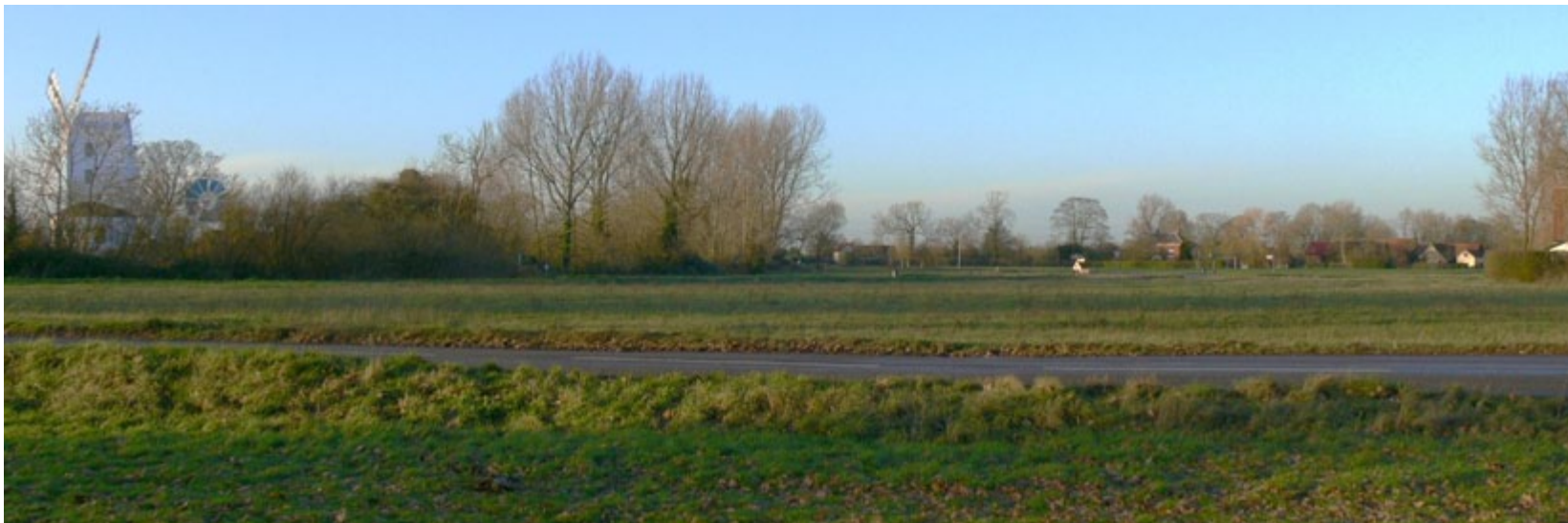
The characteristic historic settlement pattern of Saxtead Green with its historic Post Mill, one of many built across the area from the late 13th century.

SEO 4: Protect and enhance the area's ancient semi-natural woodlands, copses, river valley plantations and ancient boundaries including hedgerows and hedgerow trees, through the management of existing and the creation of new woods and hedgerows to benefit biodiversity, landscape character and habitat connectivity, and for the benefits to soil erosion reduction, water infiltration and quality, timber provision and carbon storage.