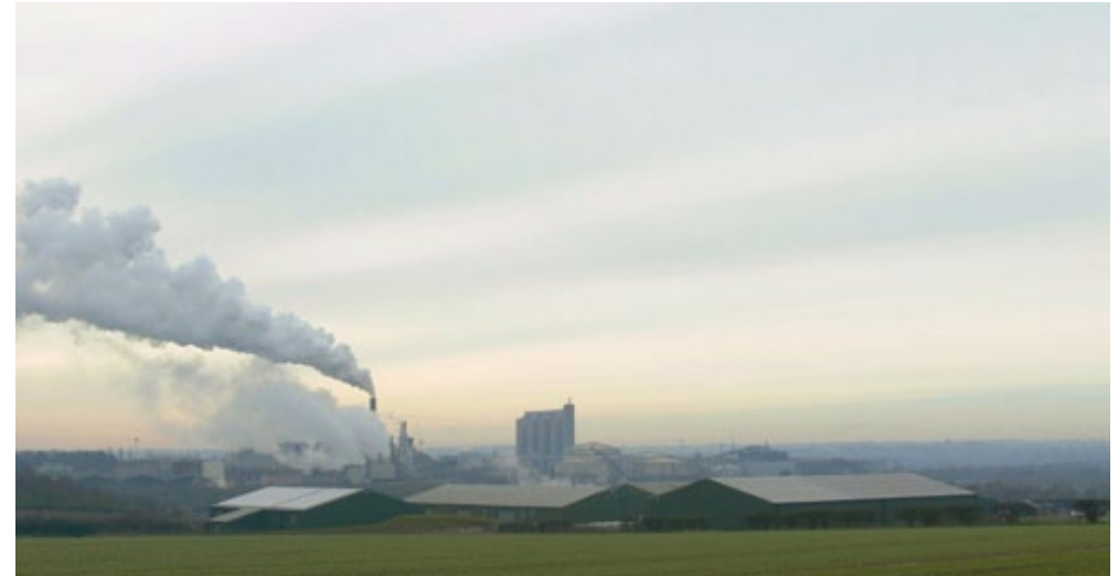
The British Sugar factory at Bury St Edmunds processes the sugar beet grown in the NCA and dominates views to the south-west.

The NCA's main rivers begin on the plateau and flow out into the surrounding NCAs and so provide ecological and hydrological links. The ecological status of the river valley habitats and many of their ecosystem values are subsequently dependent on sustainable water management and land use practices within