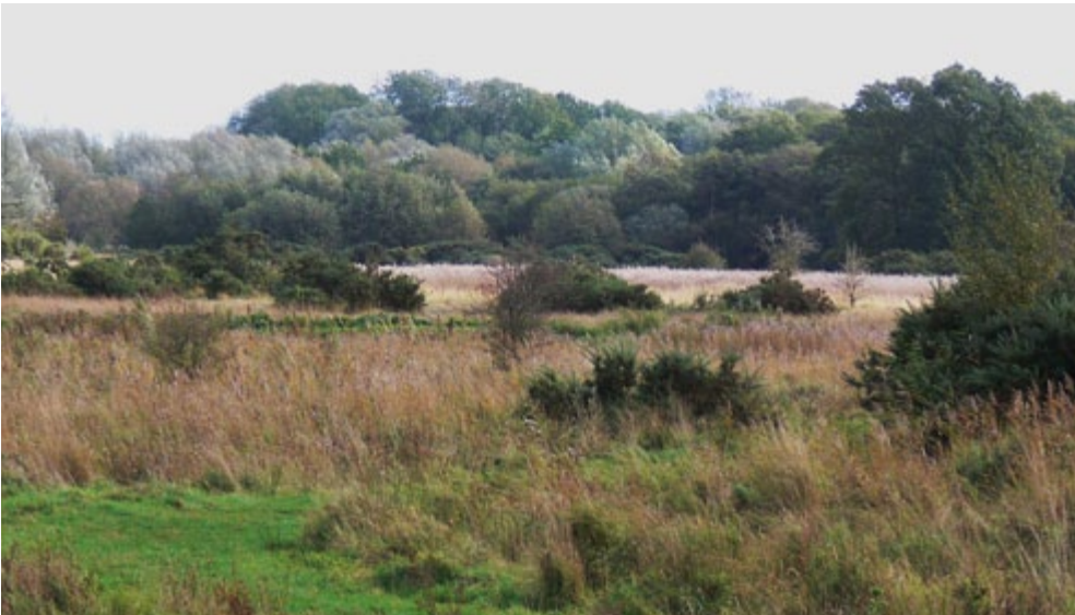
Redgrave and Lopham Fen SSSI/Ramsar, the largest remaining river valley fen in England and the source of the River Waveney.

The area's rich archaeology provides evidence of a long history of settlement, including the Palaeolithic archaeology at Hoxne, the Scole Roman settlement, Eye's Norman motte-and-bailey castle, the late-12th-century stone castle at Framlingham and Wymondham's Benedictine abbey. The area is exceptionally rich in Saxo-Norman and later medieval round tower churches, with a convergence towards the Waveney Valley. Numerous 19th-century windmills form distinctive landmark features, such as Saxtead's post mill and Billingford's tower mill, alongside modern