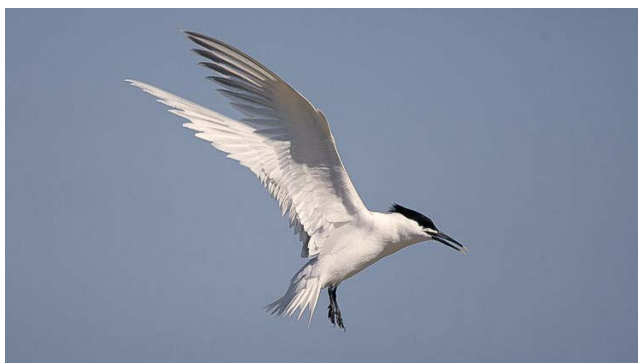
Sandwich tern.

Morecambe Bay and the Duddon Estuary SPAs support important breeding colonies of several seabird species, including Sandwich and little tern. The breeding colonies for Sandwich tern are already protected in both SPAs, little tern breeding colonies are only protected in Morecambe Bay SPA. Tern species are called 'central place' foragers, meaning they move out from and return to a central place (their nest) on every foraging trip. Although this constraint means they have a limited foraging range and a strong energetic incentive to forage as close to their colony as possible, the areas utilised by both Sandwich and little tern extend outside the existing Morecambe Bay and Duddon Estuary SPA boundaries. These foraging areas need to be considered for protection.