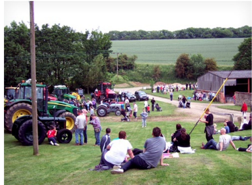
Farming is an important part of life in the Lincolnshire Wolds. The quality of the soil underpins the provision of food.

The soil patterns are a close reflection of the solid and drift geology. To the north, plateau tops are dominated by light, chalky soil. On the west scarp edge there is a striking variation of colour and texture reflecting the underlying Red Chalk and Lower Cretaceous beds. To the south-east the clayey tills give rise to heavy, seasonally waterlogged soils whereas near the Lymn Valley, Spilsby Sandstone provides the parent material for well-drained, sandy loams. In the Bain Valley there are deep, coarse permeable loams except where the presence of Jurassic Kimmeridge Clays gives rise to localised wet areas.