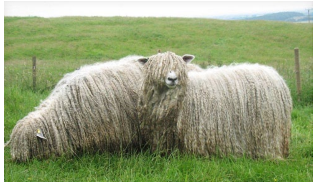
Lincoln Longwool rare breed sheep.

The area was once well populated but as a result of disease and other factors depopulation occurred leading to the numerous deserted villages across