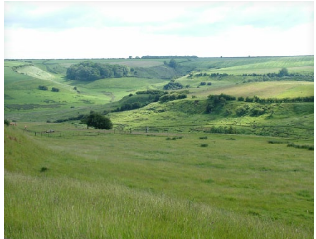
Nettleton Valley was once the home of Roman occupiers and of early ironstone mining activity.

The area still retained a substantial number of villages until the final phase of enclosures in the later 18th and early 19th centuries, maintaining a sparse and dispersed settlement pattern, especially on the high Wolds. In the north the villages remained simple and nucleated while in the south a rectangular plan with lanes enclosing a central area of cottages, farmhouses and paddocks emerged, now seen in villages such as Old Bolingbroke. Owing to the varied geology, the Wolds did not develop a unified pattern of building materials or styles. The local chalk was generally a poor building material, being crumbly and weak, but was used in medieval buildings such as the now ruined church at Calceby (meaning the farm or small settlement on the Chalk), later being replaced by brick or other stone. In the north-west, the locally quarried