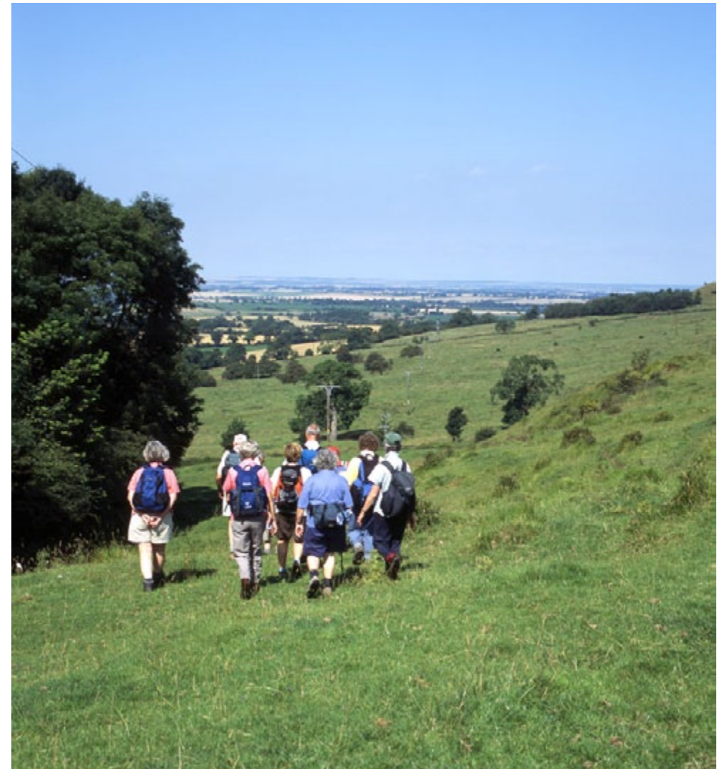
Walkers in the Lincolnshire wolds.