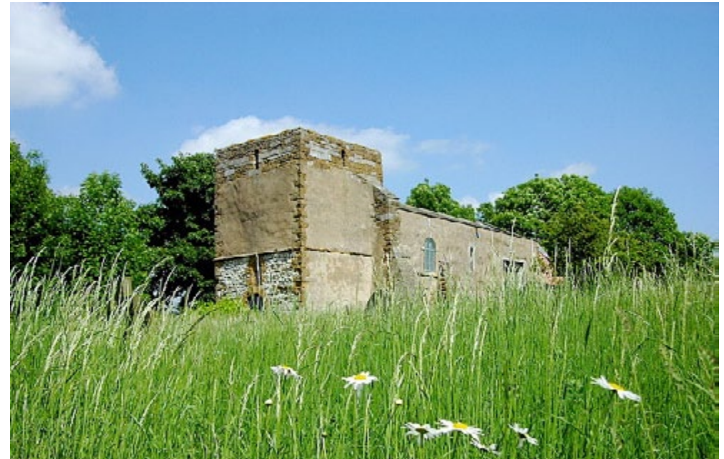
St. Mary's Church, Barnetby-le-Wold. An ancient church on the edge of the Wolds as they slope down to the Humber.

The area has inspired many artists, writers and poets including Tennyson, the 19th-century Poet Laureate, who came from Somersby. This part of Lincolnshire attracts increasing numbers of visitors and a variety of cultural and community activities continue today in celebration of the Wolds' rich local heritage. The Viking Way long-distance footpath passes through the Wolds as does the National Cycle Network.