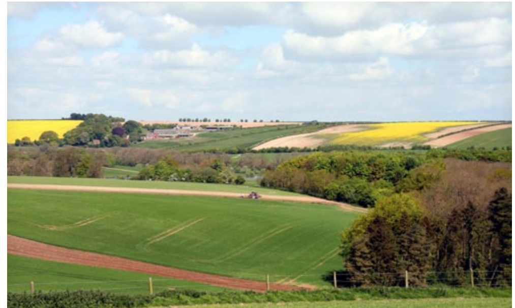
Farming plays a major part in the Lincolnshire Wolds where fields are predominantly arable.

There are a number of rivers which rise in the NCA including the Great Eau, Lymn, Bain and Waithe Beck. The waterbodies in the northern part of the NCA – Laceby Beck and Waithe Beck – are 'over abstracted' according to the CAMS for the area. The Great Eau and Lymn are 'over licensed' while the Bain is assessed as having 'no water available'.