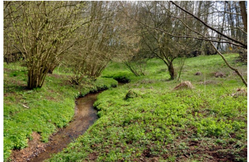
Alder carr woods in the Lincolnshire Wolds at Keal Carr, also a Site of Special Scientific Interest.