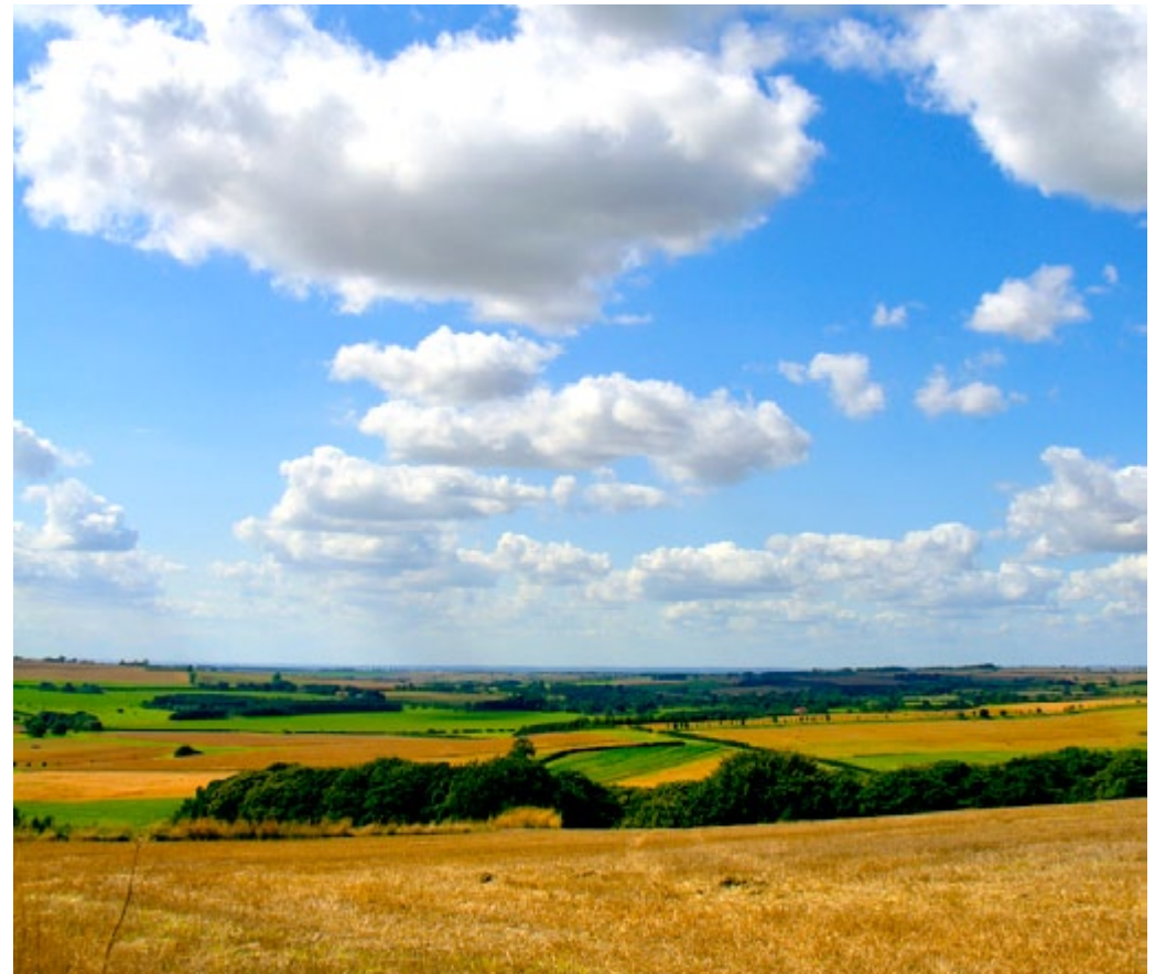
Cawkwell Bank on the edge of the chalk escarpment.

Biodiversity and geodiversity are crucial in supporting the full range of ecosystem services provided by this landscape. Wildlife and geologically-rich landscapes are also of cultural value and are included in this section of the analysis. This analysis shows the projected impact of Statements of Environmental Opportunity on the value of nominated ecosystem services within this landscape.