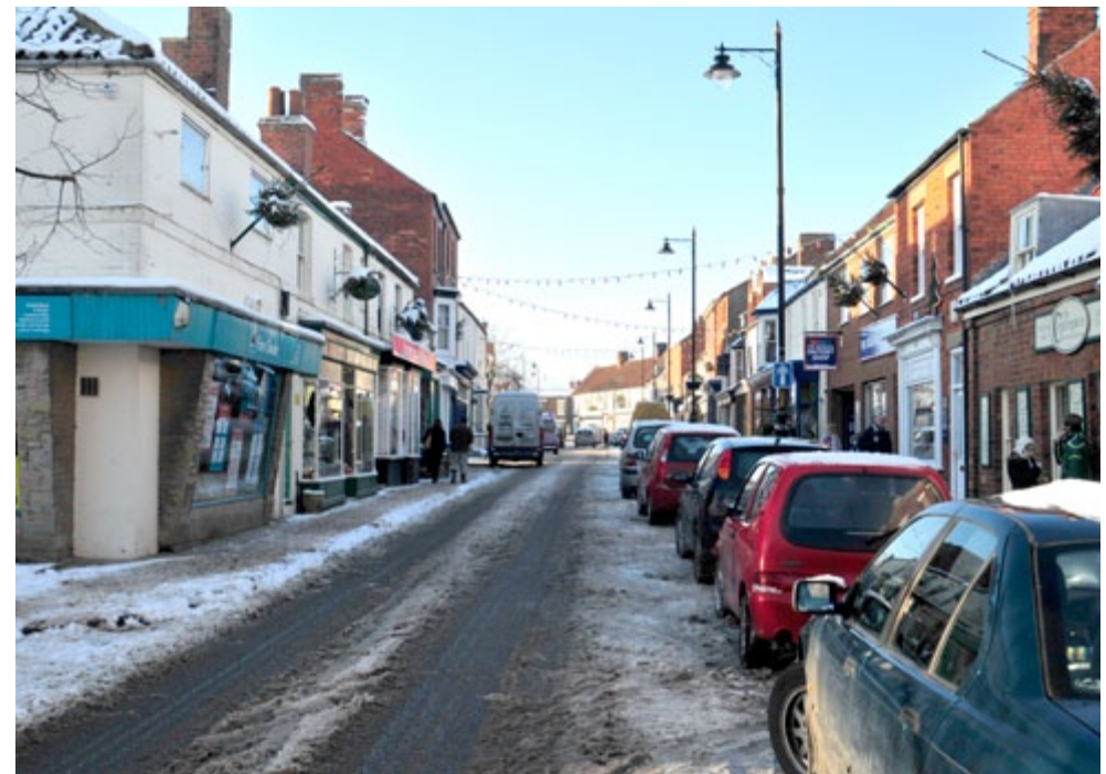
The historic environment is visible in Spilsby market town which shows the red brick, characteristic in many traditional buildings and in the settlements of the area.