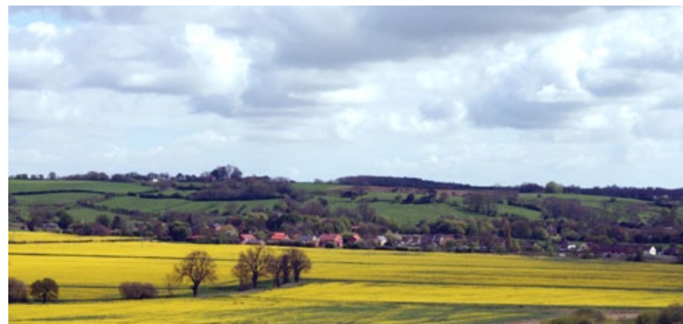
Old Bolingbroke showing settlement patterns within the Lincolnshire Wolds area.