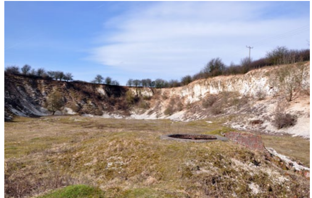
The Chalk bedrock influences the Wolds landscape of today.

There are nine geological and one mixed-interest SSSI. In addition, at least 38 Local Geological Sites can be found here including chalk pits, and although many are inaccessible they are an important resource for research. Red Hill Nature Reserve near Goulceby is an important educational resource, featuring rare exposures of Red Chalk (a formation extending only through Norfolk, Lincolnshire and Yorkshire).