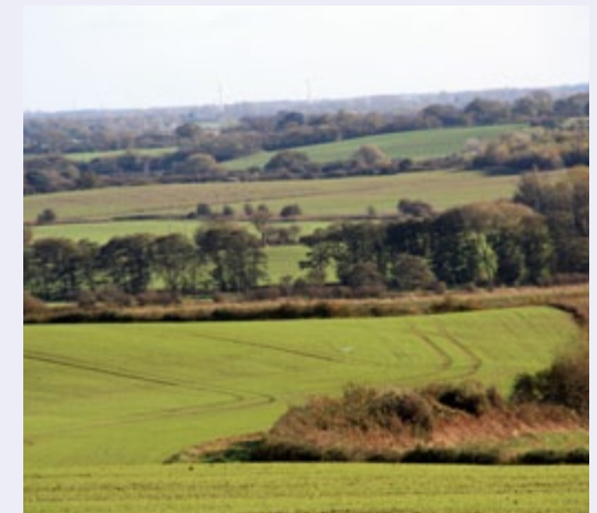
Arable farmland, woodland, hedgerows and gently rolling hills near Horncastle.