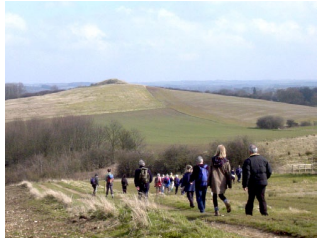
Hoe Hill, at 127 metres, is one of the highest points in the area and an outlier of Roachstone.

The area has a long history of farming as a result of its easily-worked chalk soils and loams. The present landscape of the Wolds is primarily the result of the enclosure of a largely typical open-field farming regime, and the subsequent changes to the associated nucleated settlement pattern. The earliest enclosures are to be found in close proximity to historic settlements. This is quite common