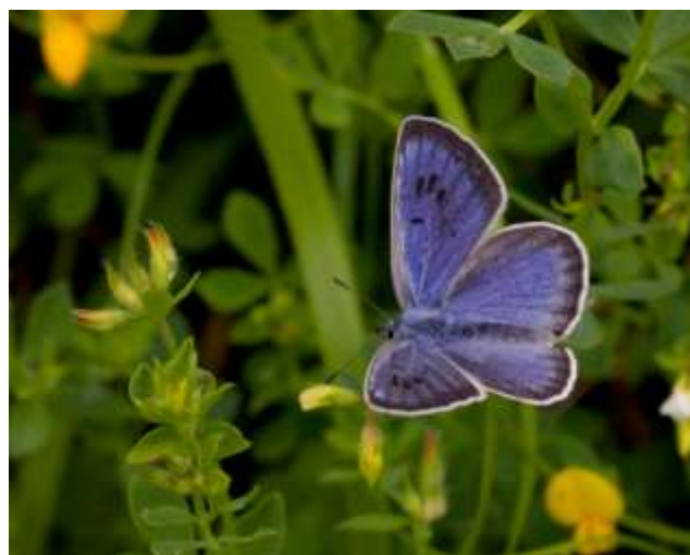
A newly emerged male large blue

The plants and the larvae from different sites need to be kept separate because the work involves studying the changes in populations and variations in DNA that are developing at the different locations - and because the caterpillars eat each other! With every season being a new generation, David and Sarah are watching evolution in action.