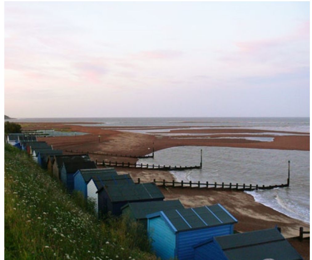
Brightly painted beach huts overlooking shifting shingle banks, caused by deposition and extensive longshore drift, at the mouth of the Deben Estuary.

Biodiversity and geodiversity are crucial in supporting the full range of ecosystem services provided by this landscape. Wildlife and geologically-rich landscapes are also of cultural value and are included in this section of the analysis. This analysis shows the projected impact of Statements of Environmental Opportunity on the value of nominated ecosystem services within this landscape.