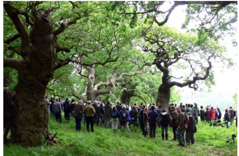
The semi-natural ancient woodland of Staverton Park and The Thicks, Wantisden SAC.

Suffolk Coast and Heaths Natural Area Profile, Suffolk Coast and Heaths Countryside Character Area description.