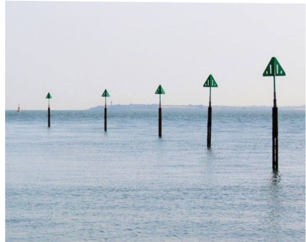
View from Landguard Point across the mouth of the Stour and Orwell Estuary to Walton-on-the-Naze in Greater Thames Estuary NCA.

In the south the NCA shares with the South Suffolk and the North Essex Claylands and the Northern Thames Basin NCAs part of the Dedham Vale Area of Outstanding Natural Beauty (AONB). Views to the Northern Thames Basin NCA are limited but can be had across the open waters of the River Stour and Holbrook Bay as well as along the coast to Walton-on-the-Naze.