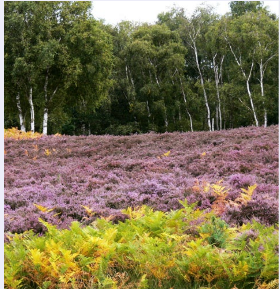
Bracken, heather and birch on Westleton Heath, a fragment of the once extensive lowland heathland resource.