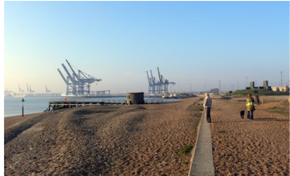
Landguard Fort with its First and Second World War gun emplacements, contrasting with the more recent history of the Port of Felixstowe.

These habitats support an extremely diverse range of priority species including heathland birds such as stone curlew, nightjar and Dartford warbler, found on Blaxhall and Westleton Commons and Minsmere. Marshes (for example, Dingle and Snape wetlands and North Warren) are a magnet for breeding and wintering wildfowl and wading birds including avocet, white-fronted goose, lapwing and redshank. Reedbeds and grazing marshes hold a significant proportion of the UK's marsh harrier and breeding bittern together with otter and water vole. Watercourses support a reasonable cyprinid population dominated by roach, bream, dace and chub. Designations include five SPA, five SAC, four Ramsar sites and over 9,000 ha of SSSI.