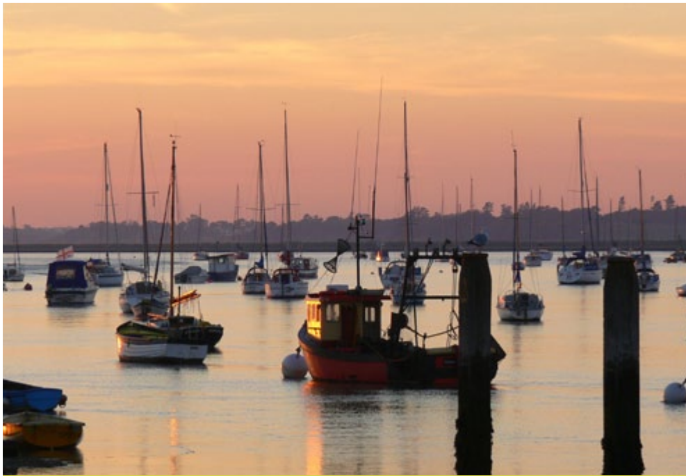
Sense of place provided by moored small boats on the Deben Estuary at sunset.