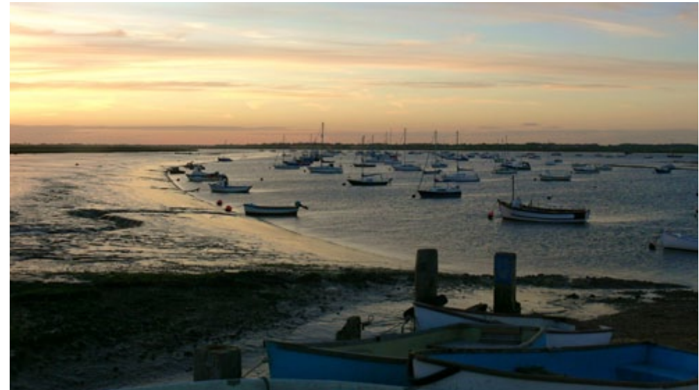
Reflective qualities of the intertidal flats in the Deben Estuary.

The diversity of coastal habitats and their importance for wildlife are recognised by four Ramsar, Special Protection Area (SPA) and Special Area of Conservation (SAC) designations, three National Nature Reserves and numerous Sites of Special Scientific Interest (SSSI). Offshore waters support populations of porpoises and both grey and harbour seals, while the benthic habitats are extensive spawning and nursery grounds for commercial fish and shellfish species including Dover sole, lobster and brown shrimp. A significant proportion of the open waters are also designated as an SPA because of the key bird species that they support (for example, red-throated diver).