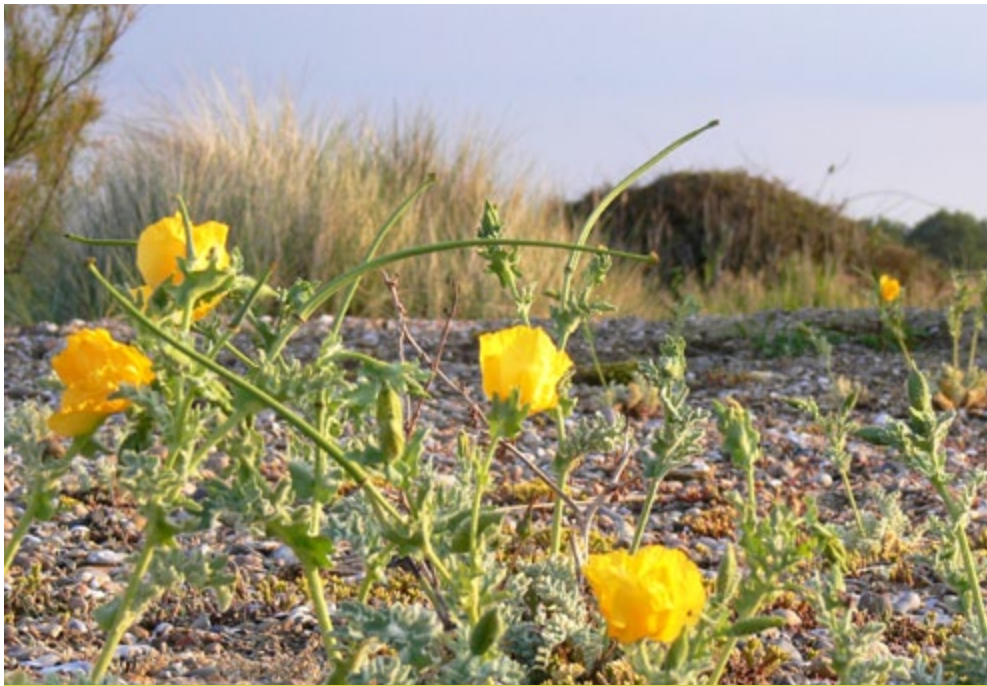
Yellow horned poppy growing on accreted shingle at Minsmere.

of the shingle is not regularly exposed to wave action so has become sufficiently stable to allow plant growth. A wide range of plant communities is present, from pioneer communities of sea pea, sea kale and yellow horned poppy on more mobile shingle to a thin turf of 'shingle heath' on stable areas comprising of sea campion and plants more often found on inland acid grassland. The proportion of sand on the beaches varies. Most beaches are pure shingle but in places the proportion rises to resemble sand dune. Shingle beaches are used by nesting birds such as lesser black-backed gull, little tern and ringed plover, where there is little human disturbance.