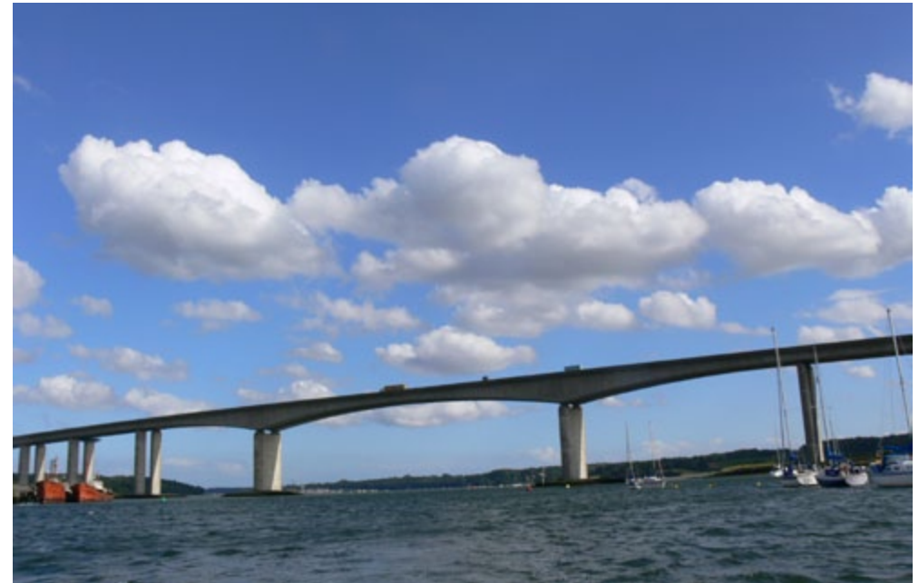
The Orwell Bridge which opened in 1982, carrying the A14 trunk road over the River Orwell.

Today, Sizewell's A and B nuclear reactors (opened in 1967 and 1995 respectively) combine with significant historic military structures including Felixstowe's Landguard Fort (17th century to the Second World War), Napoleonic defences (late 18th and 19th century), Second World War gun emplacements and the Orford Ness 'pagodas' to form distinctive and ethereal features. Distant wind