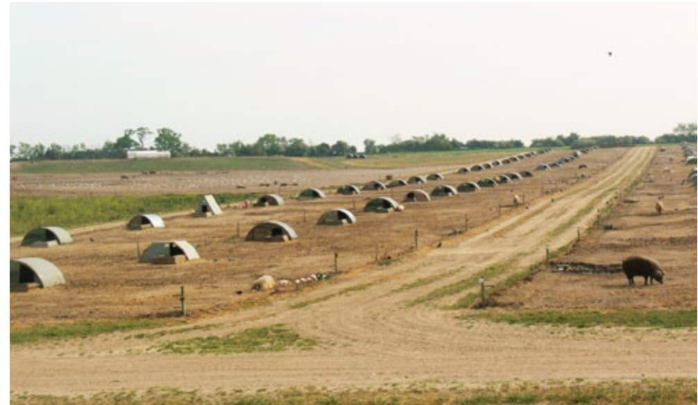
The light sandy soils of the Suffolk Coast and Heaths have suited a recent expansion in out door pig rearing, leading to visual intrusion and high soil nutrient levels. These pigs are at Wenhaston.

enrichment has also adversely impacted upon aquatic communities. The use of floodplains for free range poultry enterprises has increased.