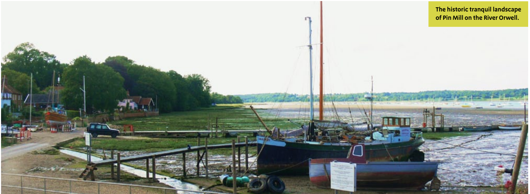
The historic tranquil landscape of Pin Mill on the River Orwell.

Clay has been used locally in old buildings (for example, Orford Castle) and exposures along much of this coast (for example, at Wrabness Cliff, Corton, Nacton and Pakefield) are of great geological and increasingly archaeological interest. The coastal geodiversity features (for example, soft cliffs, shingle spits and banks, including a unique ebb tidal shingle delta known as the Knolls at the mouth of the Deben Estuary) are particularly important for our understanding of Pleistocene geology and the evolution of the coastal landscapes.