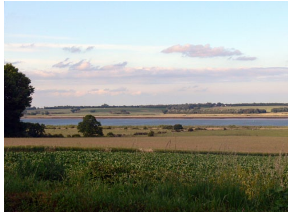
Long expansive views across the River Orwell from the rich agricultural land of the Shotley peninsula.