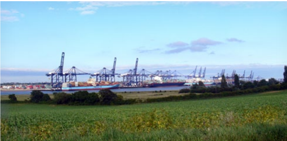
The Port of Felixstowe busy with freight movements viewed across from the Shotley Peninsula.

The large 20th-century Scots and Corsican pine plantations of the Sandlings Forests (Dunwich, Tunstall and Rendlesham) offer vertical and textural landscape elements, giving a sense of uniformity, enclosure and tranquillity. Older, mainly broadleaf plantation woodlands occur within the country house estates and landscaped parklands along the Stour and Orwell valley slopes as well as along the A12 corridor (for example, Orwell Park, Wherstead Park, Holbrook Park and Freston Park). Elsewhere there is a scattering of mixed copses and coverts planted for shooting. Semi-natural ancient woodland and wood pasture is comparatively scarce. Most is located in the parishes of Sudbourne, Wantisden, Rendlesham and Iken. Staverton Park is a unique feature of national importance containing 4,700 medieval pollard oaks, forming a last remnant of the previous landscape.