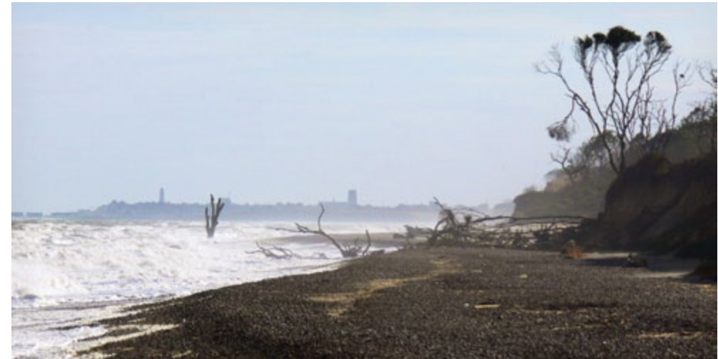
Low elevation, soft crumbling cliff and shingle beaches between Covehithe and Pakefield, ravaged by a winter storm.

The coast is largely undeveloped and undefended with a coast road only between Aldeburgh and Thorpeness. The landscape is subtle with sections of low elevation, soft crumbling cliffs (for example, Dunwich, Covehithe and Pakefield) and shelved, sloping shingle beaches, sweeping in a series of wide bays. The cliff-lines are interrupted by broad inlets such as Minmere and the Blyth Estuary. The cliffs mark a generally receding coastline that displays active coastal processes of erosion and accretion, the southward tidal current carrying eroded material to downdrift beaches. Offshore waters are generally shallow in nature, with highly mobile parallel shoal and sand bank systems, affecting wave and current interactions.