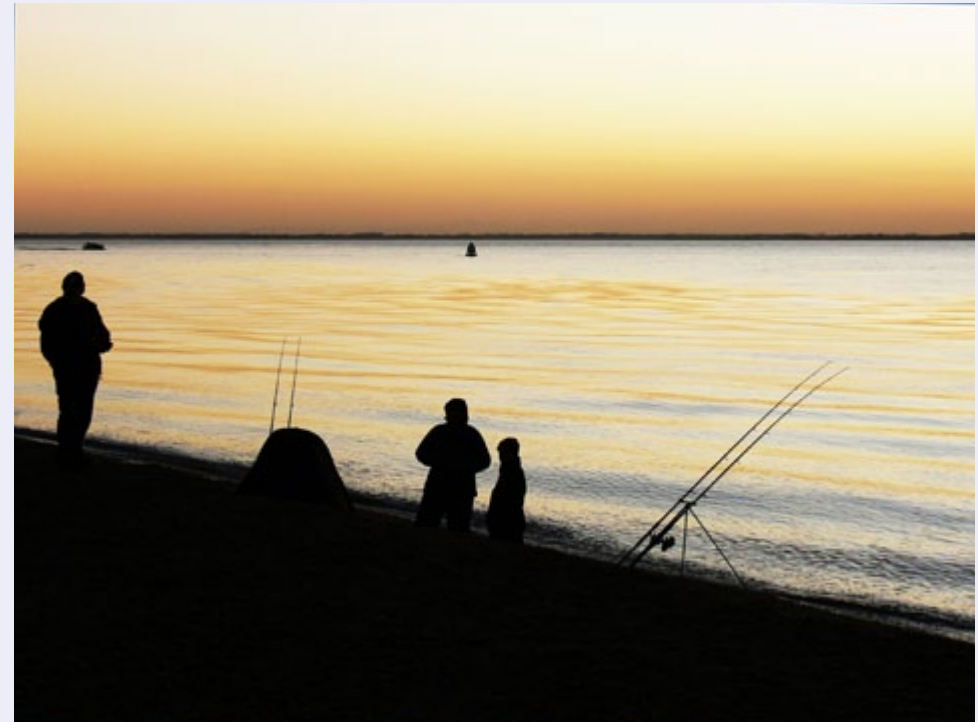
Night fishing by the tranquil waters of the Stour and Orwell estuary.