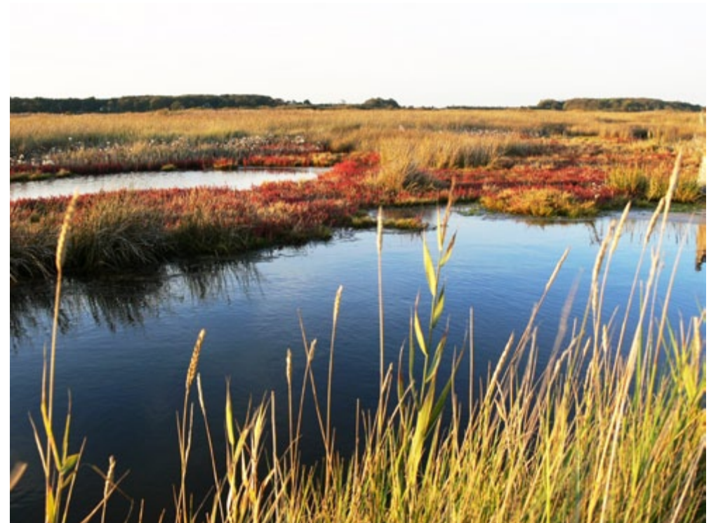
The nationally significant coastal landscape of Dingle Marshes, Dunwich, with its varied carpet of salt marsh plants and brackish pools.