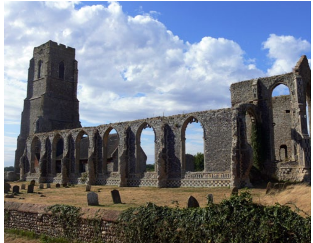
Covehithe Church is one of many historic features in the area that is under threat through continued coastal erosion.