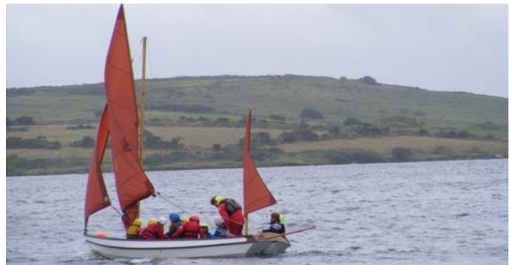
Sailing on Stithians Reservoir.