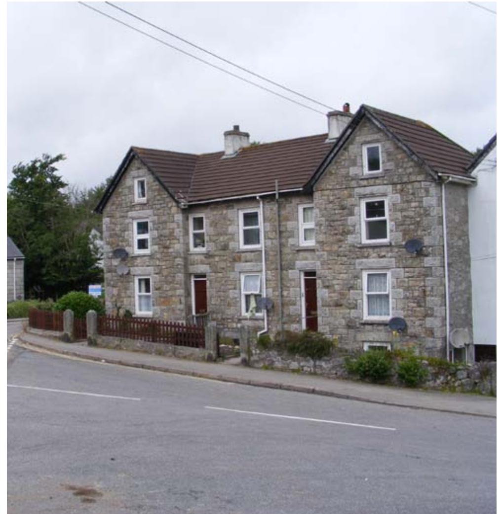
Carnmenellis granite - used as a vernacular building material in Stithians village.

Carnmenellis contains one of Cornwall's most important archaeological sites: Carn Brea is the remains of a Neolithic settlement, dramatically located on top of the detached granite boss towering above Redruth. The area was densely populated in the Bronze Age, when the climate was much milder than it is today. Neolithic farmer/hunters and bronze-age settlers were responsible for much of the woodland removal in the area. Many settlements were abandoned around 1000 bc. During the Iron Age the ramparts on Carn Brea were repaired and re-used and a small settlement of round houses was