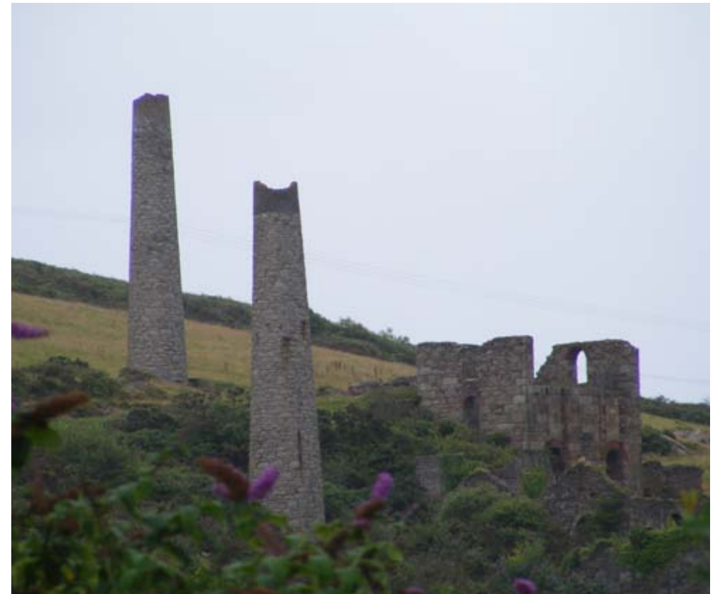
Engine houses and stacks.