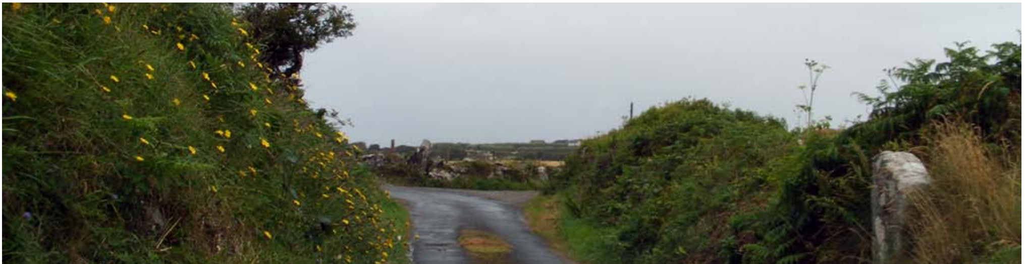
A typical road lined by Cornish Hedges.