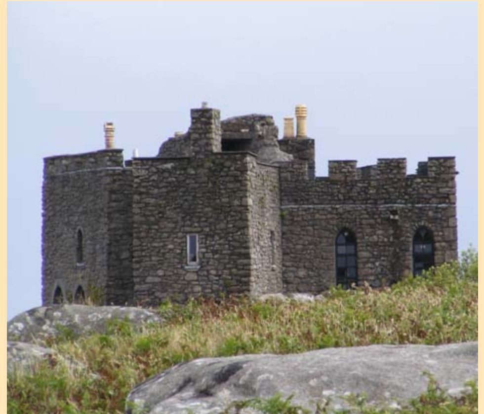
Carn Brea Castle.