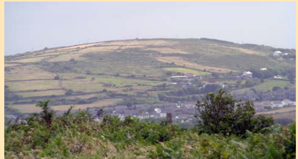
The close proximity between the moorland and the villages.