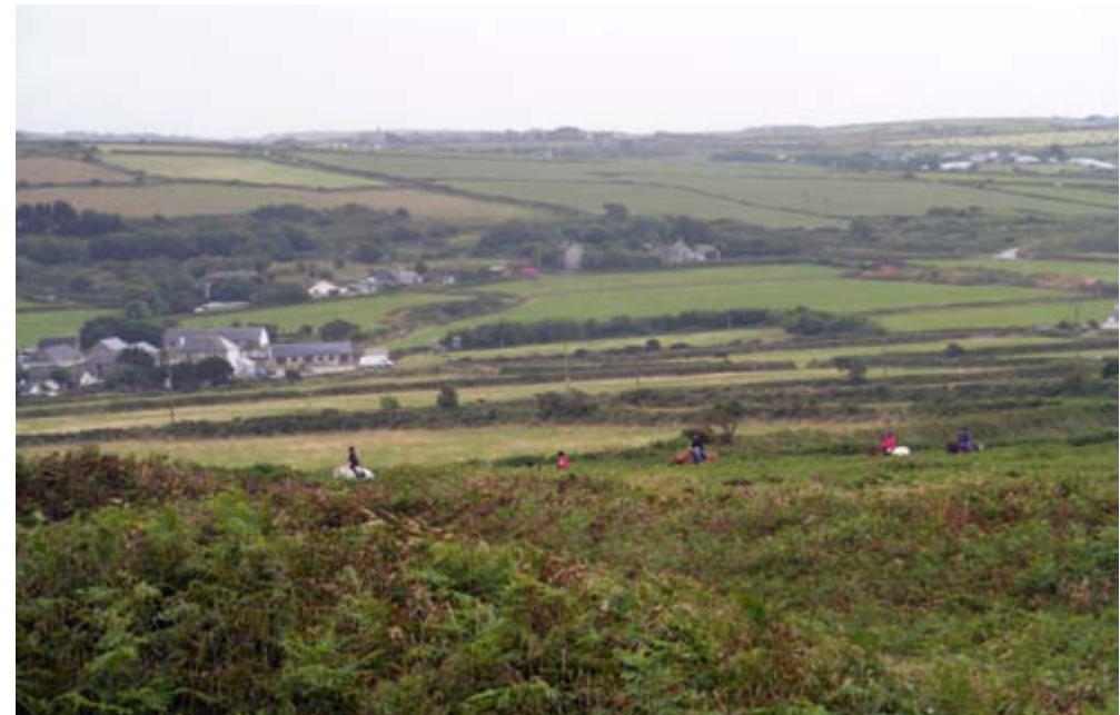
Riding at Carn Brea.

Local visitors who enjoy walking, horse riding or cycling along some of the NCA's rights of way use the area. The public rights of way network consists of miners' track ways linking settlements and a low density of small country lanes. Visitor attractions associated with the industrial heritage include the King Edward Mine Museum and the Poldark Mine. Stithians Reservoir is also an attractive spot for visitors as it offers many activities such as windsurfing, for which it is famous, kayaking and archery lessons. There are also several bird hides at the lake which is home to many different bird species as well as being a stop-off point for various migratory birds including ducks and warblers.