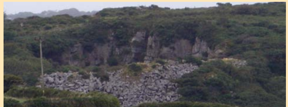
Granite quarrying in the south of the NCA.