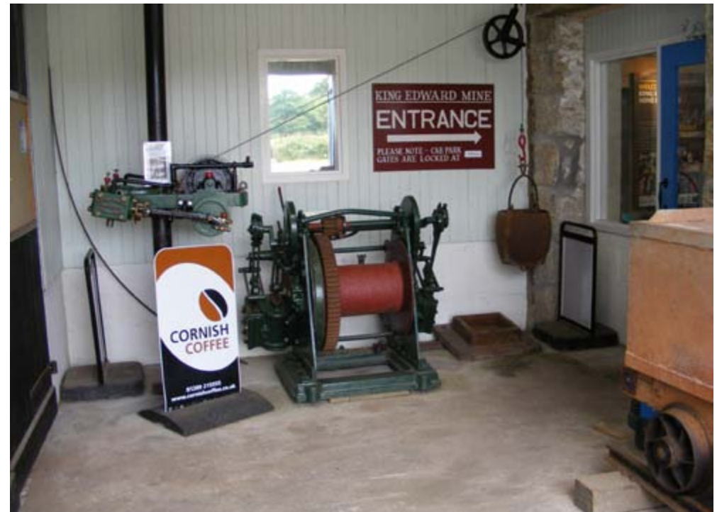
The entrance to King Edward Mine, a former tin mine and now hosts a museum.