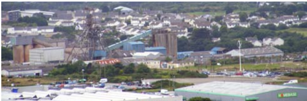
South Crofty Mine, the last working tin mine in England.