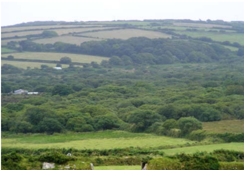
Dense valley woodlands.