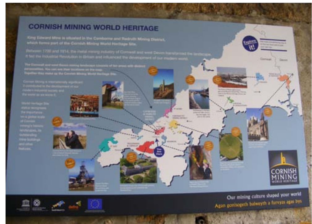
The position of Carnmenellis in The Cornwall and West Devon World Heritage Site.

The Carnmenellis NCA is linked to the rest of Cornwall through its rich historic industrial heritage. The Great Flat Lode, a mineral-rich seam stretching through the area, was at the heart of the mining revolution in Cornwall and Carnmenellis supports three areas of the Cornwall and West Devon Mining Landscape World Heritage Site.