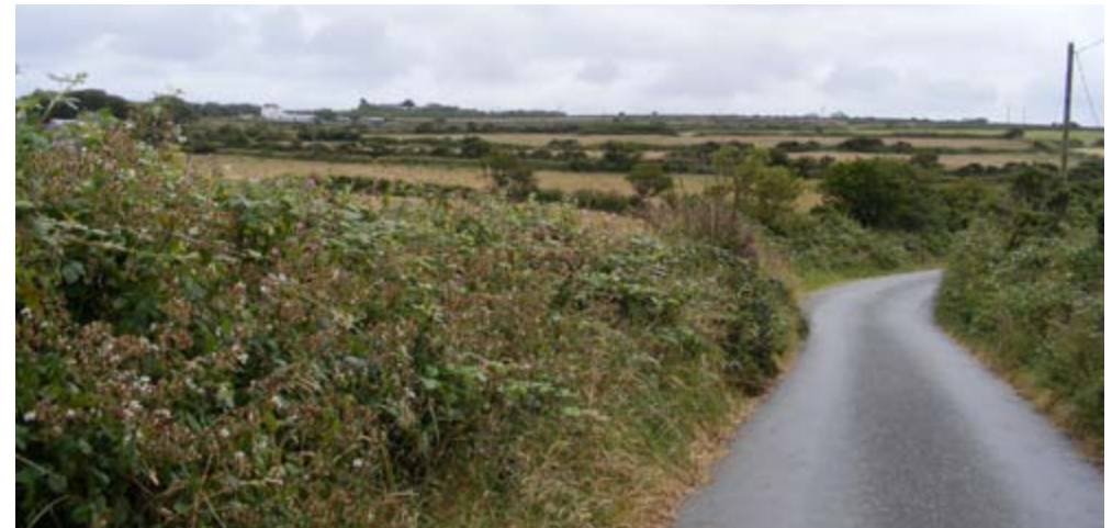
Small fields bounded by low Cornish hedges.