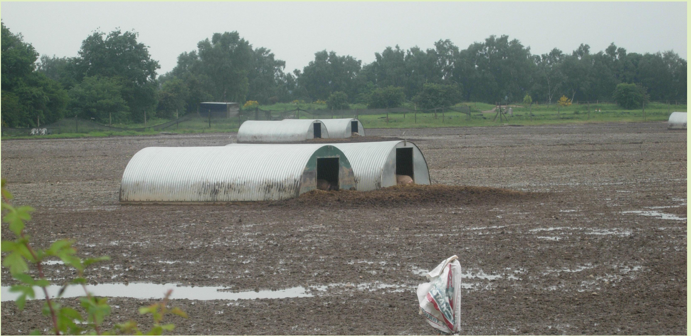
Outdoor pigs in Source Protection Zone 1 at Rufford. The farmer has since entered HLS to remove pigs from this field