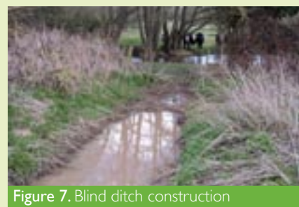
Figure 7. Blind ditch construction

Robert sits on the Catchment Steering Group for the Test and Itchen and encourages other farmers to engage with CSF. He's set up some trial sites to demonstrate to other farmers the difference in soil run off and capping on direct drilled, reduced tillage and ploughed fields. He also gave a farm walk to demonstrate the simple measures which can be implemented in order to help reduce diffuse pollution from agriculture.