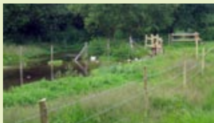
Figure 3. Drinking bay following fencing and pump installation

Grange Farm also has some of the steepest slopes in the catchment with silty soils prone to capping and run off to adjacent SSSI water meadows. Cattle from Grange Farm drinking from the stream, and freely accessing