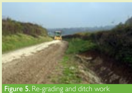
Figure 5. Re-grading and ditch work

3. The farmer was already leaving margins and field corners to help cut sediment loss but on the steepest field Kate and the farmer agreed to extend the margin from 6 metres to 20 meters - funded under Environmental Stewardship Scheme because of the protection it gave the river.