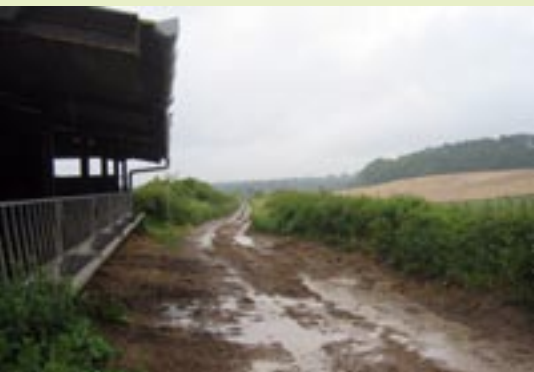
Figure 1. Cattle shed at the top of the track which contributed to the run off and contamination problems on the track – before improvements were made to the guttering

Analysis estimates nearly 15% of the Cheriton tributary at 'moderate risk' from soil erosion and high phosphate and nitrate levels. The problem is exacerbated by shallow chalk soils which increase the risk of nutrients leaching into the groundwater.