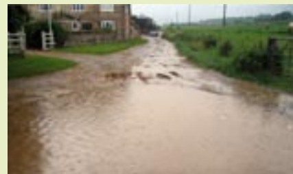
Figure 6. Runoff at bottom of track

5. The farmer is now thinking of reducing the number of cattle on the