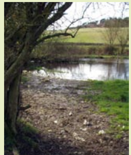
Figure 2. Cattle drinking bay prior to restoration