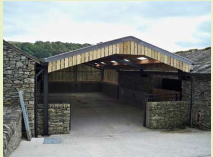
Roofed livestock gathering area

The Catchment Sensitive Farming Officer will also be working with Town End Farm to produce a nutrient management plan. This will assess the nutrient levels of the land, nutrients available on the farm from manures and help target fertiliser applications and ensure that applications meet the requirements of the grass. The result will minimise excess application of nutrients thereby reducing the likelihood of nutrient run off.