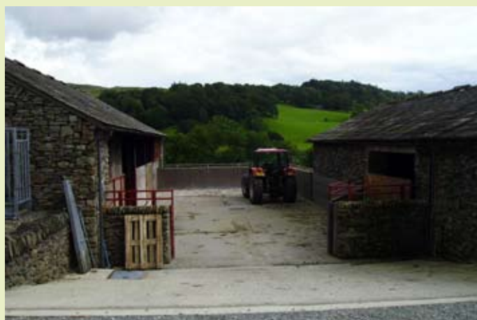
Livestock gathering area

The land is predominantly pasture, with some land on the fells and is stocked with a combination of beef and sheep. The Freeman's keep pedigree Limousin cattle, which are housed over winter. The buildings on the farm are typical of a Lakeland hill farm and are protected so any developments are tightly monitored to ensure that the character of the valley is maintained.