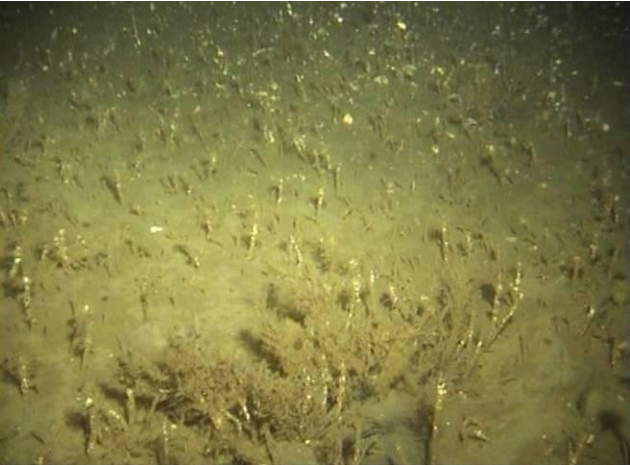
Plate 3: Fine sand colonised by sand mason Lanice conchilega