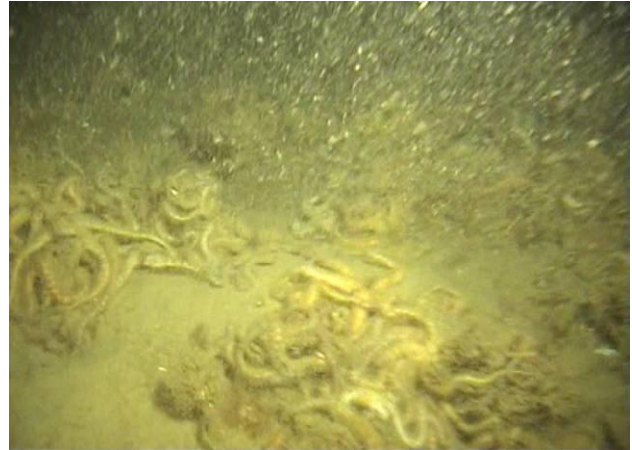
Plate 4: Medium sand with shell and silt; with brittlestars Ophiothrix fragilis