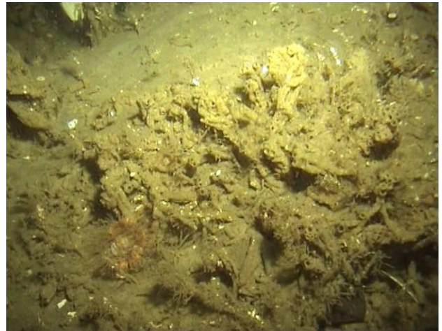
Plate 2: Fine sand and Sabellaria spinulosa crust