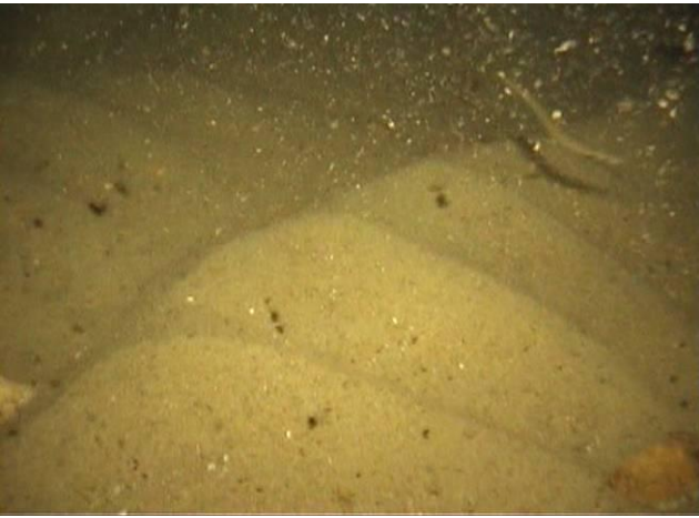
Plate 1: Medium rippled sand with sand eels Ammodytes sp