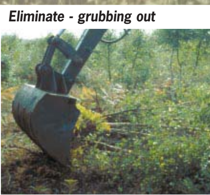
Eliminate - grubbing out