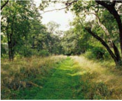
Enhance - increase extent