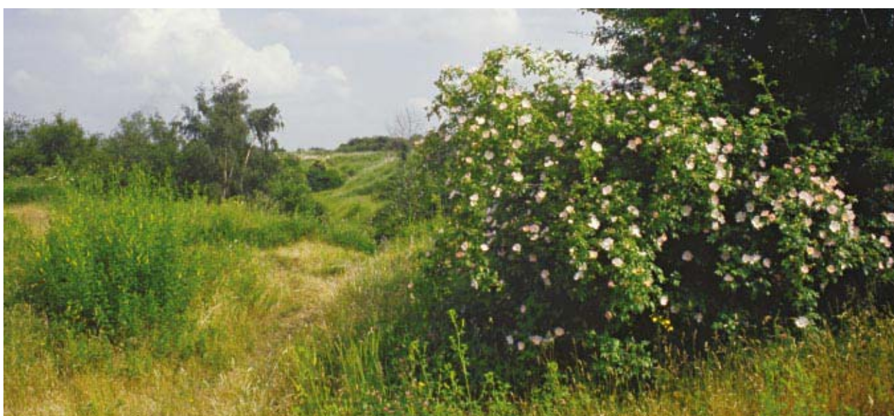
Swanscombe Skull Site NNR, Kent.

The Nature Conservation Review (Ratcliffe 1977) includes a section on calcareous scrub, while passing mention is made to heathland, montane and upland scrub. A list of