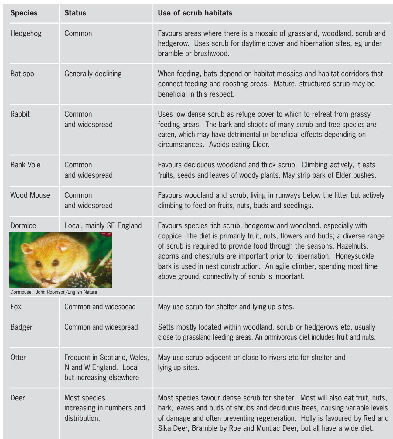
Dormouse.