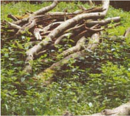
Enhance - improve quality