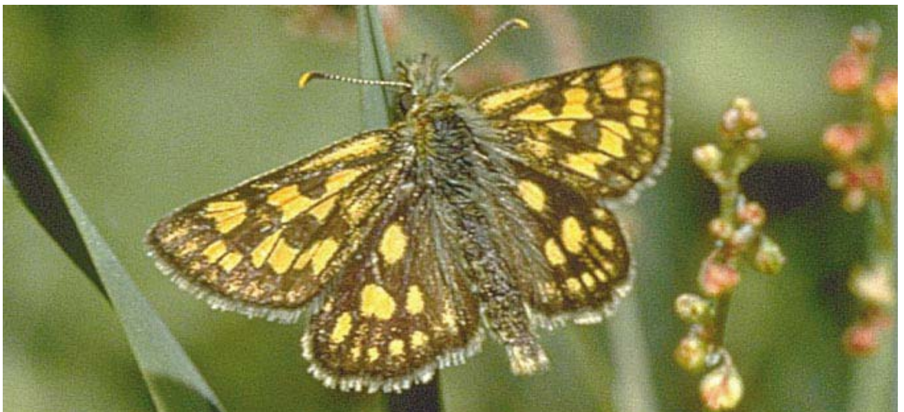
Chequered skipper.

Some shrub species, such as Juniper, which occupy a wide range of habitat types over a wide geographic range can have a high proportion of genus specific insects associated with them (41% for Juniper). The Maple, Willow and Rose families are also widely distributed, and they have relatively high proportions of genus specific species (31%, 29% and 20% respectively). The insects feeding on these genera are mainly those that feed externally on the plant, these include gall midges and mites, leaf mining micro-moths and aphids. Introduced shrubs generally have no genus specific insect species associated with them, only Tamarisk of the four non-native species has any genus specific species associated with it. [308:- 3.2.5 Specificity of insects to the shrub genus , p60]