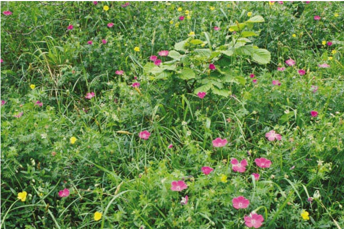
Bloody cranesbill.

There are a number of factors determining the species richness and composition of the ground flora; site management – present and historic, the proximity of potential colonists and successional stage of the scrub. Scrub cover in excess of 50% begins to shade the associated ground flora leading to the eventual loss of that community. Some of the affected species have long seed viability, but for most species the seed bank deteriorates quickly under the closed canopy [308:- 4.2.1.2 Ground flora, p72]. Table 2.6, lists a selection of scarce herbaceous plants and their association with scrub.▶