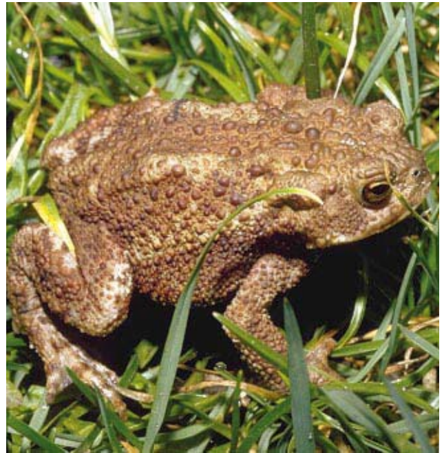
Common toad.