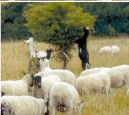
Maintain - grazing and browsing