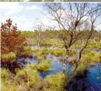
Reduce - water inundation