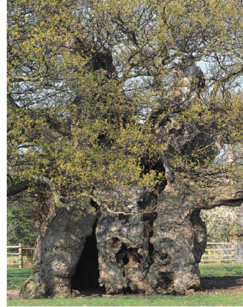
Figure 1. A veteran oak tree in Lincolnshire.