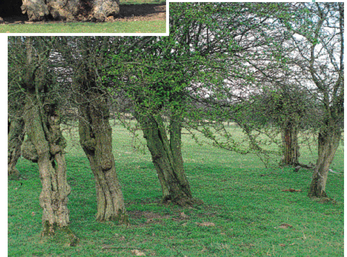
Figure 2 . Veteran hawthorn pollards at Croft Castle (Hereford).