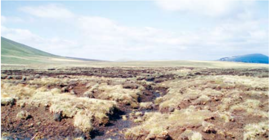
Blanket Bog Erosion, Matterdale Common