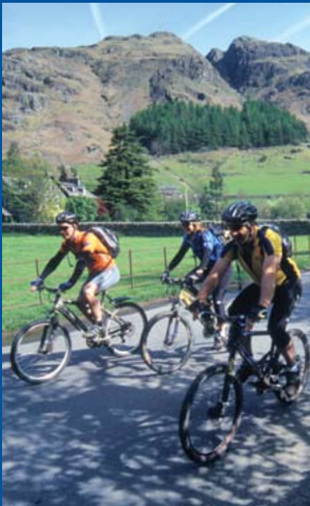
Cyclists in Langdale

Evidence from the UK Climate Impacts Programme (2002) shows that the climate in the Cumbria High Fells over the coming century is likely to become warmer and wetter in winter and hotter and drier in summer. In addition, rainfall intensity will probably increase. Extreme events such as heat waves and storms are predicted to increase in frequency and severity.