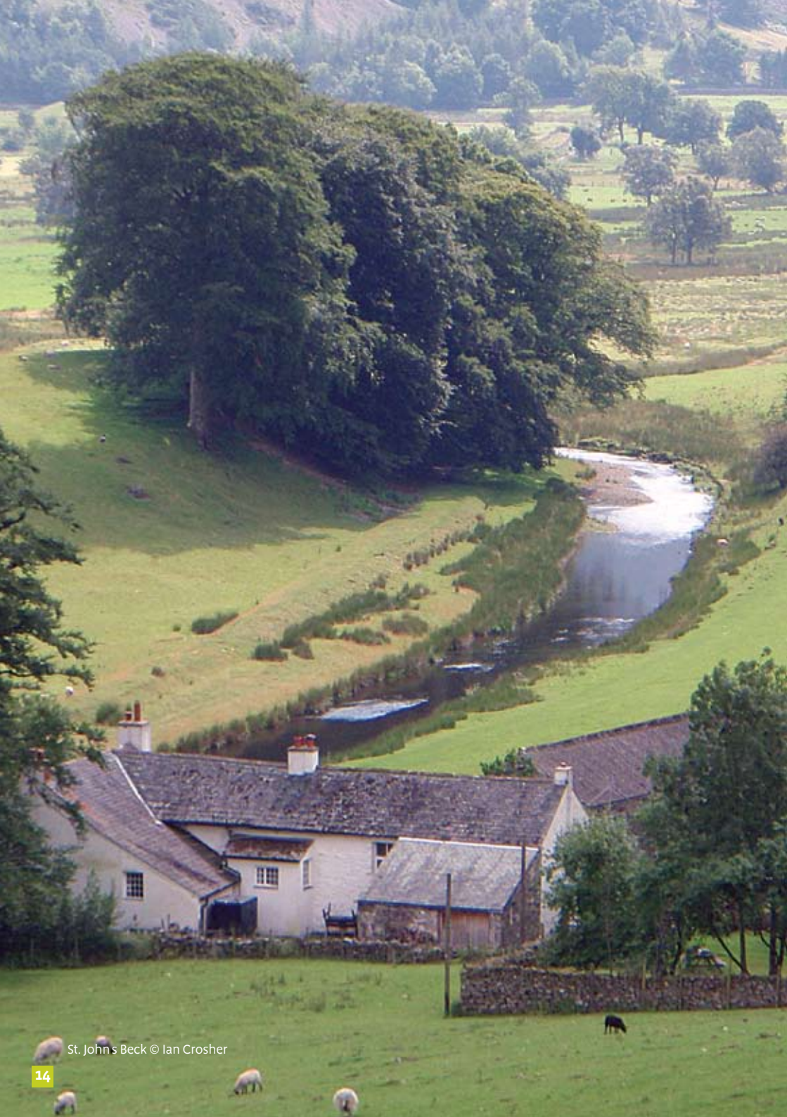
St. John's Beck